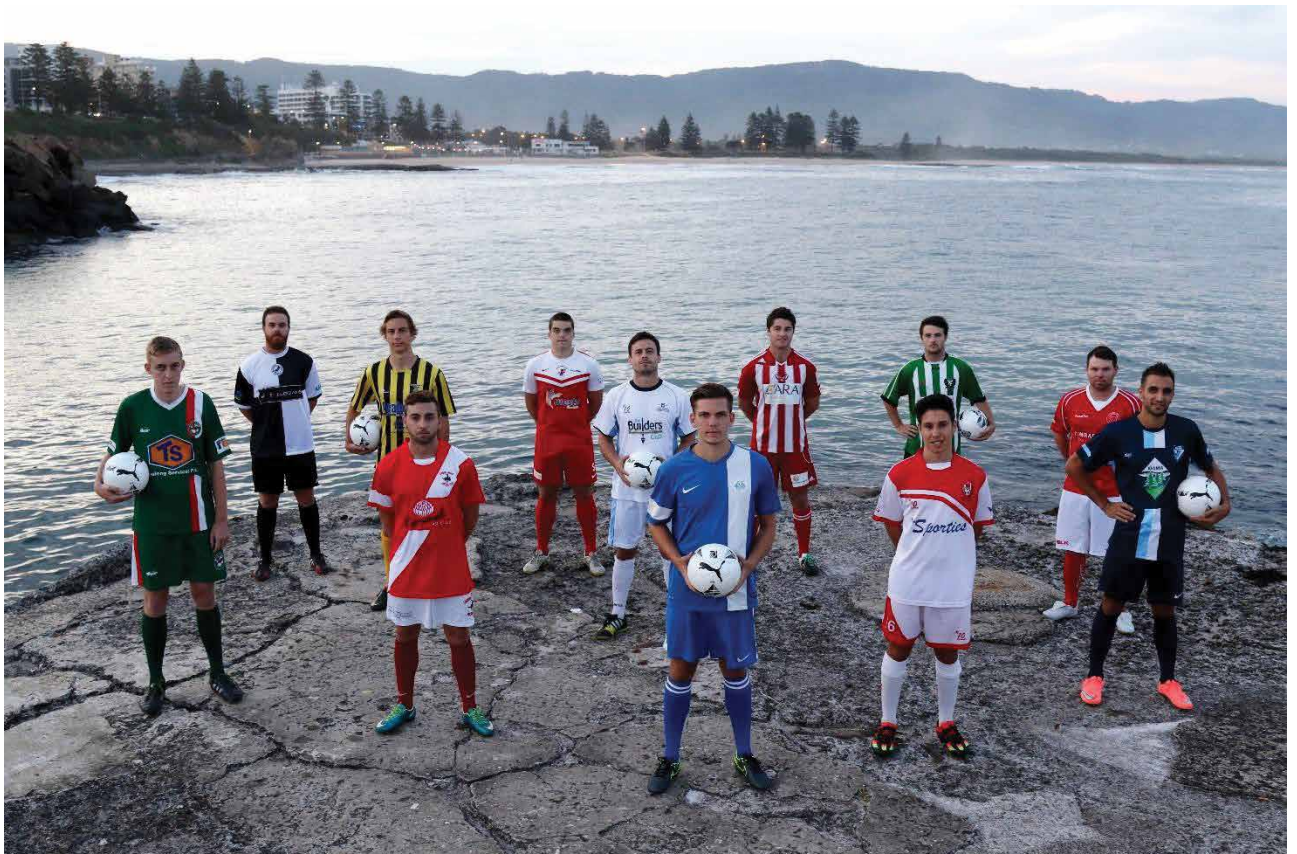
WGC Cranes District League Clubs – Picture Above