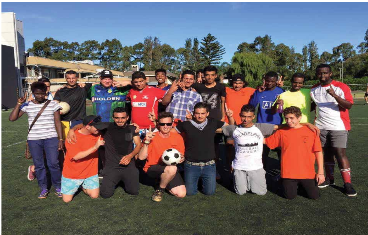
(Players from the Illawarra Multicultural Services program)

Weekly informal games were played with refugees and players from the wider community, forging new connections. It was also an opportunity for the wider community to engage with people from refugee backgrounds in a healthy and positive environment.