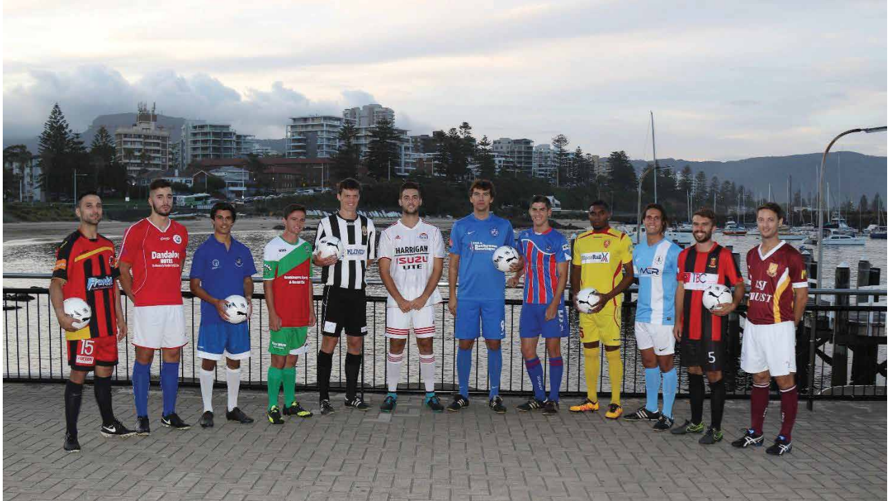
Illawarra Mercury Premier League Clubs – Pictured above

Season 2016 was exciting from start to finish in both the Premier League, District League and Community League competitions. The IPL and IDL were realigned to 12 competing clubs whilst the Community League saw the introduction of two grades within Division 1 which created a lot of interest with promotion and relegation now across all three leagues.