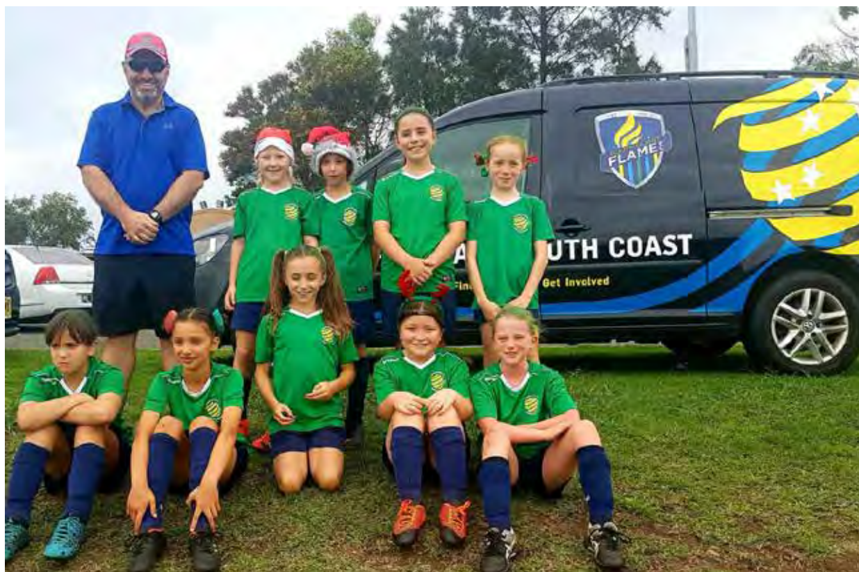
(Pictured above – one of our FSC Summer Football teams on the presentation day at Holy Spirit)

In 2018, games were held across numerous locations which included Thomas Dalton Park, Terry Reserve and Holy Spirit College. The competition provides a great opportunity to play in a social environment with friends and keep players active.