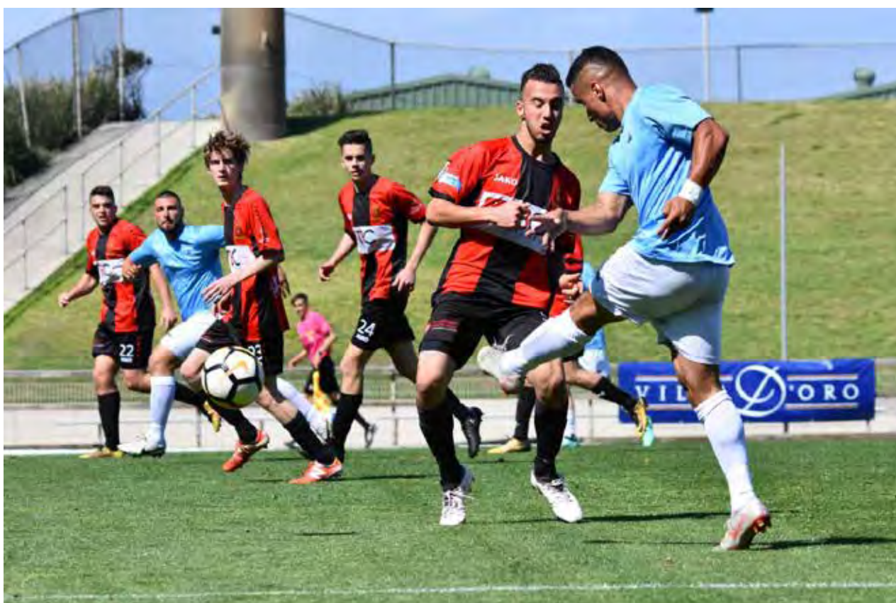
(Pictured above – Illawarra Premier League U23s Grand Final game between Cringila Lions FC and Corrimal Rangers. Cringila were crowned Grand Final Champions at WIN Stadium).