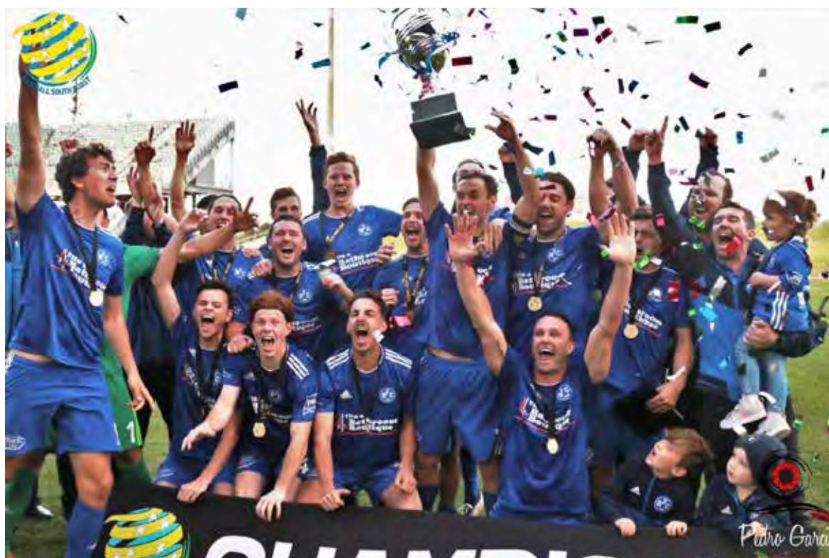
(Pictured above – Bulli FC, Illawarra Premier League First Grade League Champions and Grand Final Champions)

Winner – Port Kembla Runner Up – Cringila Lions