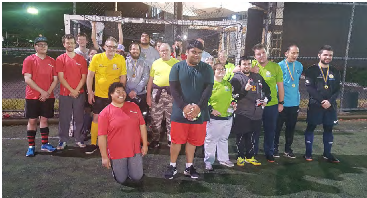
(Pictured above: Players from The Greenacres Futsal competition - The Disability Trust side won their fourth successive title)

The Disability Trust BlueScopeWIN Community Partners Sports Ready Group Day – with over 150 students from a variety of local primary schools attending the annual day.