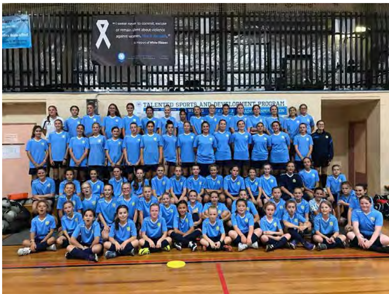
(Pictured above; Players from our female representative teams including SAP and Girls Conference League)

The success of our squads in the competition was an absolute highlight for everyone involved at Football South Coast, with all three age groups being crowned minor premiers after dominating throughout the season with the Under 14s and Under 17s taking out the Grand Final at Valentine Sports Park.