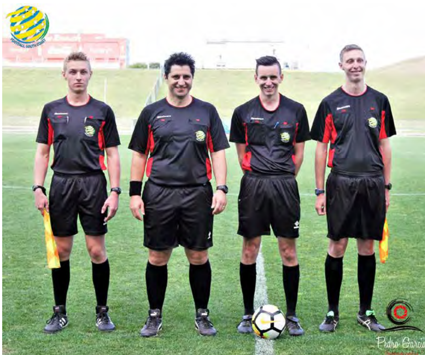
(Pictured above; the officials for the Premier League First Grade Final at WIN Stadium).