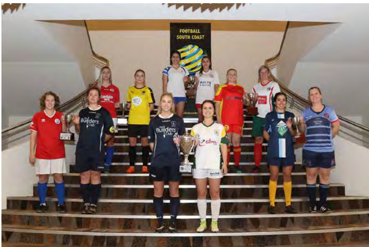
(Pictured above: Grand Finalists across the Builders Club Women’s Competition players across 6 Women’s Competition Divisions including the newly formed Women’s Youth League)