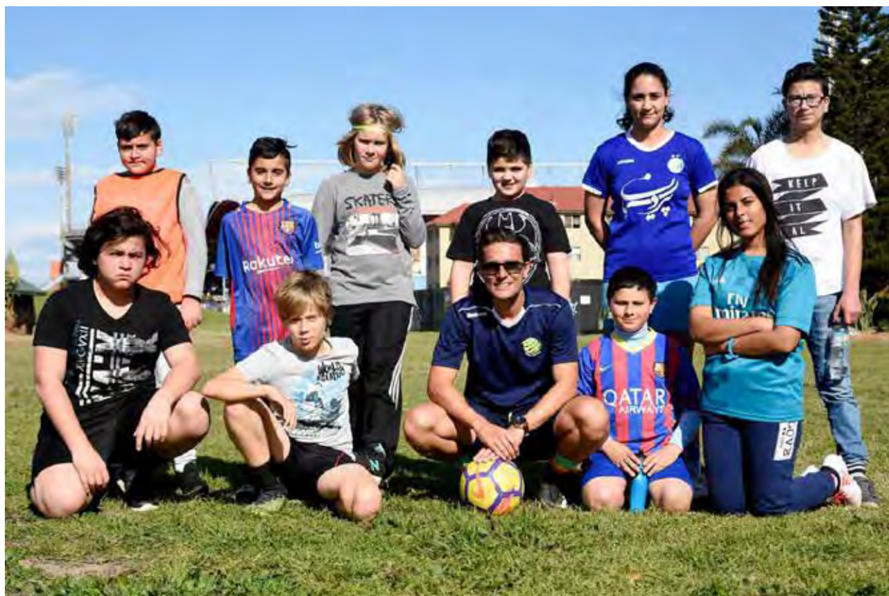
(Pictured above: Participants from a MCCI School Holiday Clinic held with FSC Community Development Officers)

The program was made possible with the financial assistance of the IMB Bank Community Foundation and proved to be so popular that it has continued beyond the 10 week pilot and is a weekly event for members of our community.