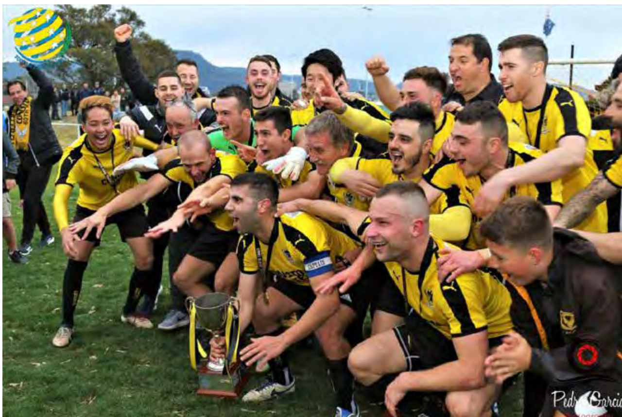
(Pictured above - Conistion FC who were the 2018 Illawarra District League Grand Final and League champions earning the right for promotion into the Illawarra Premier League)