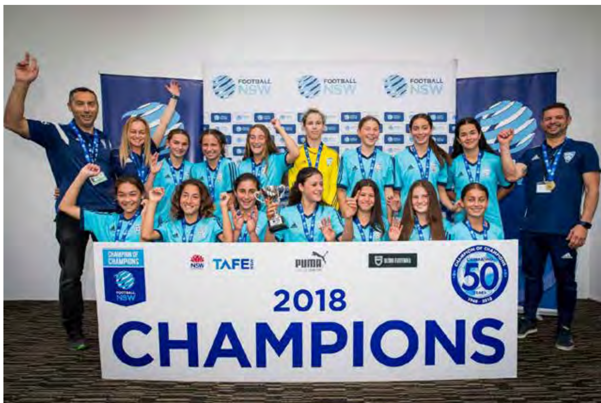
(Pictured above – Shellharbour Junior Football Club – Under 14 Girls – Champion of Champion Winners)