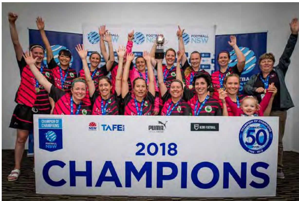
(Pictured above – Over 30's Women's Russell Vale Soccer Club – Champion of Champions Winners)