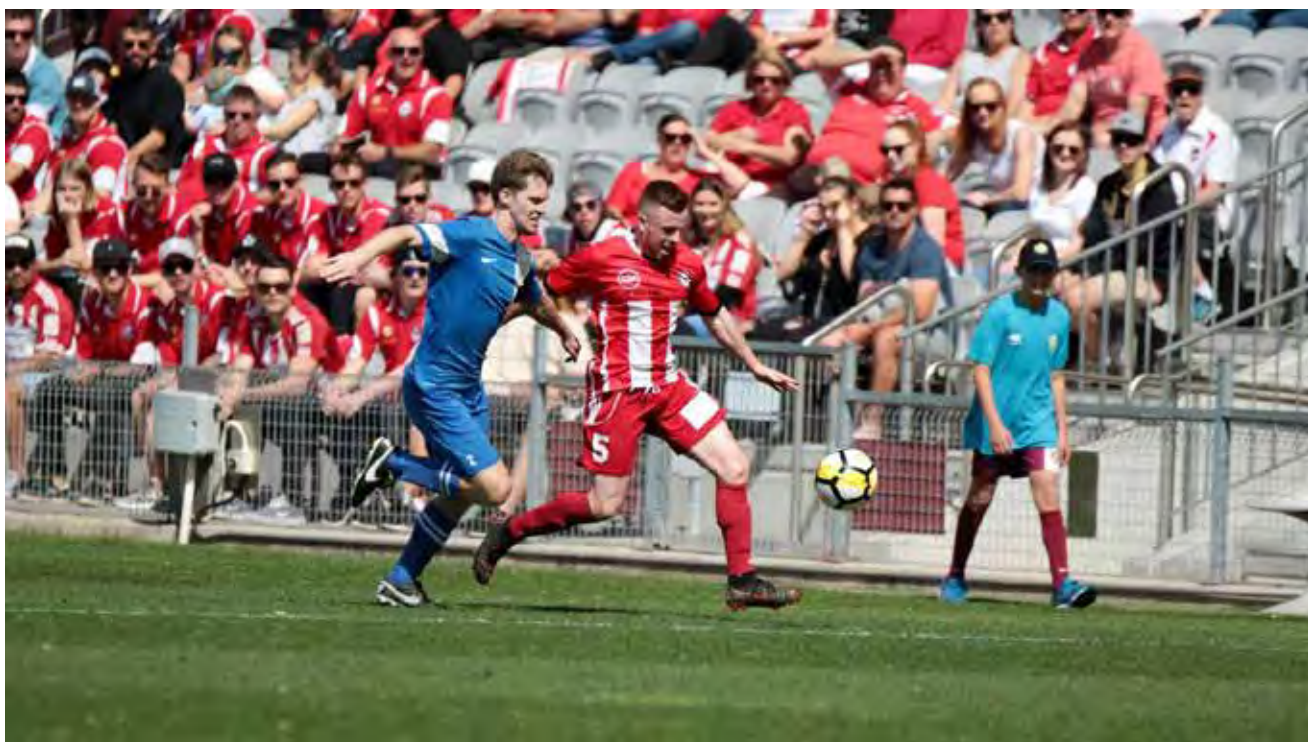
(Pictured above – Reserve Grade Grand Final action between Thirroul Thunder FC and Oak Flats Falcons)