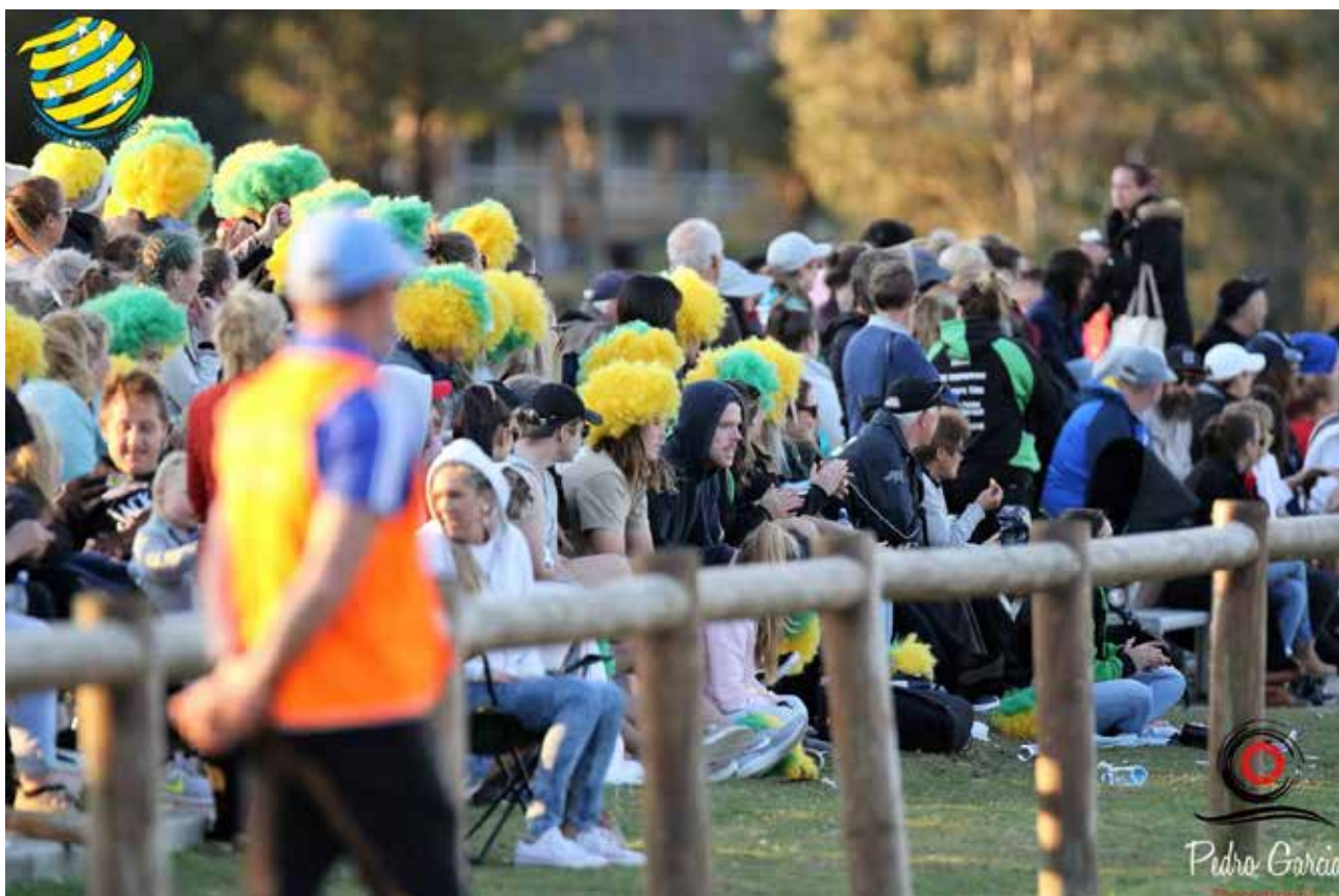
(Pictured above – spectators enjoying the Grand Final action across the Builders Club Women's Competition Grand Final games held at Myimbarr Sports Fields, Shellharbour)