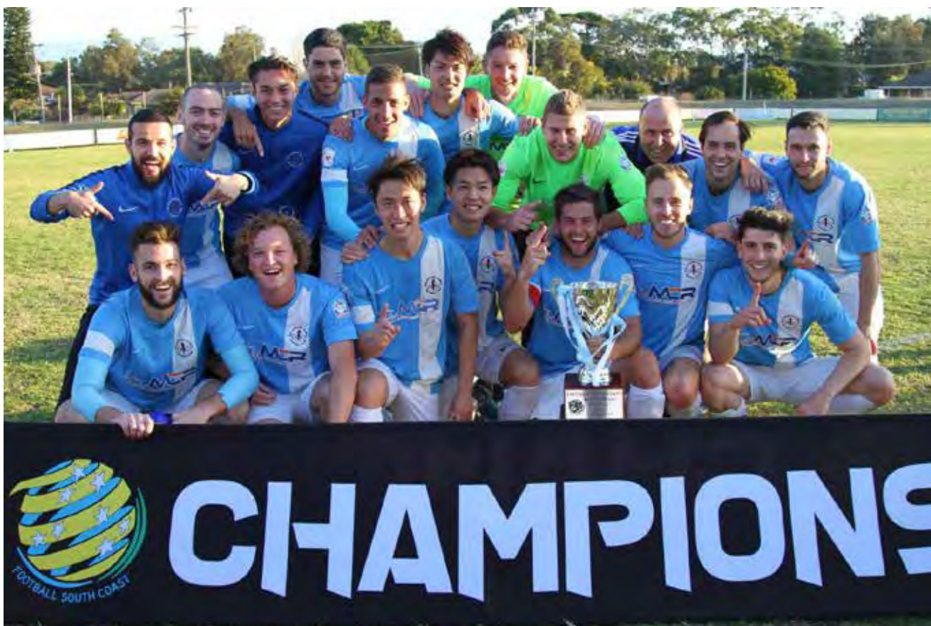
(Pictured above – Wollongong Olympic were the 2018 Fraternity Club, Bert Bampton Cup Champions winning against Corrimal Rangers at Wetherall Park, Primbee)