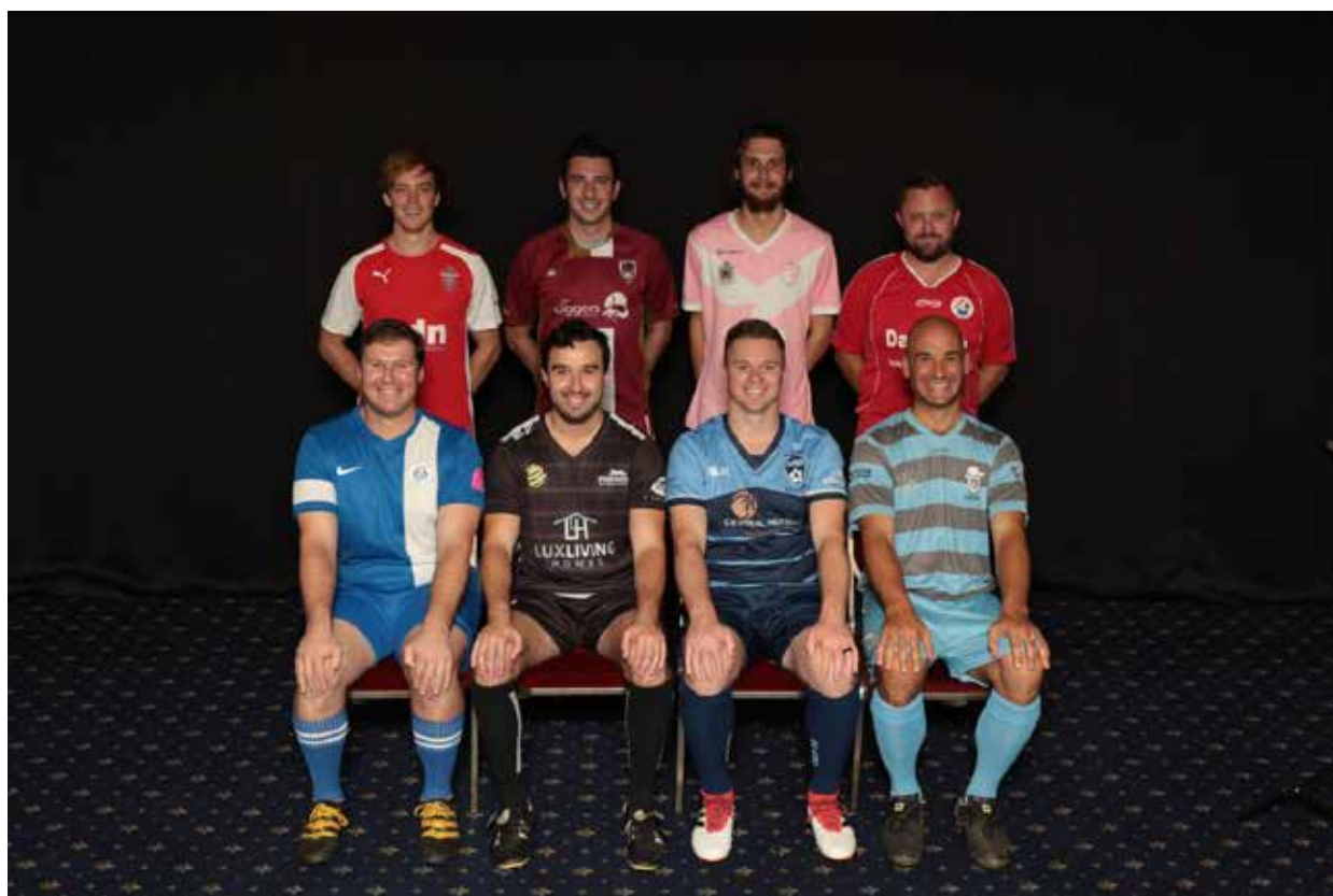
(Pictured above – Community League Division 1 Clubs . Top row from left; IFS Wolves, Uni Wolves, Coledale Waves, South Coast United. Seated, from left; Thirroul FC, Port Kembla Pumas, Oak Flats and Puckamia Bay Dugongs)

Masters 5 - Kiama Quarriers 1 over Woonona 0