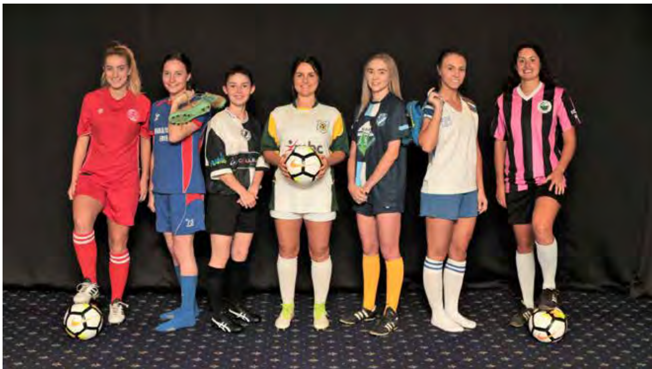
(Pictured above – players representing women’s teams. From left; Fernhill FC, Woonona FC, Balgownie Rangers FC, Albion Park SC, Kiama Quarriers FC, Thirroul Thunderbirds and Russell Vale SC)