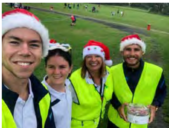
(Pictured above – the fantastic Summer Football support team)