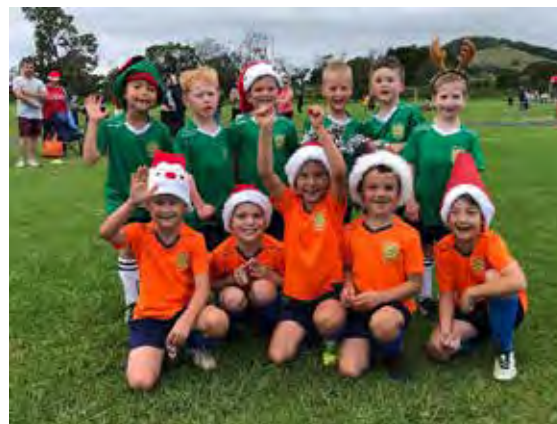
(Pictured above – players enjoying their final game)