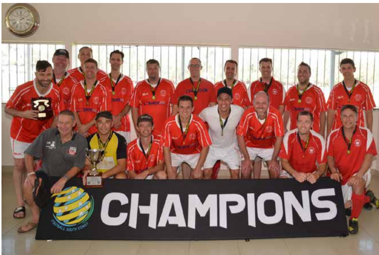
(Pictured above – players from the Fernhill IFS celebrating their Masters 4 Grand Final win at Macedonia Park)