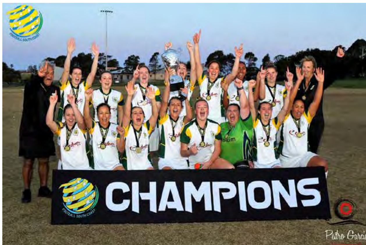
(Pictured above – Division 1, All Age Grand Final winners Albion Park FC)

League Champions – Thirroul Thunderbirds Runner Up – Warilla Juniors Grand Final Winners – Thirroul Thunderbirds Grand Final Runner Up – Warilla Juniors