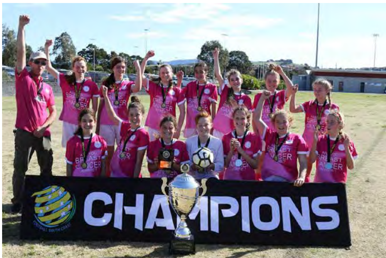
(Pictured above: Coledale Under 13 players who were victorious in the Division 1 Grand Final)