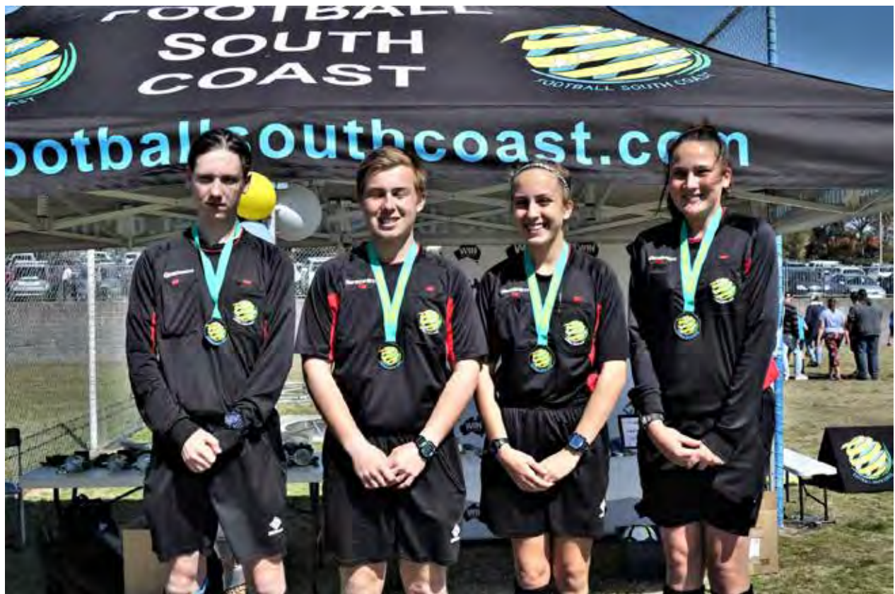
(Pictured above - FSC Referee's getting ready to officiate during our Junior Competition Grand Finals)

I would like to take the opportunity to thank all the staff in the Football South Coast office, for their assistance throughout the year, to assist the Referee's Council with our administration of the referee's.