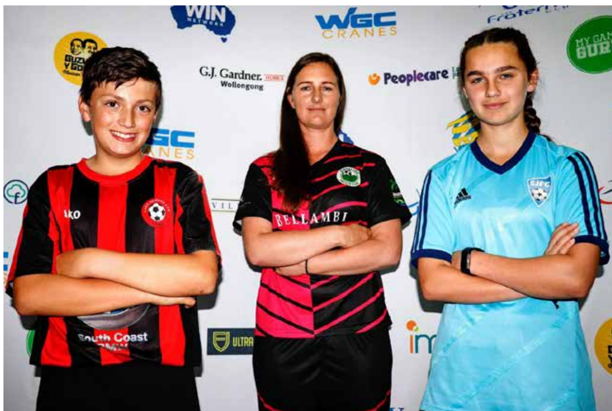
(Pictured above – Players from U13 Lake Heights, Russell Vale Over 30s and U14 Girls Shellharbour who were all finalists in the prestigious FNSW Champion of Champions tournament)

Under 13 Boys - Lake Heights Junior Football Club