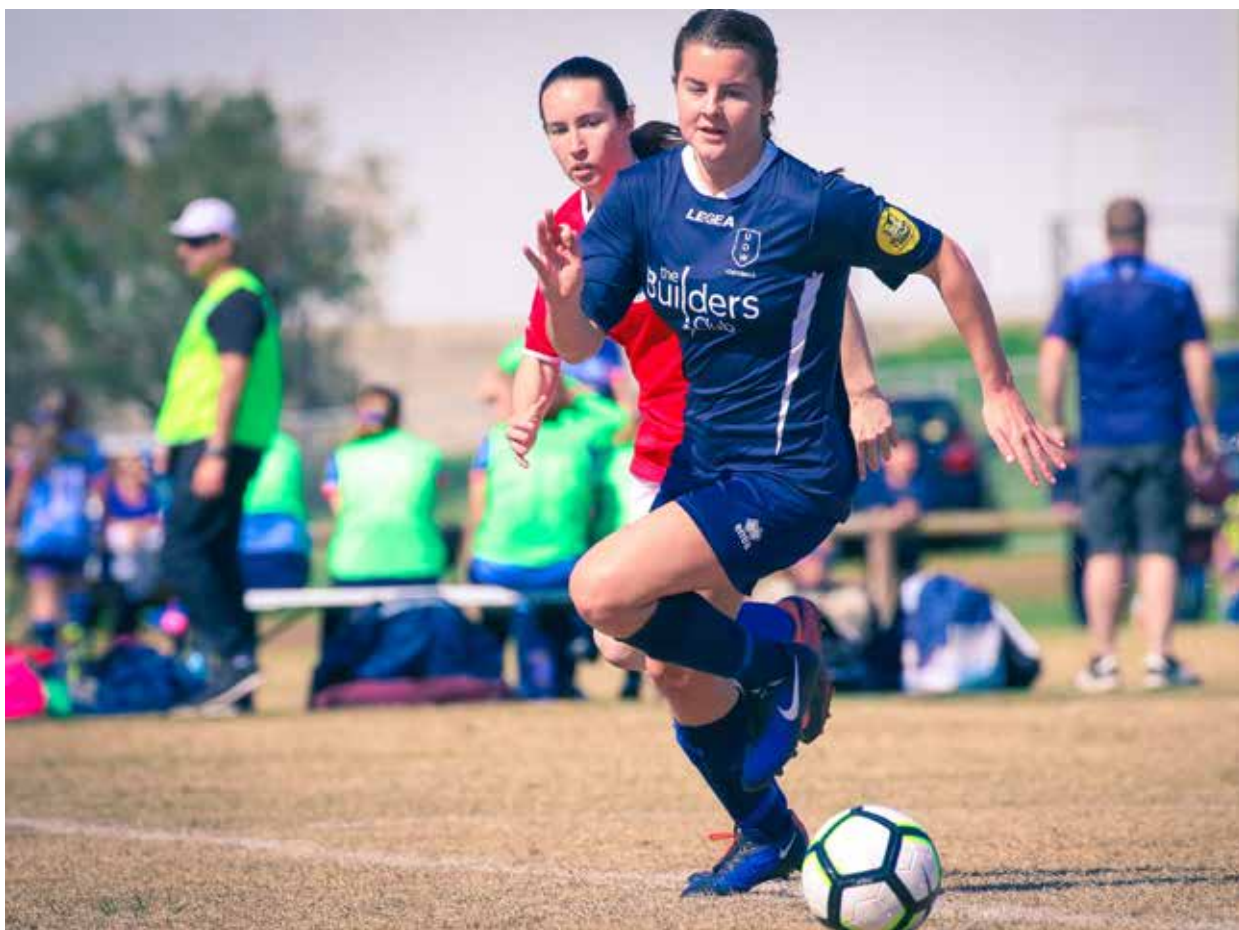
(Pictured above – Grand Final action between South Coast United and UOW FC in the Division 2 Grand Final. South Coast United were Grand Final Champions with a 1-0 win)