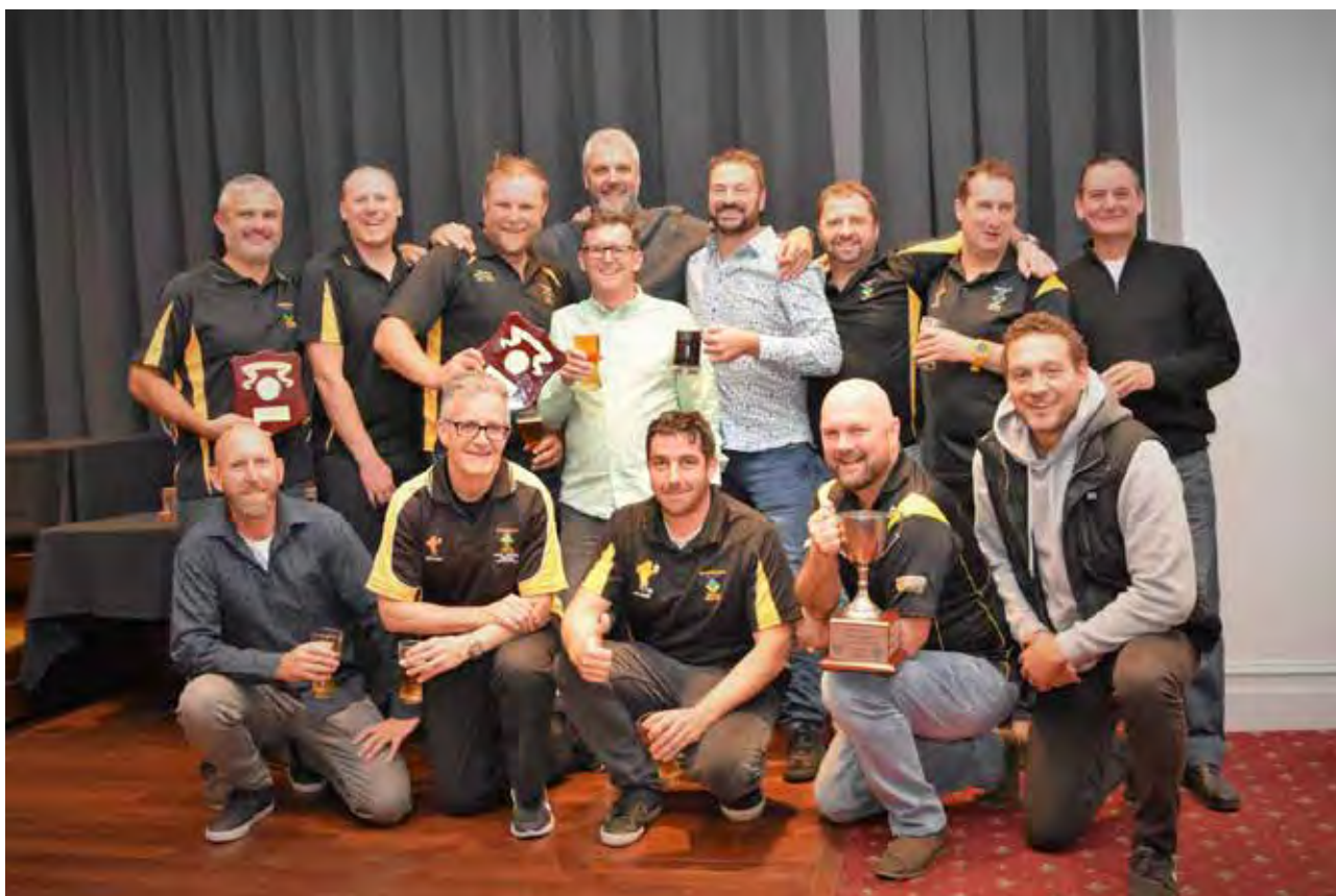
(Pictured above: Players from Helensburgh Community League teams celebrating a fantastic year at the end of year presentation night)