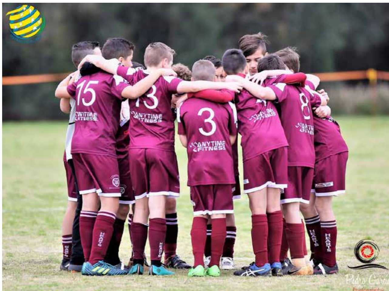
(Pictured above: Players from Unanderra Hearts before their Grand Final game against Kiama).