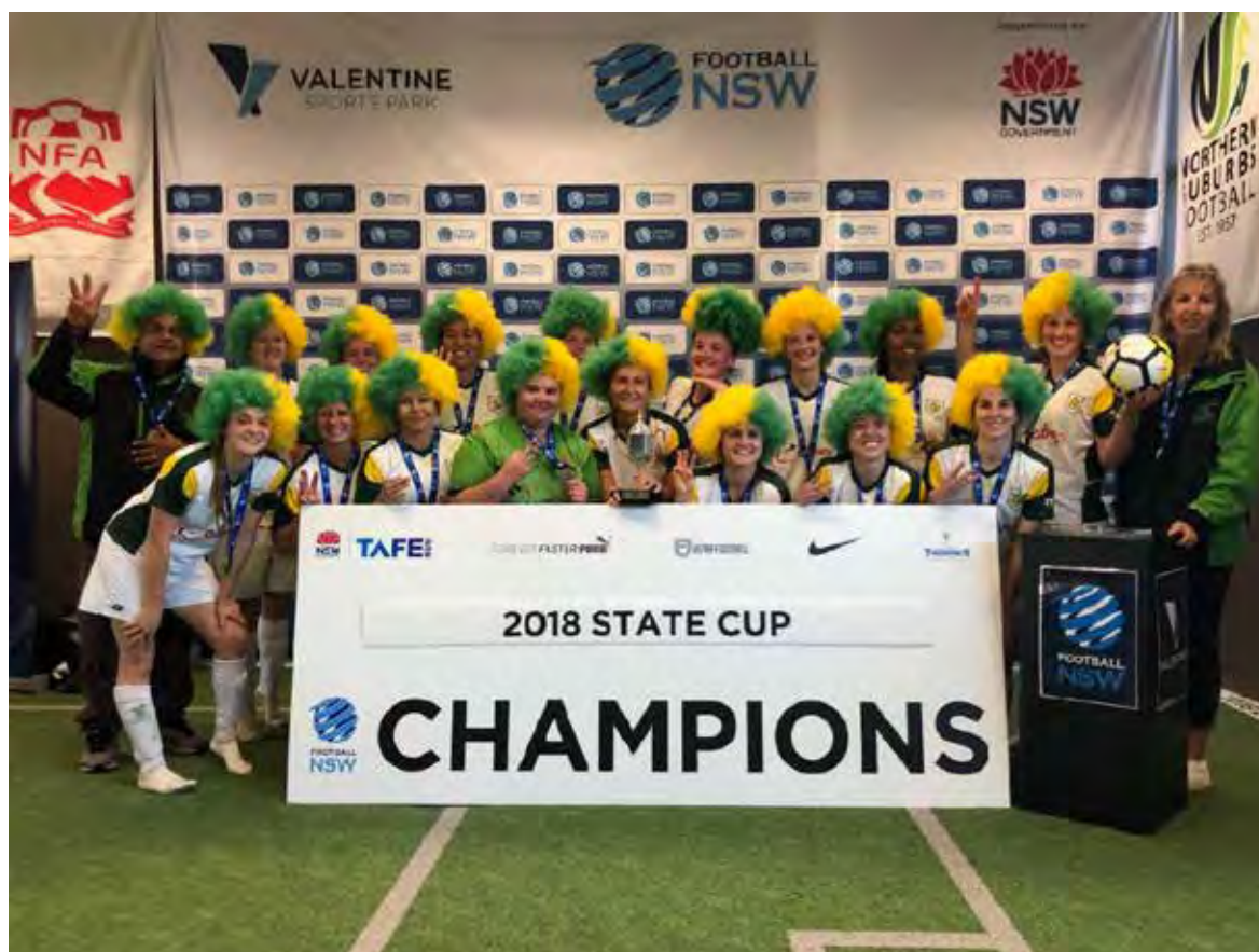
(Pictured above – Albion Park All Age Women's – State Cup Grand Final Winners)