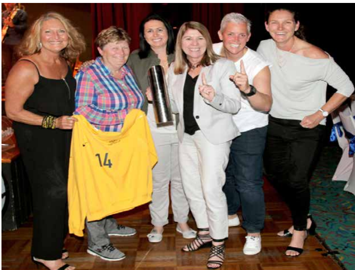
(Pictured above – Players from Russell Vale Pink celebrating their season)