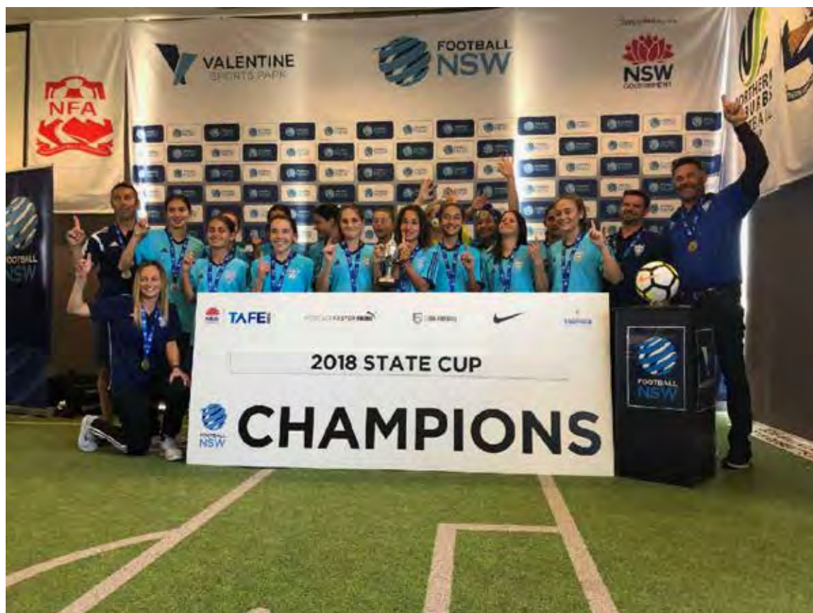
(Pictured above – Shellharbour Junior Football Club – Under 14 Girls – State Cup Grand Final Winners)