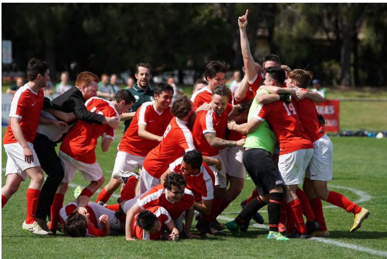
(Pictured above – Vale Banter Pups during the All Age 2, Second Grade Grand Final)