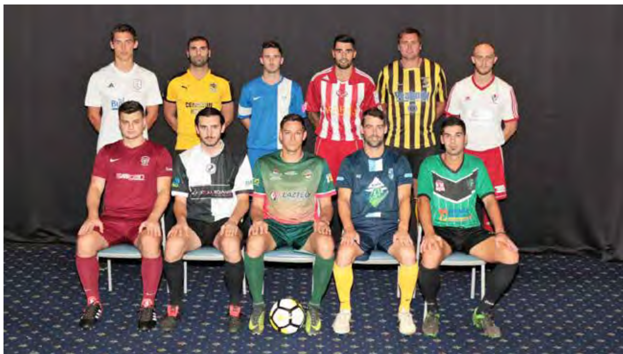
(Pictured above – Illawarra District League Clubs. Top row from left; UOW FC, Coniston FC, Thirroul Thunder, Warilla Wanderers, Helensburgh Thistle and Oaks Flats Falcons. Seated from left; Unanderra FC, Balgownie Rangers FC, Bellambi Rosellas FC, Kiama Quarriers FC and Berkeley FC).

The Youth Grade Grand finals was a robust game of football with Coniston Football Club running out winners 2-1 over the League Champions Helensburgh Thistles. Again, this fixture showed that football is alive and building along with the demonstrated performance of these players is representative of the competitiveness of the youth grade, that reinforces the future for several players.