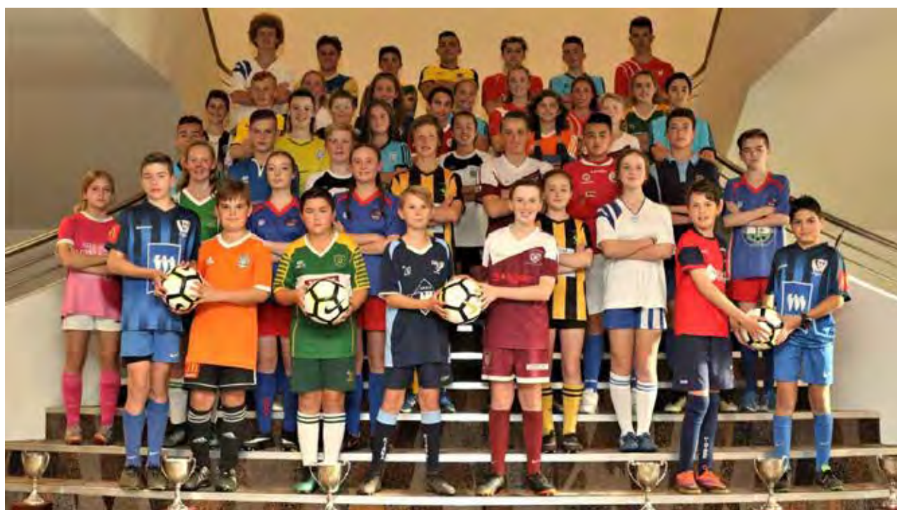
(Pictured above – Clubs involved in the 2018 Junior Grand Finals which were held at Myimbarr Sports fields in Shellharbour)