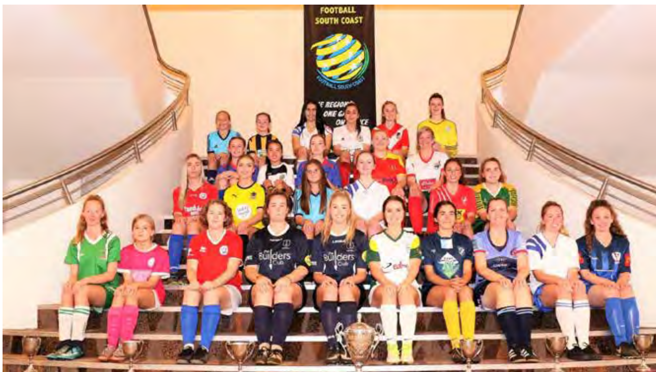
(Pictured above: Grand Finalists across the female Junior's and Women's Competition)