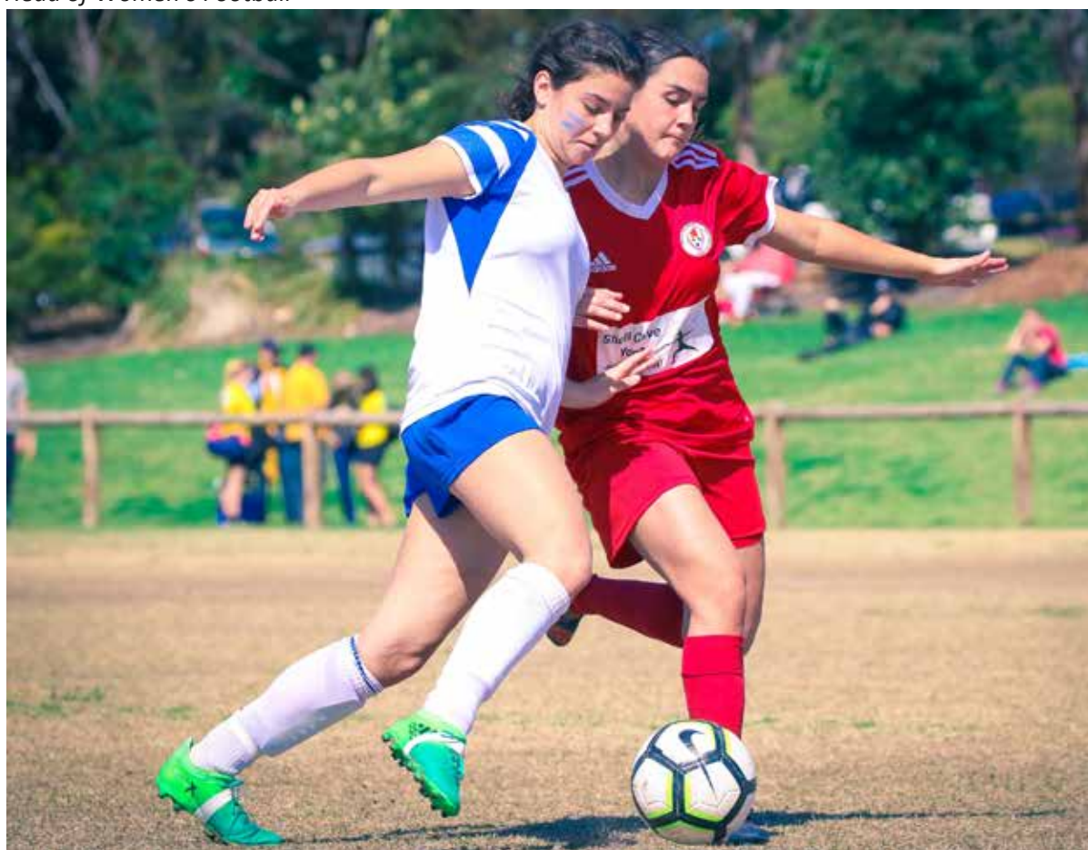
(Pictured above; Players from Thirroul Thunder and Warilla Junior FC in the Women's Youth League Grand Final)