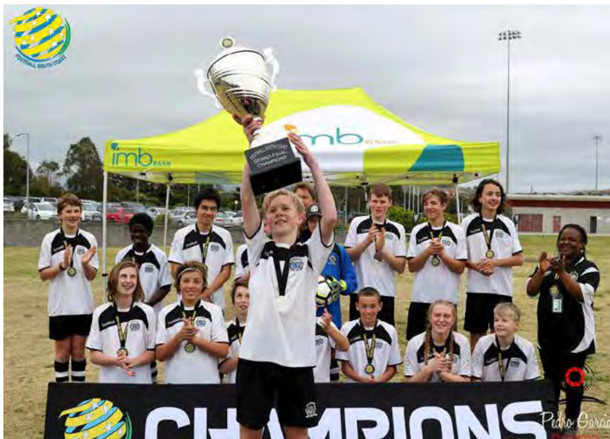
(Pictured above – players from the U14 Division 3 Balgownie Juniors who were Grand Final Champions in 2018)