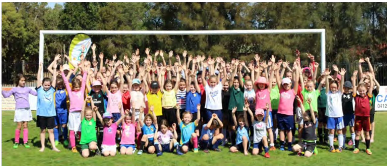
(Pictured above – Players from the IMB Bank Female Gala Day hosted at Terry Reserve)

Thank you to Albion Park JSC and their fantastic volunteers for hosting the day.