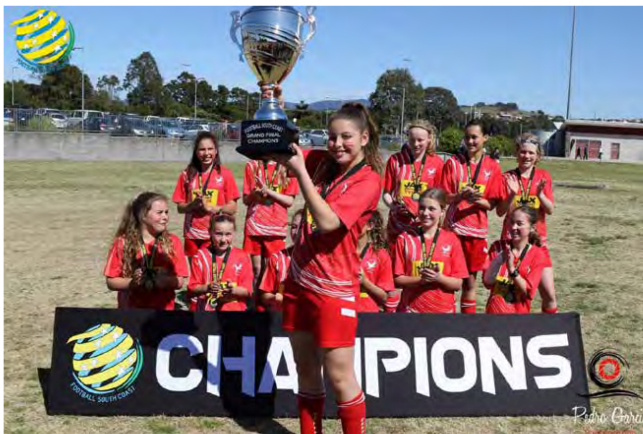
(Pictured above – the Grand Final winners from the Fernhill Juniors, Under 13 Division 2 competition)