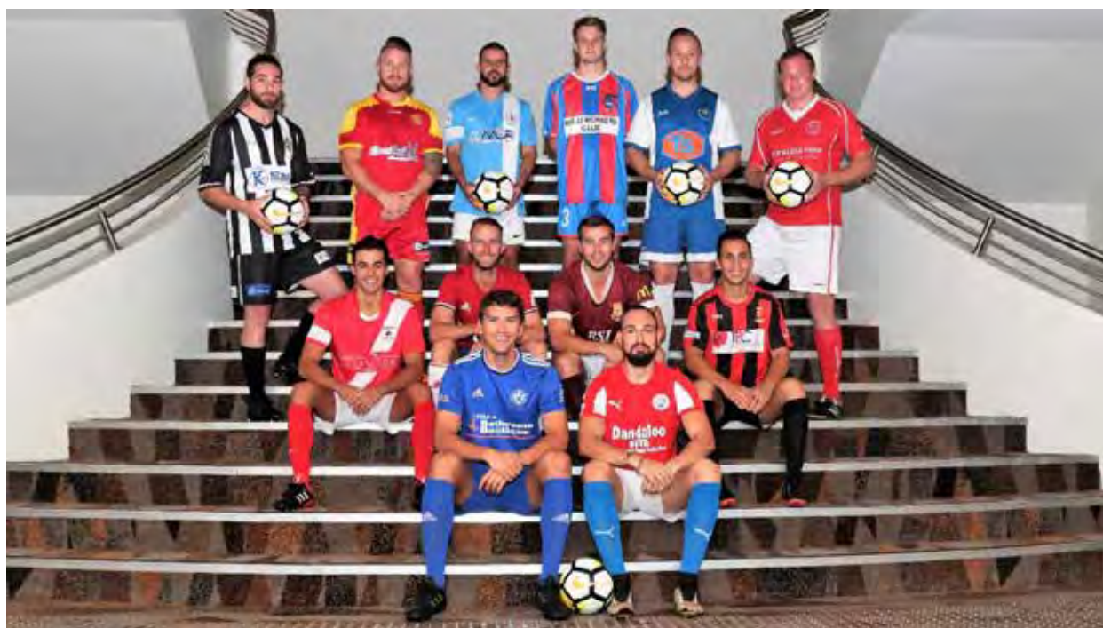
(Pictured above – Illawarra Premier League Clubs. Top row from left; Port Kembla FC, Wollongong United, Wollongong Olympic, Woonona Sharks FC, Tarrawanna Blueys and Fernhill FC. Middle Row; Corrimal Rangers, Albion Park White Eagles, Picton Rangers and Cringila Lions FC. Bottom row: Bulli FC and South Coast United FC).

The Youth Grade grand finals were hard fought with the League champions (Wollongong United) succumbing to a strong and resilient Bulli Football Club 2-0. It is evident that some of the youth on display showed maturity above their years and will place a few clubs in a positive position as they all build their future playing ranks.