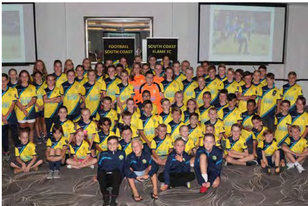
(Pictured above; Players from the FSC Mixed and Girls SAP Squads at the Season Launch held at The Grange)

The Association Youth League program continues to go from strength to strength after the 2017 season in which the program went to a full-time representative program. The importance of this pathway was evident in 2018 with the quality of competition and opposition from the likes of Central Coast and Sutherland Associations. The squads enjoyed great success throughout the season with our under 13s narrowly missing out on the finals football, the under 14s reaching the semi-finals and both our 15s and 16s falling just short in the grand final. A number of players were successful in being selected for NPL 1 football for 2019 and eight players from the Under 16s squad being selected into the South Coast Flame Under 18s which demonstrates further the success of the program in 2018.