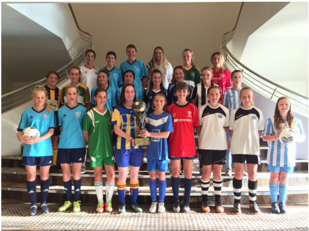
(Pictured above – Players representing junior clubs from all the female Grand Finalist teams. The Grand Finals were held on 10 September at Unanderra Oval. The day involved all female games across junior and women's competitions and celebrated the growth of female football).