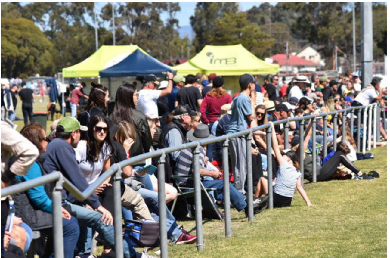
(Pictured above – spectators enjoying the Grand Final action across the Builders Club Women's Competition Grand Final games held at Unanderra Oval)