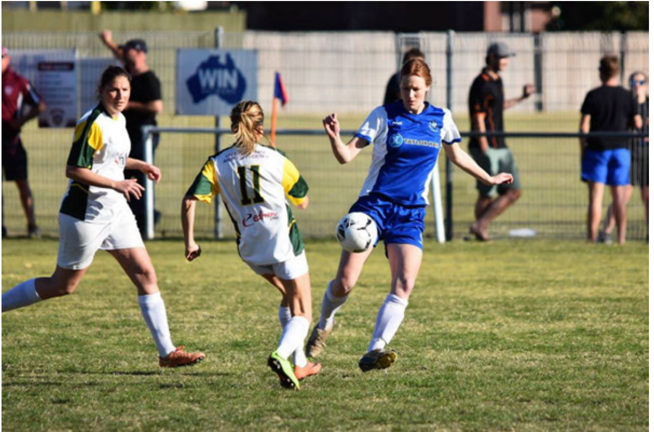
(Pictured above – Division 1 Grand Final action between Albion Park FC (White) against Tarrawanna (blue)