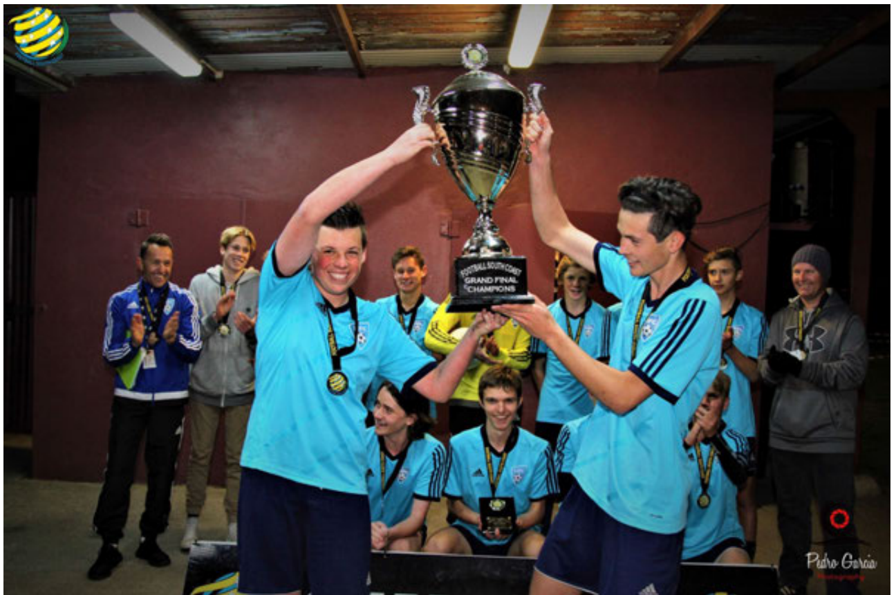
(Pictured above – players from the U16 Division 2 Shellharbour team who were Grand Final Champions in 2017)