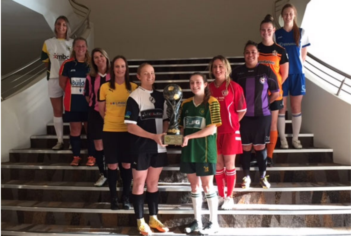
(Pictured above: Grand Finalists across the Builders Club Women's Competition. From left; Albion Park FC, University FC, Russell Vale Pink, Coniston FC, Balgownie Rangers, Albion Park U21's, Fernhill Vixens, Oak Flats Falcons, Dandaloo FC and Tarrawanna Bluey's)