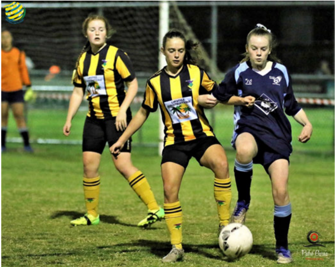
(Pictured above – Players from Helensburgh (black/ yellow) and Kiama (blue) battle out the Girls Under 14 Division 2 Grand Final)