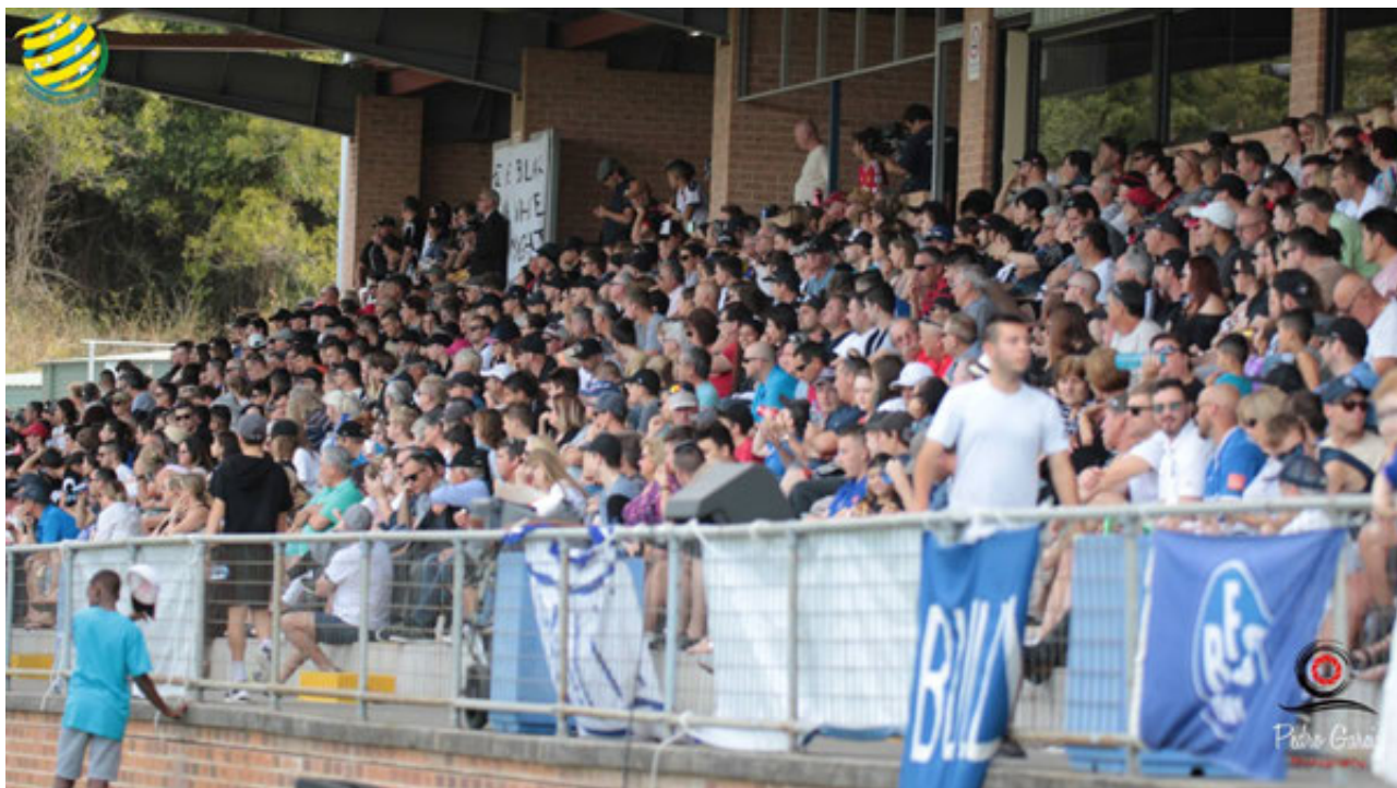
(Pictured above – a bumper crowd was on hand to watch the Illawarra Mercury Premier League Grand Finals across the U18, Youth Grade and First Grade Competitions)