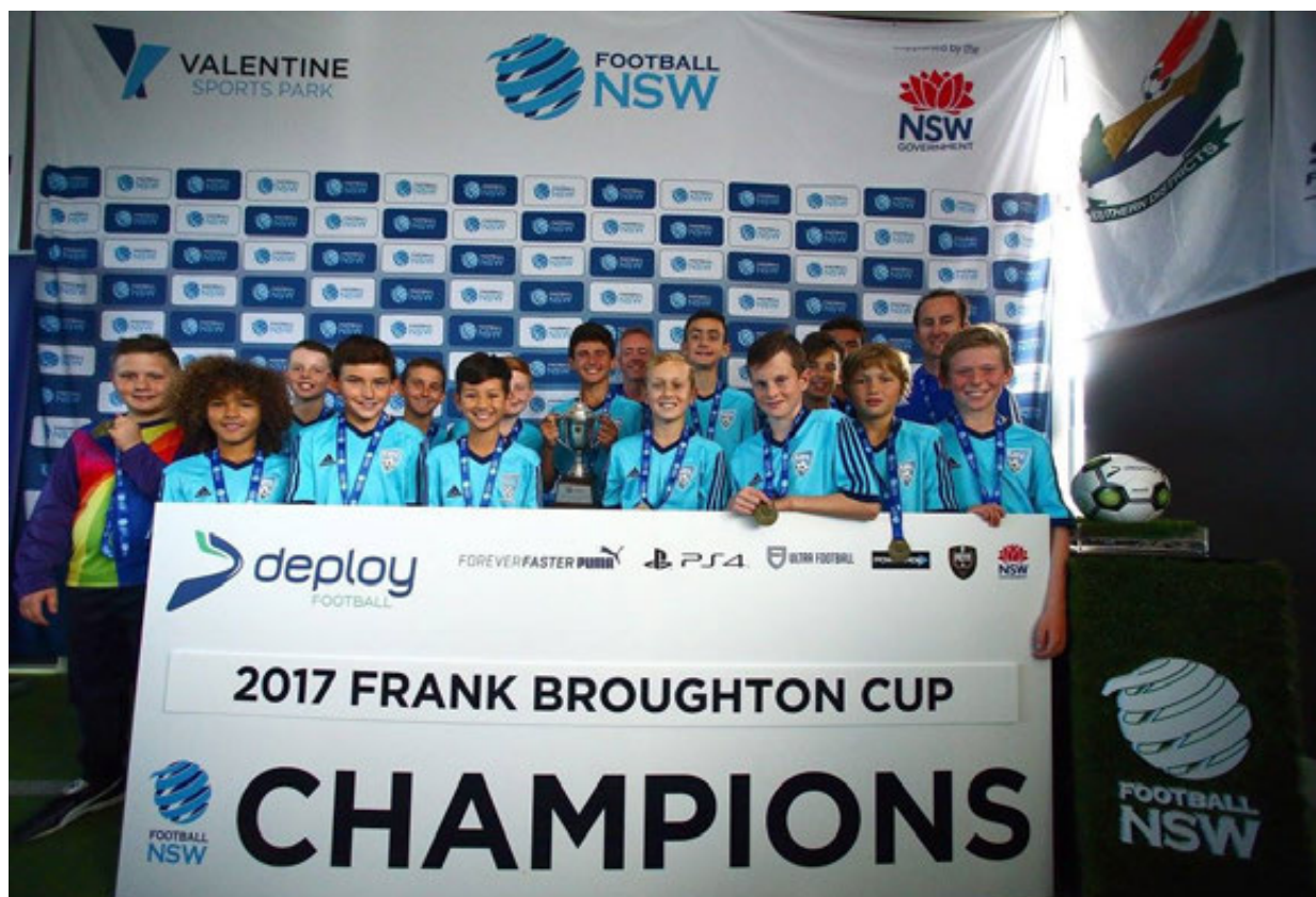
(Pictured above – Shellharbour Junior Football Club – Under 12 Boys – State Cup Grand Final Winners)