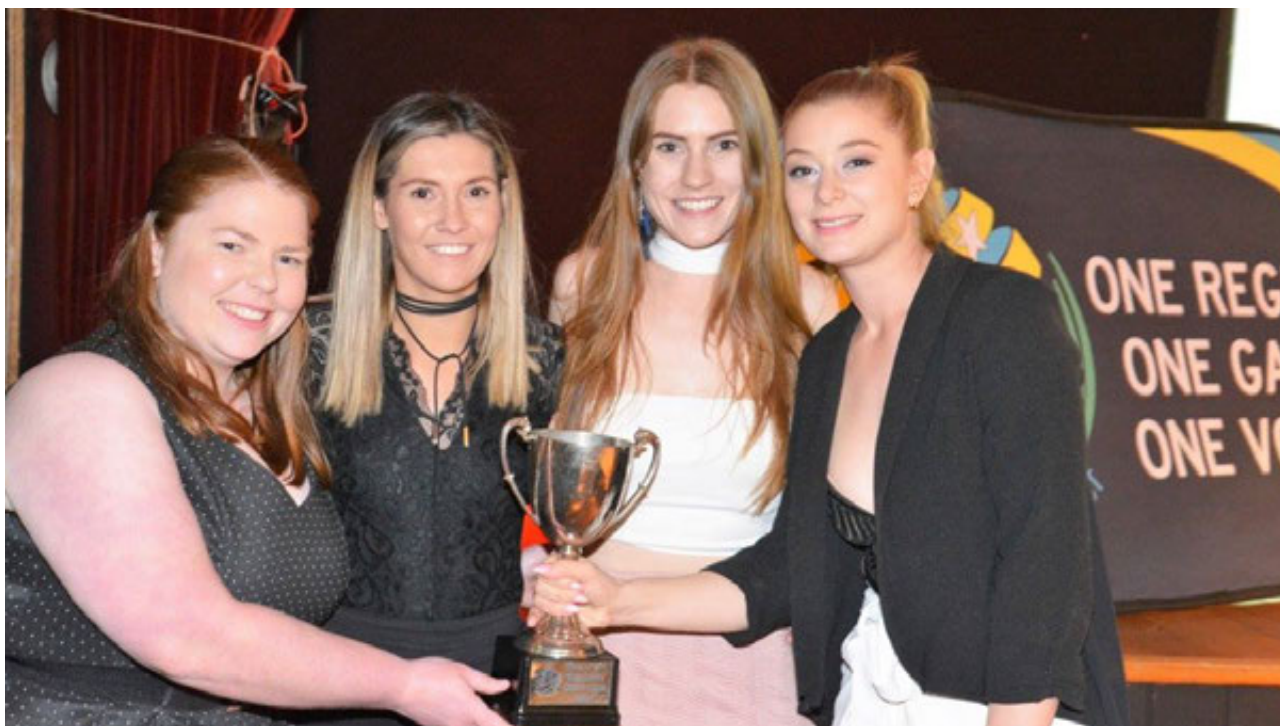
(Pictured above – Players and committee from University FC Division 2)