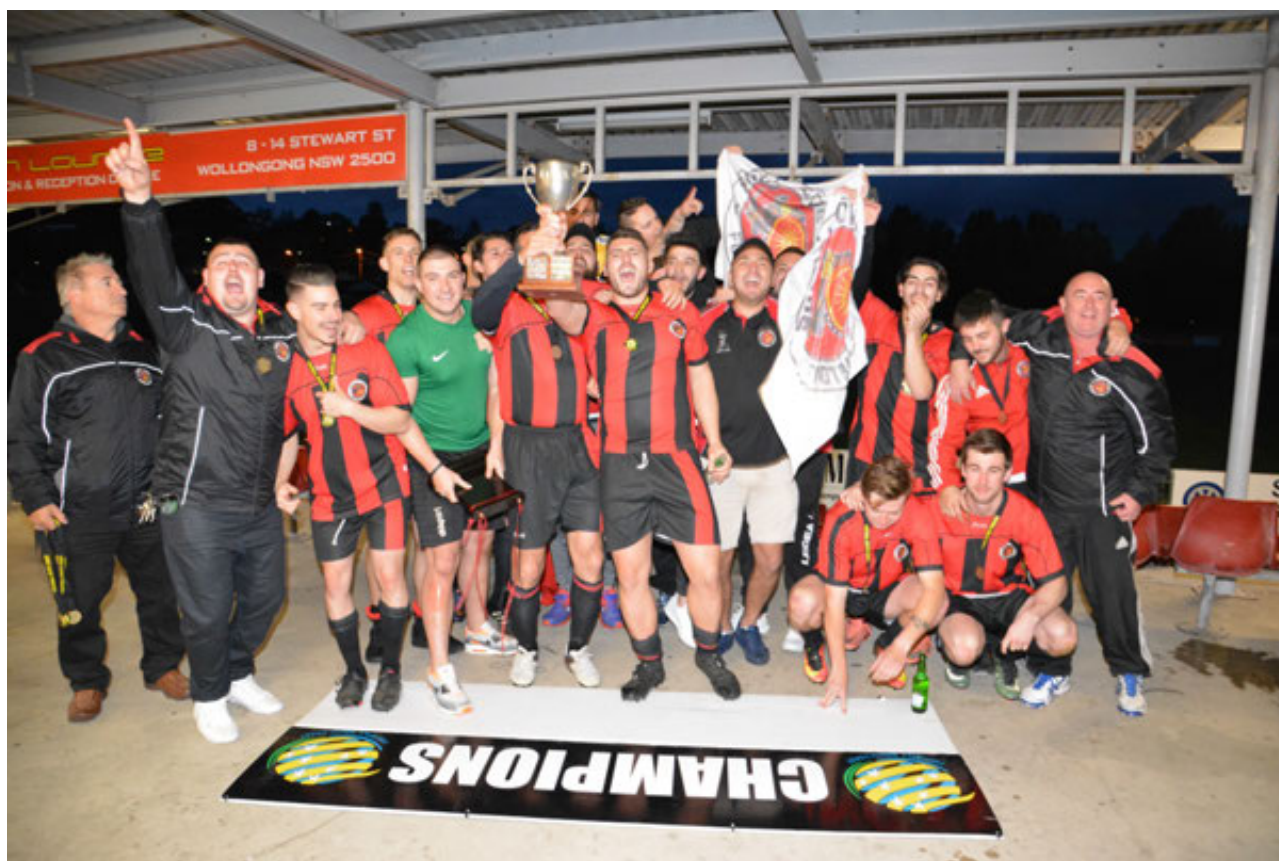
(Pictured above – Shell Cove FC celebrating their Grand Final win over Dandaloo FC. Shell Cove were also League Champions and were promoted to the WGC Cranes Illawarra District League for 2018)

League Champions – GPR Masters Runner Up – Burgh Hogs Grand Final Winners – GPR Masters Grand Final Runner Up – Burgh Hogs