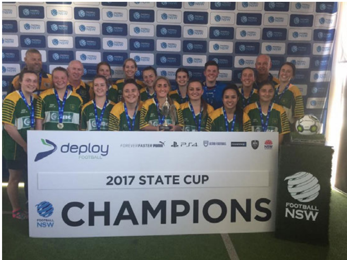
(Pictured above – Albion Park 18 Women's – State Cup Grand Final Winners)