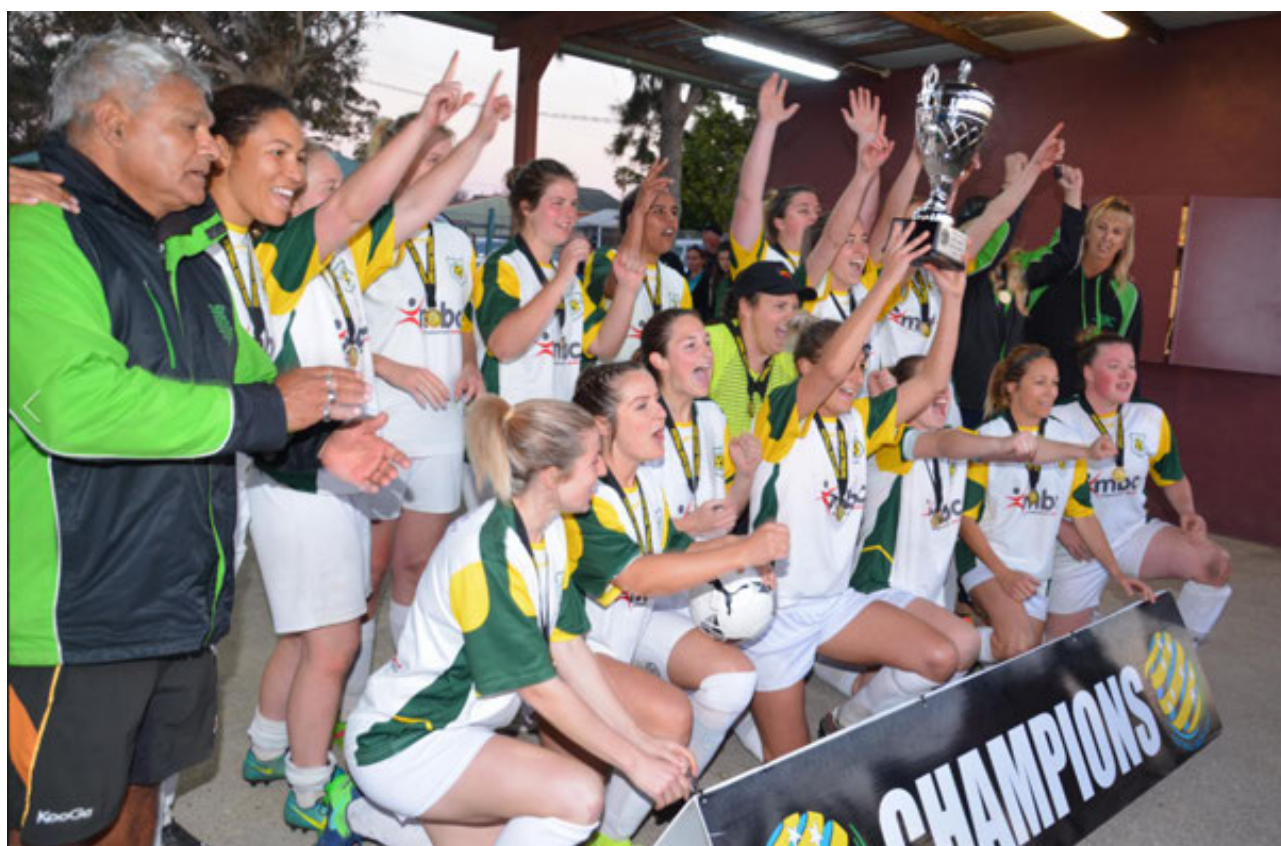
(pictured above – Division 1, All Age Grand Final winners Albion Park FC)

League Champions – Balgownie FC Runner Up – Albion Park SC Grand Final Winners – Balgownie FC Grand Final Runner Up – Albion Park SC