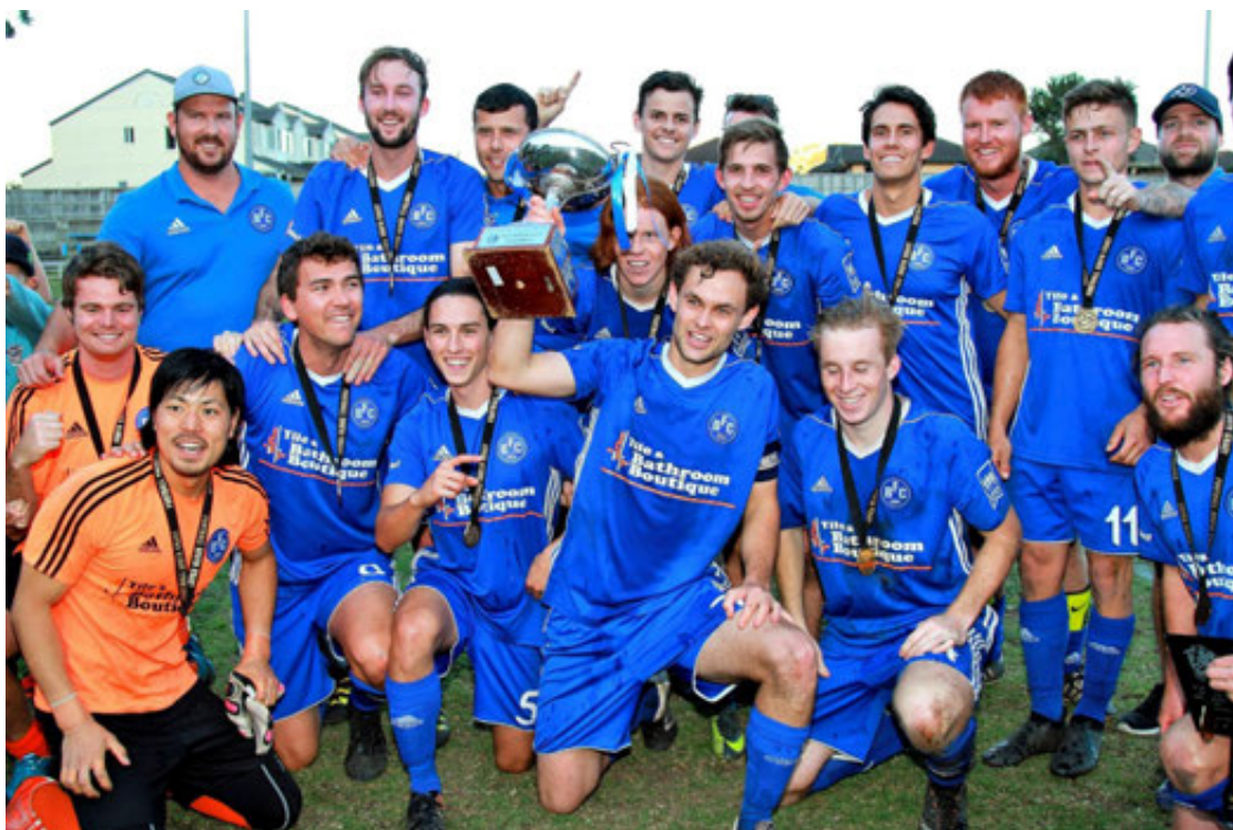
(Pictured above – Bulli FC, Illawarra Premier League First Grade League Champions)

Winner – Wollongong United Runner Up – Woonona Sharks