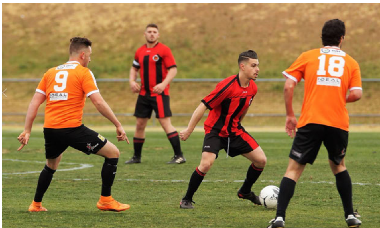
(Pictured above – players from Dandaloo FC (orange) and Shell Cove FC (red/black) in the All Age Division 1, First Grade Grand Final at Macedonia Park)