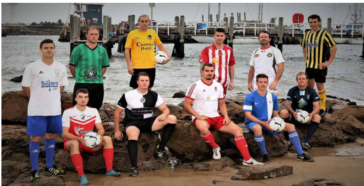
(Pictured above – Illawarra District League Clubs. Standing from left; University FC, Berkeley FC, Coniston FC, Oak Flats Falcons FC, Bellambi Rosellas FC, Helensburgh Thistle. Sitting from left; Wests Illawarra, Balcownie Ranges FC, Warilla Wanderers FC, Thirroul Thunder and Kiama Quarriers FC)