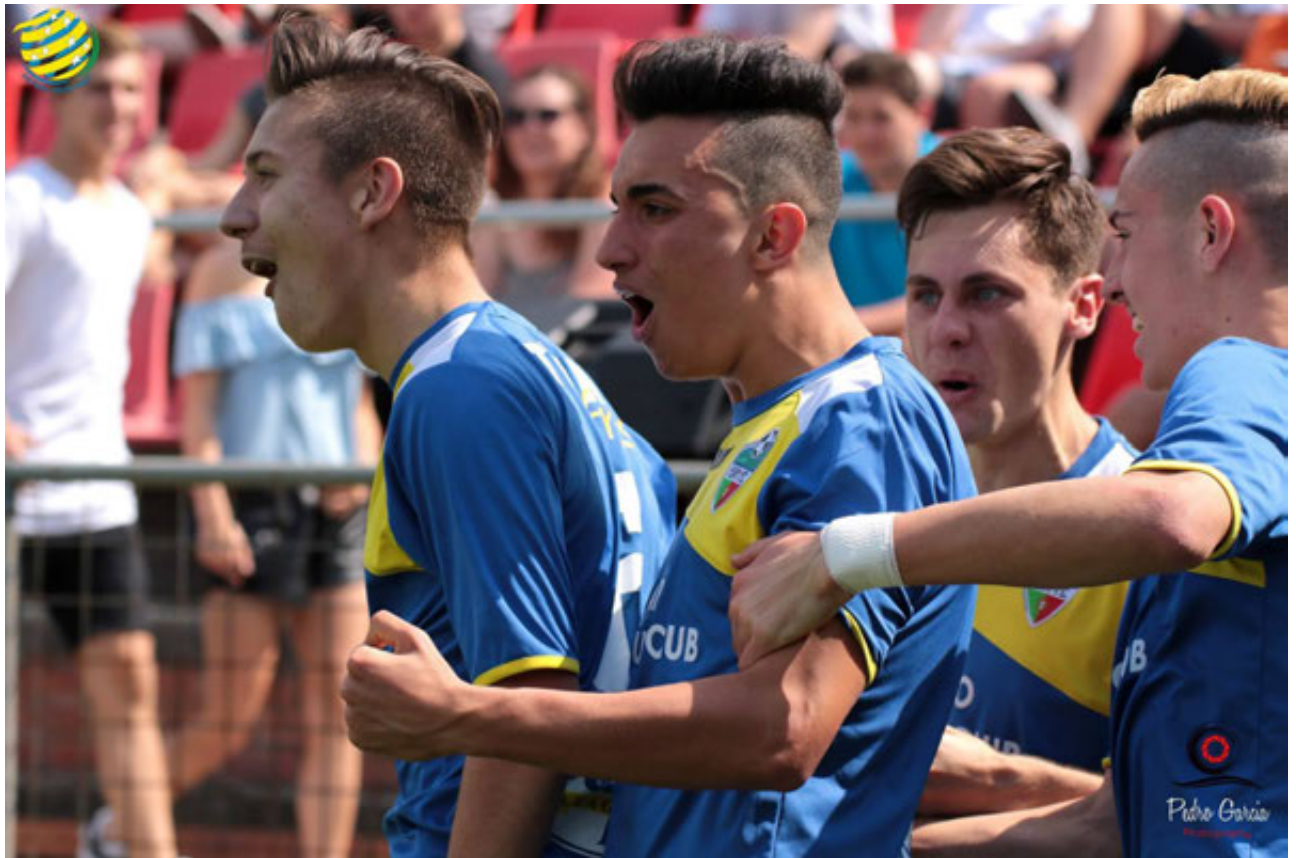
(Pictured above - Kemblawarra Fury Youth Grade who were league champions and unfortunately lost to Wollongong United in the Grand Final which was held at John Crehan Park, Cringila)