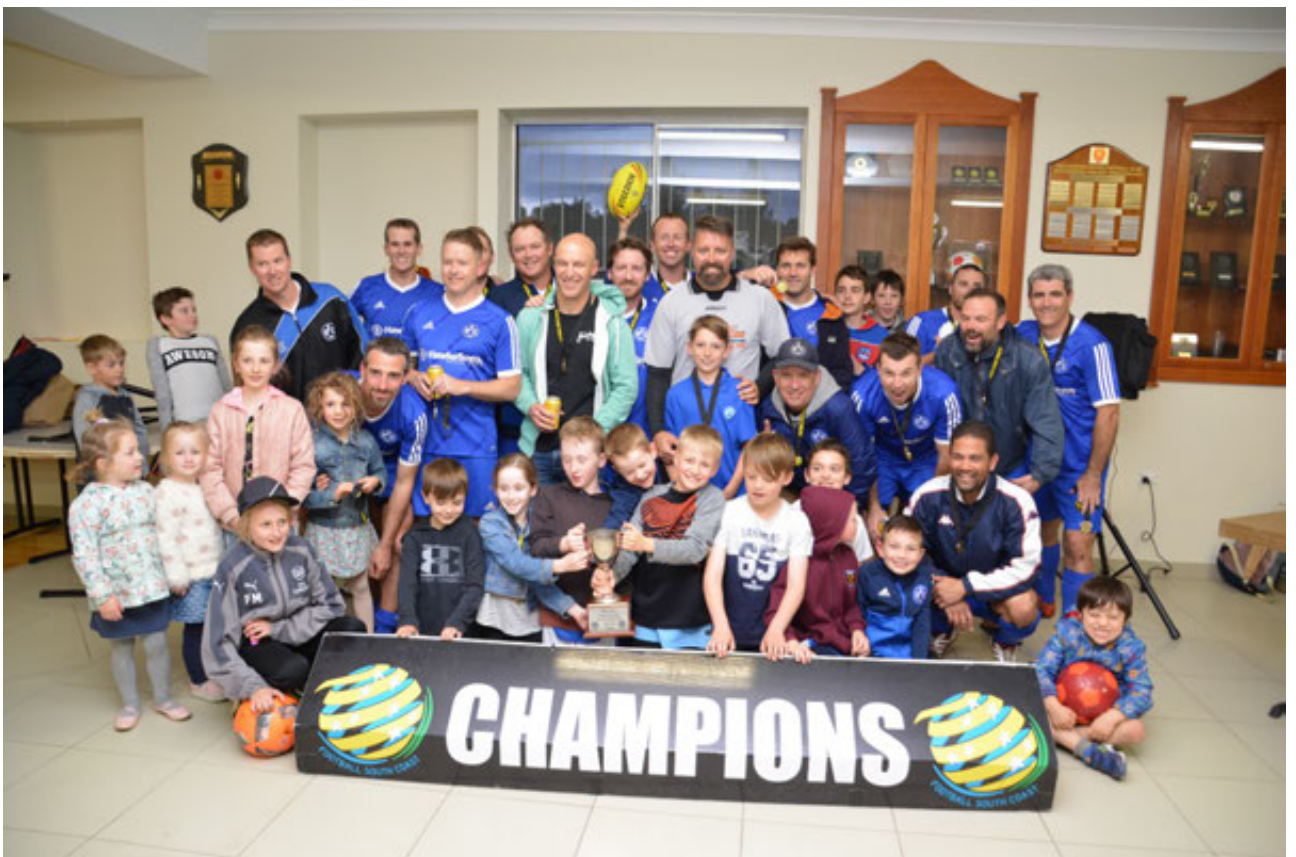
(Pictured above –Bulli Masters players and their families celebrate their Masters Division 1 Grand Final win at Macedonia Park)