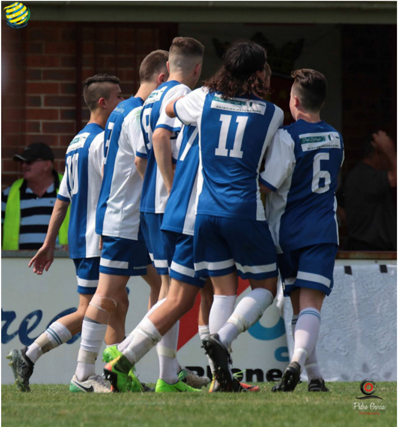
(Pictured above – Players from the U18 Tarrawanna Blues - 2017 League and Grand Final Champions)