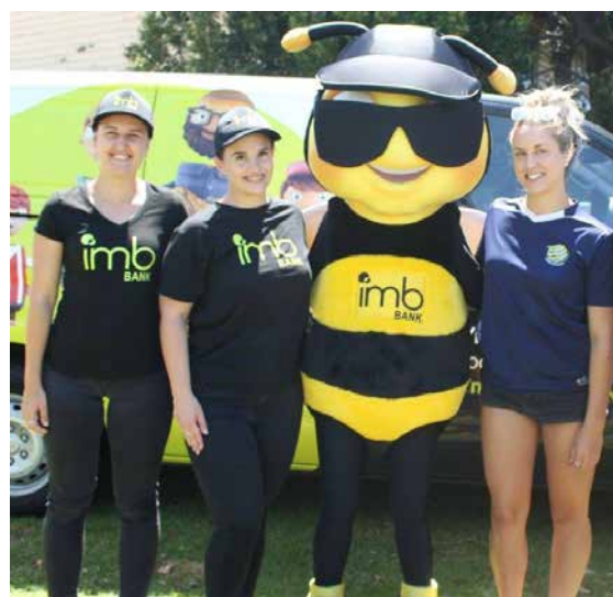
(Pictured above – representatives from IMB at Summer Football)