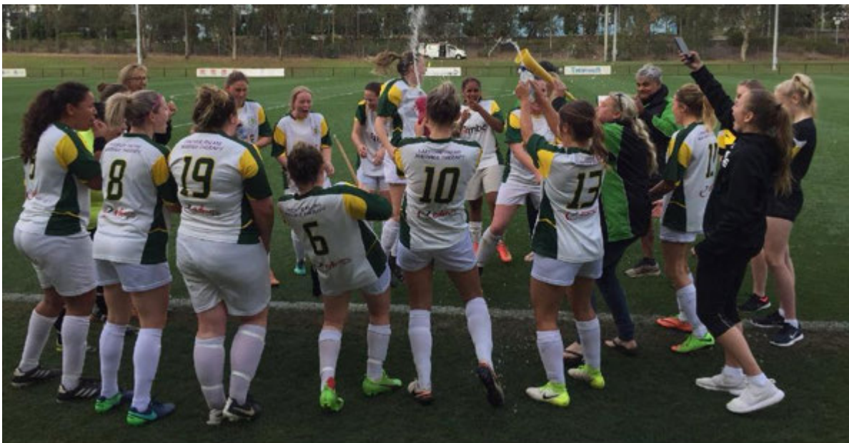
(Pictured above – All Age Women FNSW Champion of Champions, celebrating after their dominant win in the Grand Final at Valentine Sports Park)