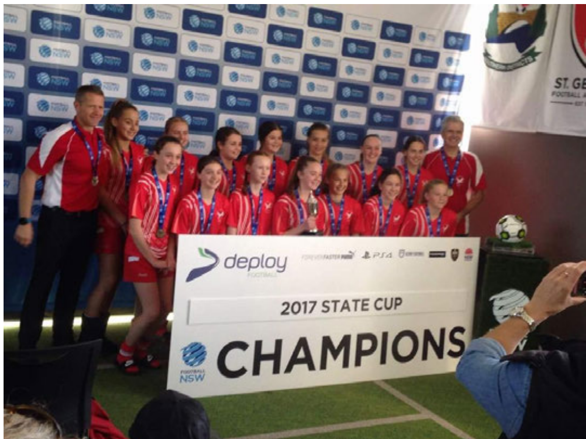
(Pictured above – Fernhill Junior Football Club – Under 14 Girls – State Cup Grand Final Winners)