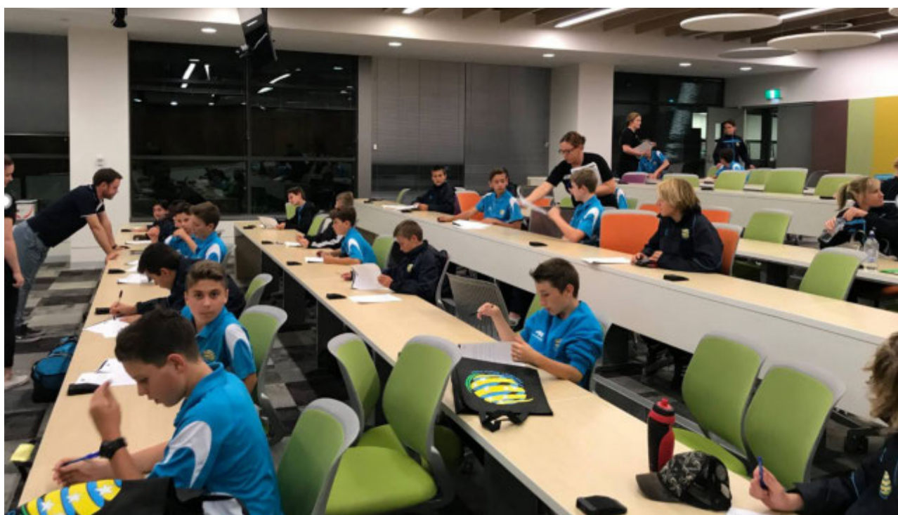
(Pictured above – players in the FSC Association Youth League team at the Ahead of the Game Workshop. This was one of two workshops that the players participated in which included the under 13 to under 16 squads).

The workshops focused on helping the players identify and develop skills for managing the challenges that sports can present, developing skills for being resilient and successfully navigating their own path through sport. This included the importance of effort, learning, embracing challenges, managing setbacks and raising awareness to common mental health problems by teaching players how to look out for signs that a mate might be struggling and what they can do to help.