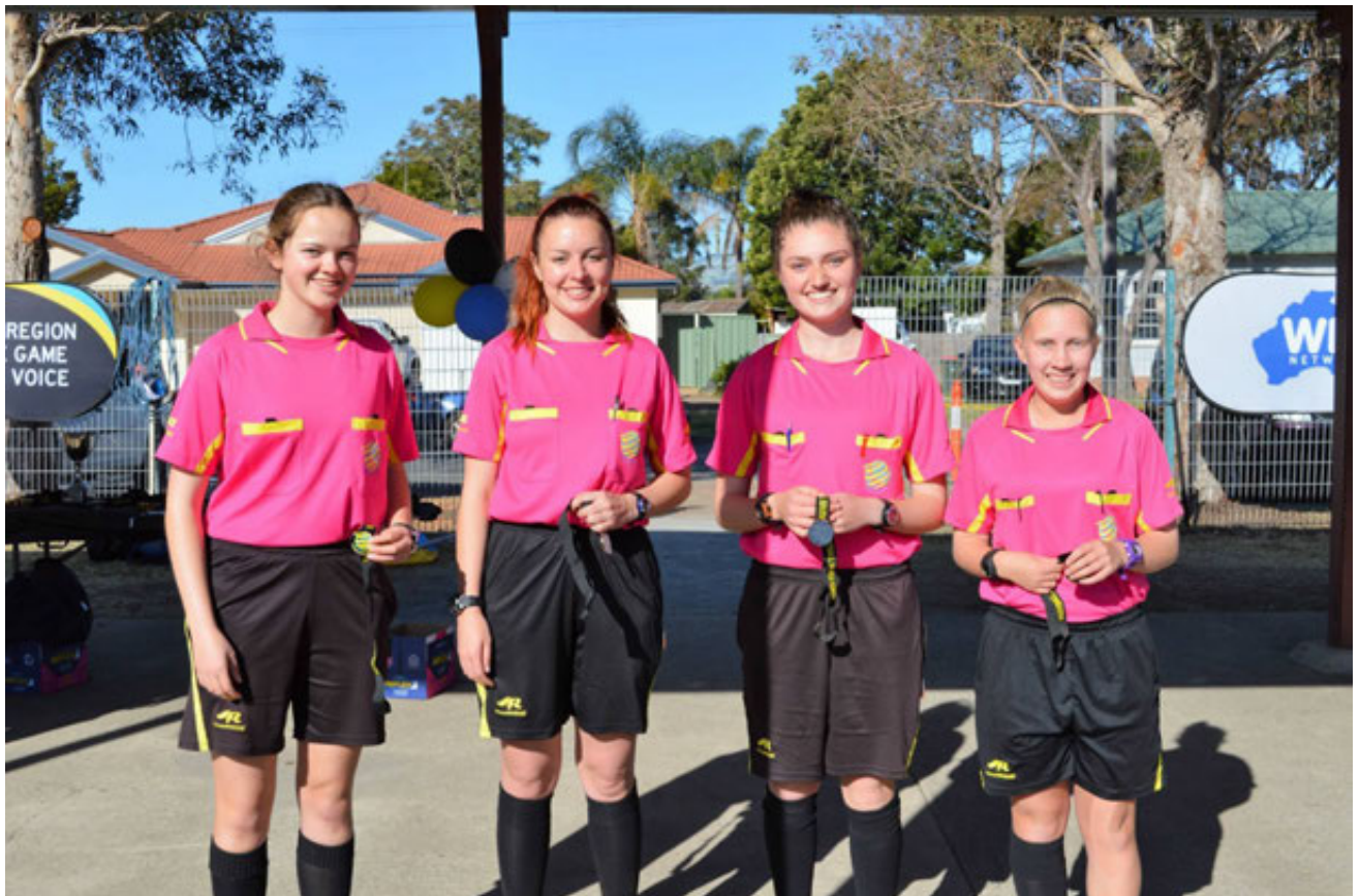
(Pictured above; the all-female refereeing crew for the Women's Division 1 Grand Final between Albion Park and Tarrawanna. This game marks the first time a Grand Final has been officiated by female referee's).