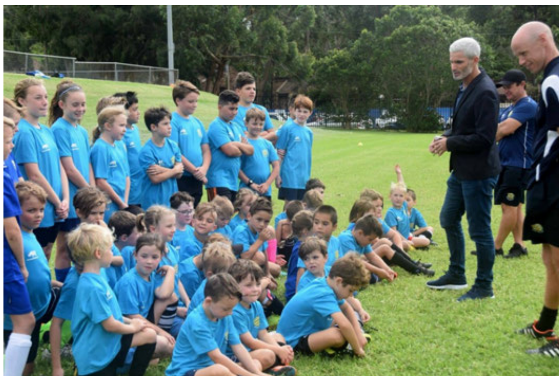
(Pictured above; School Holiday clinics held in 2017 where participants were lucky enough to have a visit from Craig Forster, former Socceroo and current SBS Football Analyst)