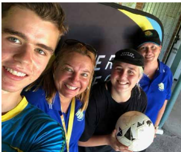
(Pictured above – the fantastic Summer Football support team)