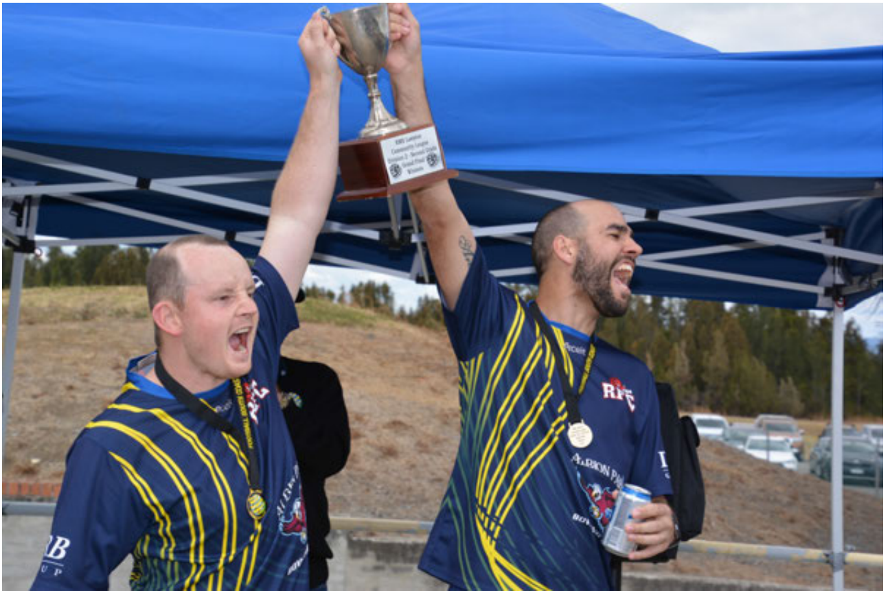
(Pictured above – players from the Albion Park Razorbacks celebrating their All Age Division 2, Second Grade Grand Final win at Macedonia Park)