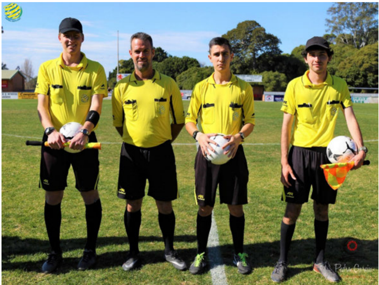
(Pictured above - FSC Referee's getting ready to officiate during our Men's Premiership Final Series)

This was a small step in the right direction, predominantly focused on Junior football matches, and it was great to see clubs get behind this campaign and promote "RESPECT" to ensure our match officials are afforded the respect they deserve.