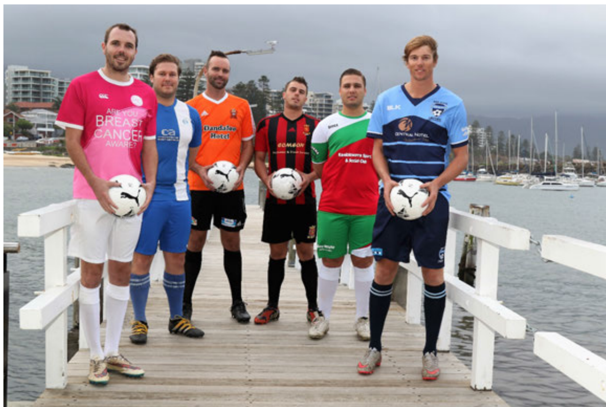
(Pictured above – Community League Division 1 players from left; Coledale, Thirroul, Dandaloo FC, Shell Cove FC, Wollongong Fury and Oak Flats)