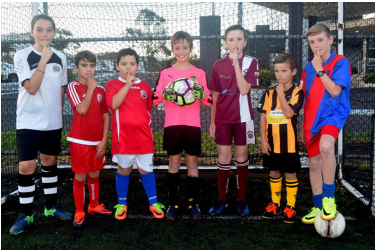
(Pictured above: Players from Balgownie, Warilla, South Coast United, Coniston, Unanderra Hearts, Helensburgh and Woonona who helped assist promote the Shoosh Round held on 15-21 May 2017)