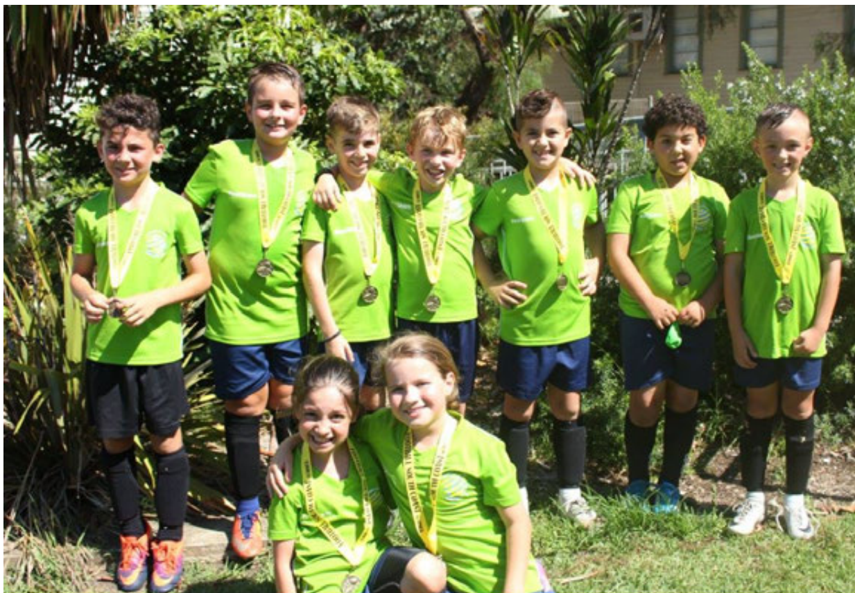
(Pictured above – one of our FSC Summer Football teams on the presentation day at Corrimal East Public School)

In 2017, games were held across numerous locations which included Thomas Dalton Park, Terry Reserve and Corrimal East Public School. The competition provides a great opportunity to play in a social environment with friends and keep players active.