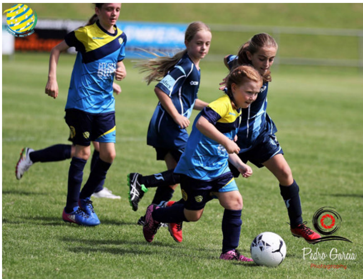
(Pictured above – players from the FSC Girls SAP teams (blue/yellow) playing against the Sutherland Shire Football Association Girls SAP team)

2018 will also see the introduction of the Girls Conference League competition to expand association player pathway opportunities for girls in the U14, U15 and U17 age groups. This is a very exciting opportunity for those girls selected in these representative squads and for our association female players who aspire to play football at a representative level in the future