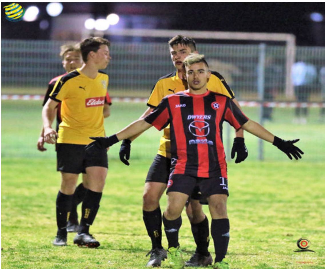
(Pictured above – Players from the Under 16 Division 1 Grand Final between Coniston (yellow shirt) and Lake Heights (red/black)