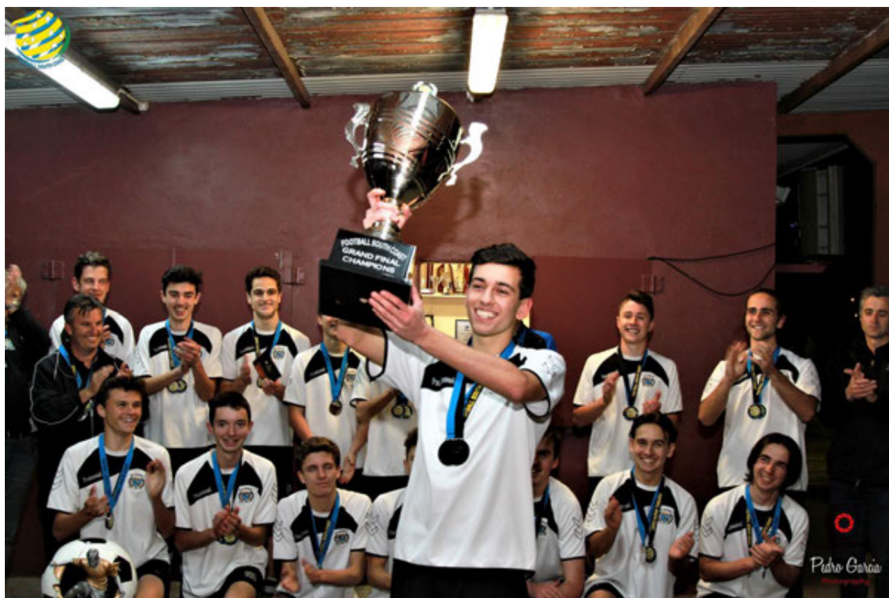
(Pictured above: Players from the Balgownie Under 17 Division 1 team, who were Grand Final Winners over Wollongong Olympic)

Congratulations to League Champions, Grand Final winners, FNSW State Cup winners U12 boys Shellharbour, U14 women Fernhill, U18 women Albion Park & Runners Up U16 boys Coniston.