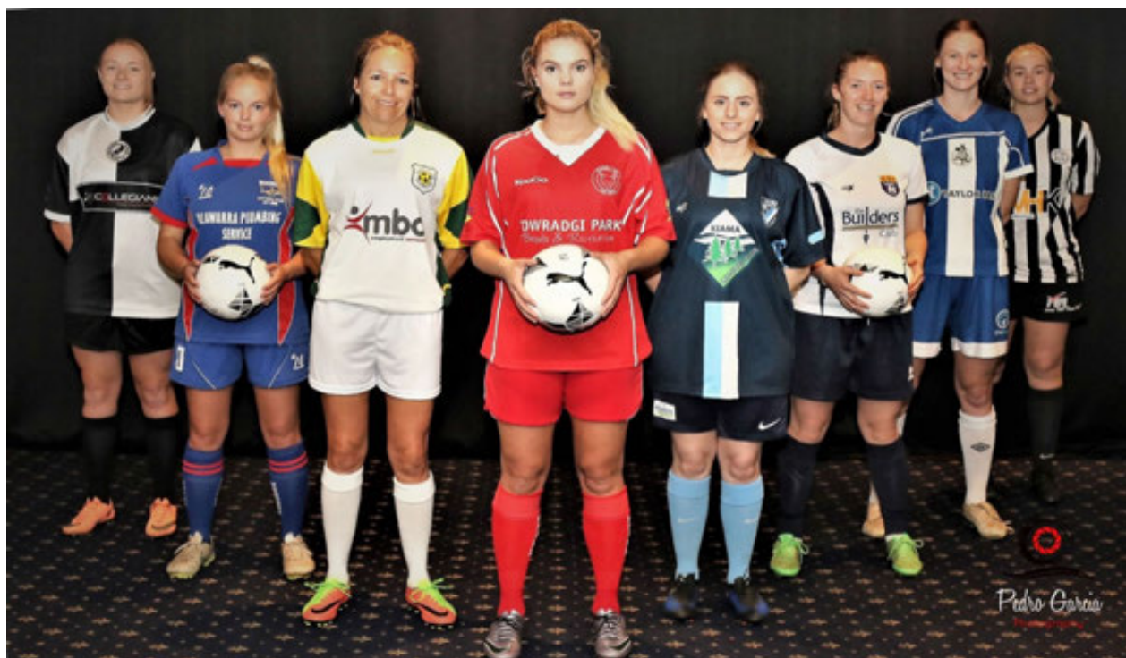
(Pictured above – players representing women's team. From left; Balgownie Rangers FC, Woonona Sharks FC, Albion Park FC, Fernhill, Kiama Quarriers FC, University FC, Tarrawanna Bluey's and Port Kembla)

Albion Park and Tarrawanna represented FSC in the FNSW State Cup competition with both making semi finals and Albion Park claiming the trophy with a dominant win over Northbridge FC. Albion Park continued their outstanding undefeated season by also winning the end of year Champions of Champions competition defeating Miranda Magpies 4 – 0.