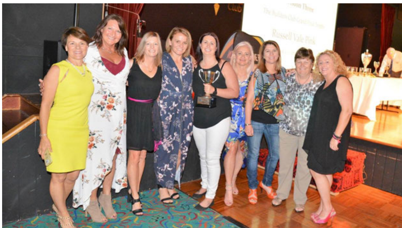
(Pictured above – players from Russell Vale Pink who were Grand Final winners in Division 3)