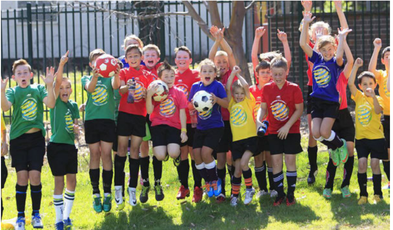
(Pictured above: Players from the FSC Summer Football competition)