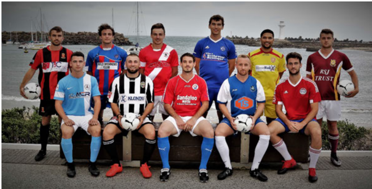
(Pictured above – Illawarra Premier League Clubs. Top row from left; Cringila FC, Woonona Sharks FC, Corrimal Rangers, Bulli FC, Wollongong United FC, Picton Rangers. Bottom row from left; Wollongong Olympic FC, Port Kembla FC, South Coast United FC, Tarrawanna Blues and Albion Park White Eagles. Absent: Kemblawarra Fury)

Season 2017 witnessed another season of exciting football from start to finish and who can forget that final round in Premier League where the League Championship, final series club qualifiers and relegation battle was all decided which captured the attention of the football public both here and abroad. In another great initiative by the MFC, the Premier League championship decider was broadcast live on Facebook which was tuned in by many throughout the afternoon coverage. The grand final weekend returned to local venues at Wetherall Park on Saturday and Crehan Park on Sunday and both days were highly successful and enjoyed by many with some exciting games of football taking place to decide the grand final winners. Congratulations to all the grand final winners in 2017.