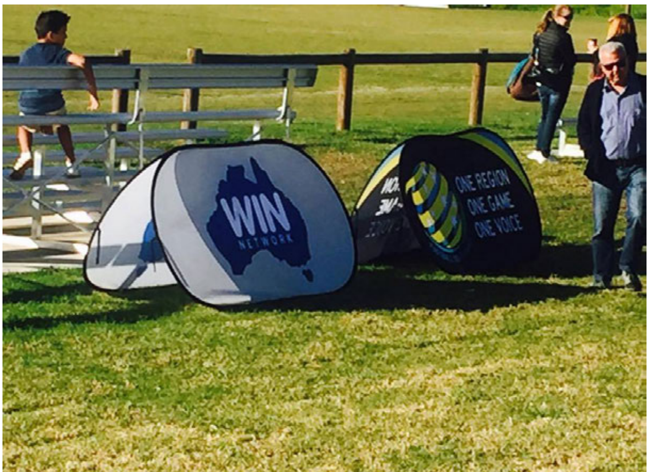
(Pictured above - WIN Network who are the Naming Rights Partner of the FSC Junior Competition, FSC Academy and FSC School Holiday Clinics)