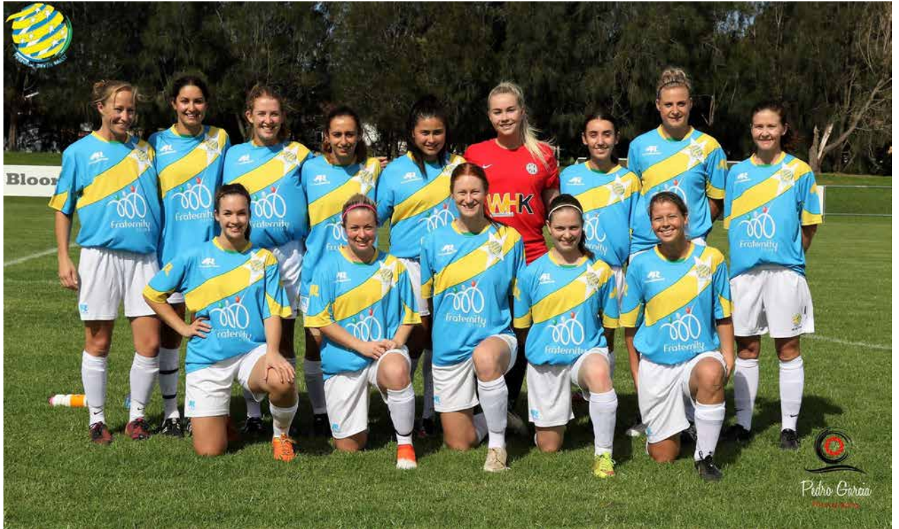
(Pictured above – Players from the 2017 FSC Women's All Stars who played the Sutherland Shire Association All Stars. The match ended in a 1-1 Draw)