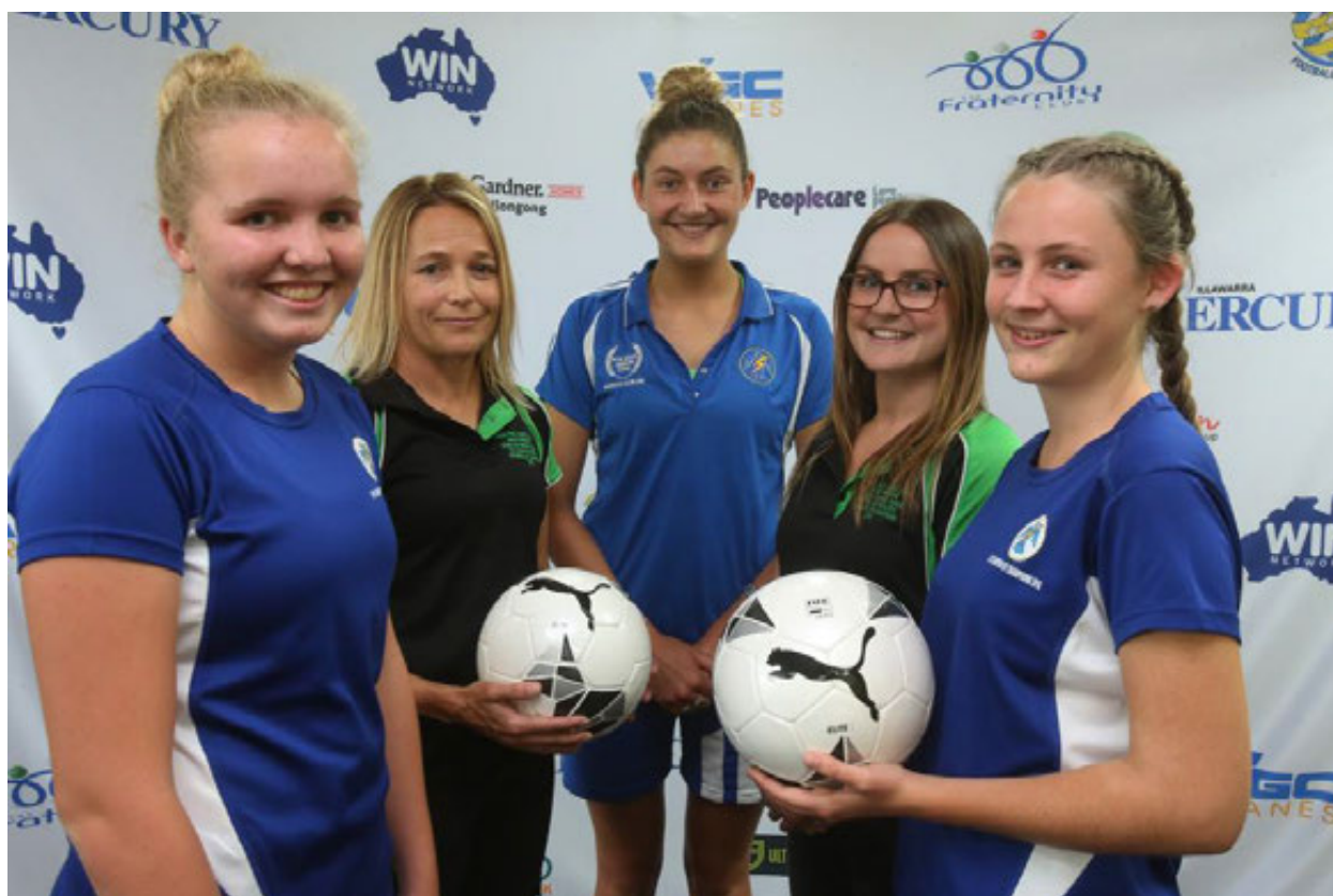
(Pictured above – Players from the U21 Thirroul Thunderbirds (blue) and Albion Park All Age Women Division 1 (Black/green). Both teams were finalists in the prestigious FNSW Champion of Champions tournament)

Semi Finalist - 16 Boys - Lake Heights Junior FC