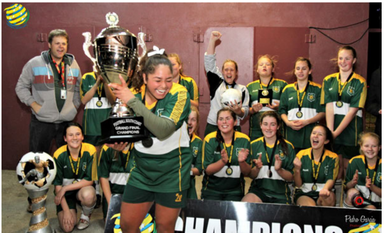
(Pictured above – the Grand Final winners from Albion Park Juniors, Under 15 Division 2 Women's competition)