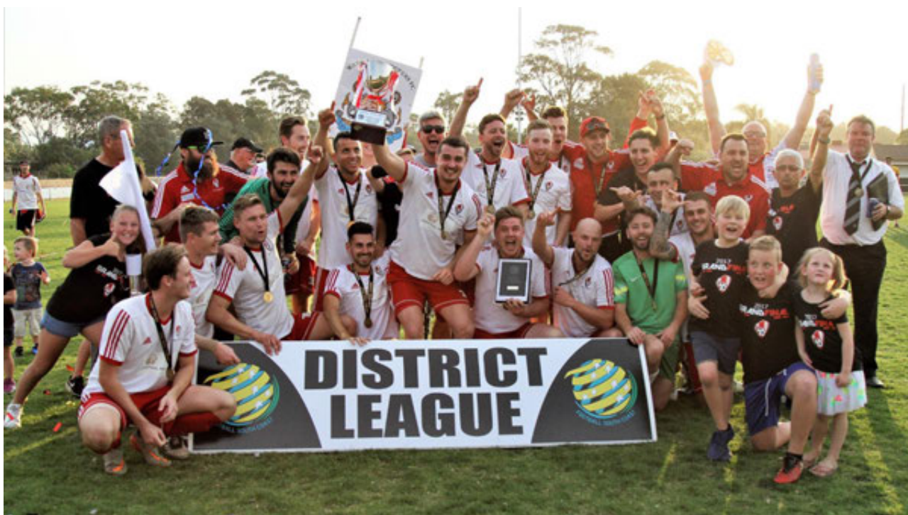
(Pictured above – the WGC Cranes Illawarra District League Grand Final Champions for First Grade – Warilla Wanderers celebrating their win over Helensburgh Thistle. The District League Grand Finals were held at Wetherall Park for Youth Grade, Reserve Grade and First Grade)