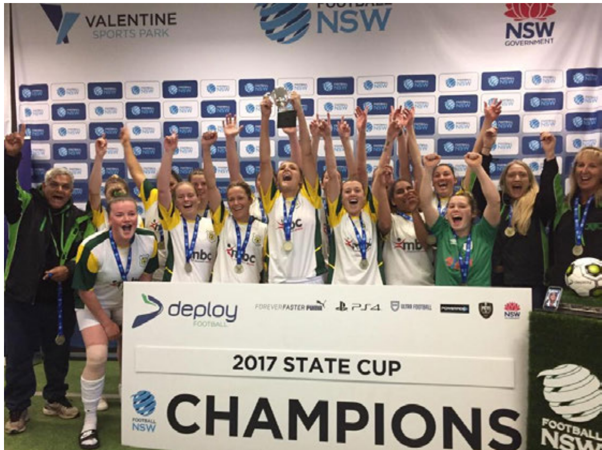
(Pictured above – Albion Park Football Club All Age Women - State Cup Grand Final Winners)