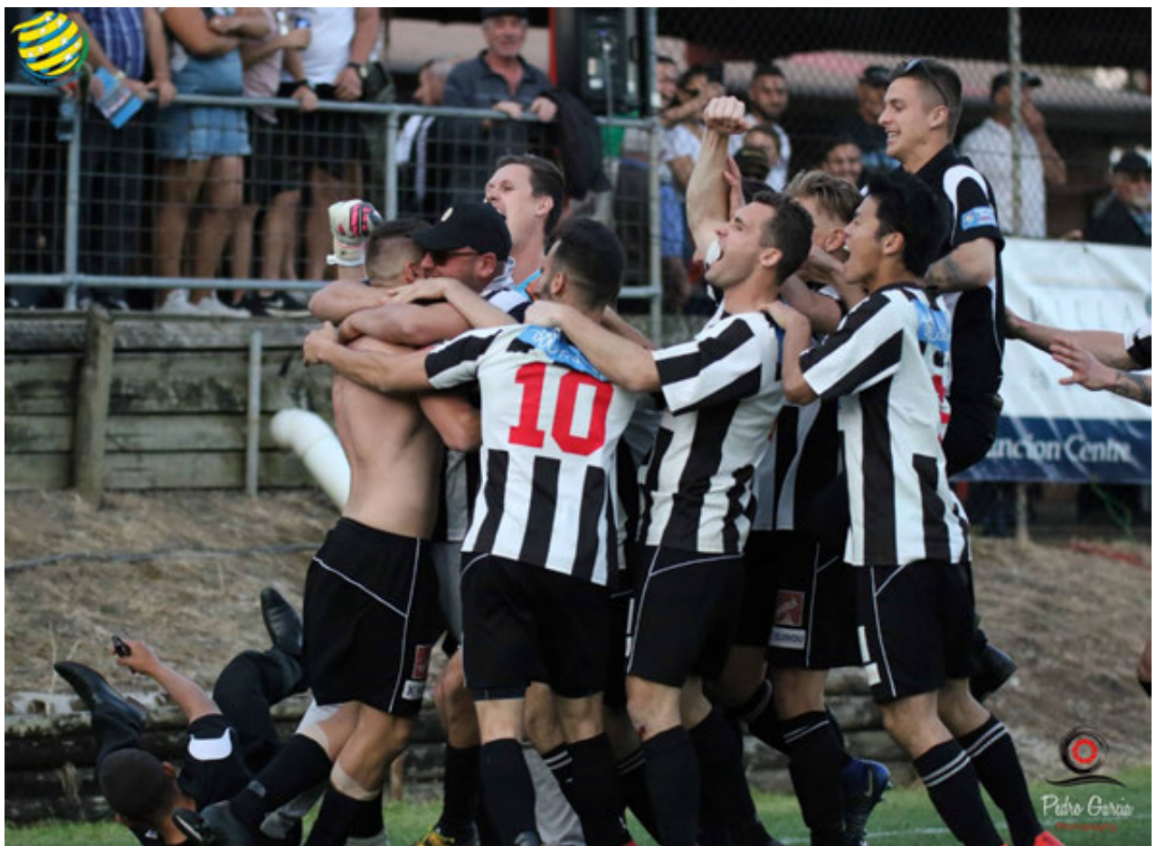
(Pictured above – players from Port Kembla FC celebrate their Grand Final win over League Champions Bulli FC. Port Kembla won the game in a dramatic penalty shoot out)