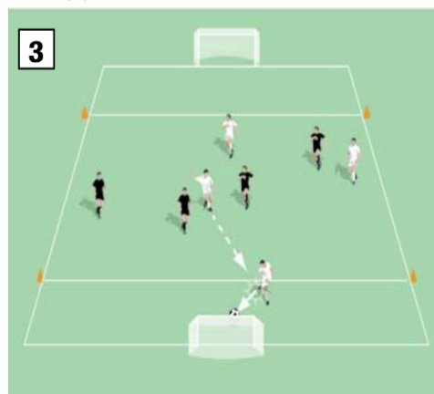
3. His team mate spots the run and makes a pass into the end zone.