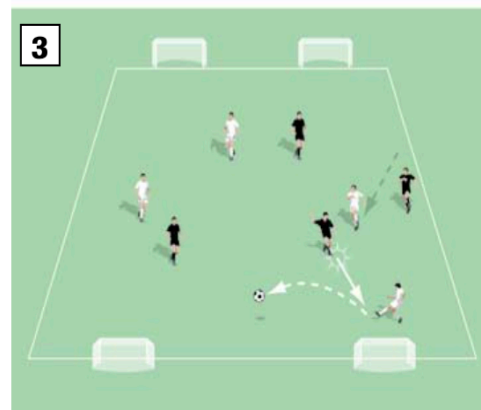
3. ...can they regroup to defend the quick break in the opposite corner?