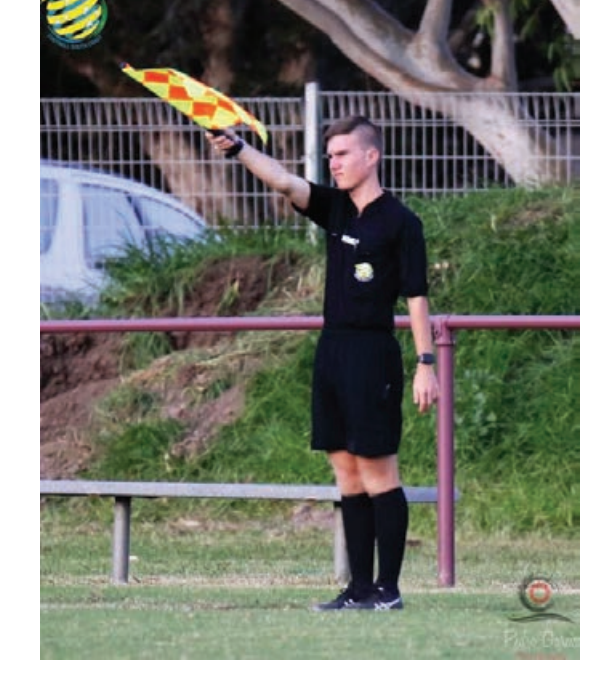
(Pictured above; Referees in action during the 2021 Season)