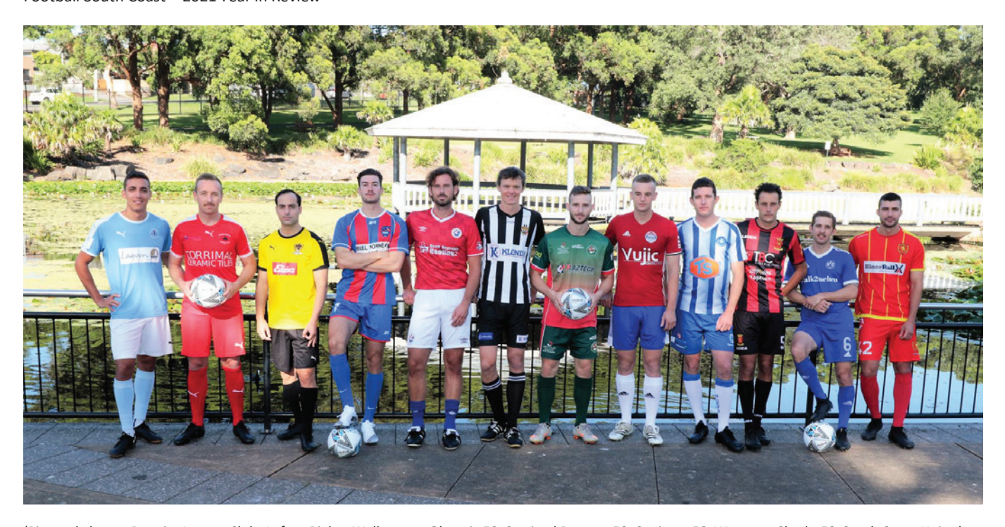
(Pictured above - Premier League Clubs Left to Right: Wollongong Olympic FC, Corrimal Rangers FC, Coniston FC, Woonona Sharks FC, South Coast United FC, Port Kembla FC, Bellambi Rosellas FC, Albion Park White Eagles FC, Tarrawanna FC, Cringila Lions FC, Bulli FC and Wollongong United FC)