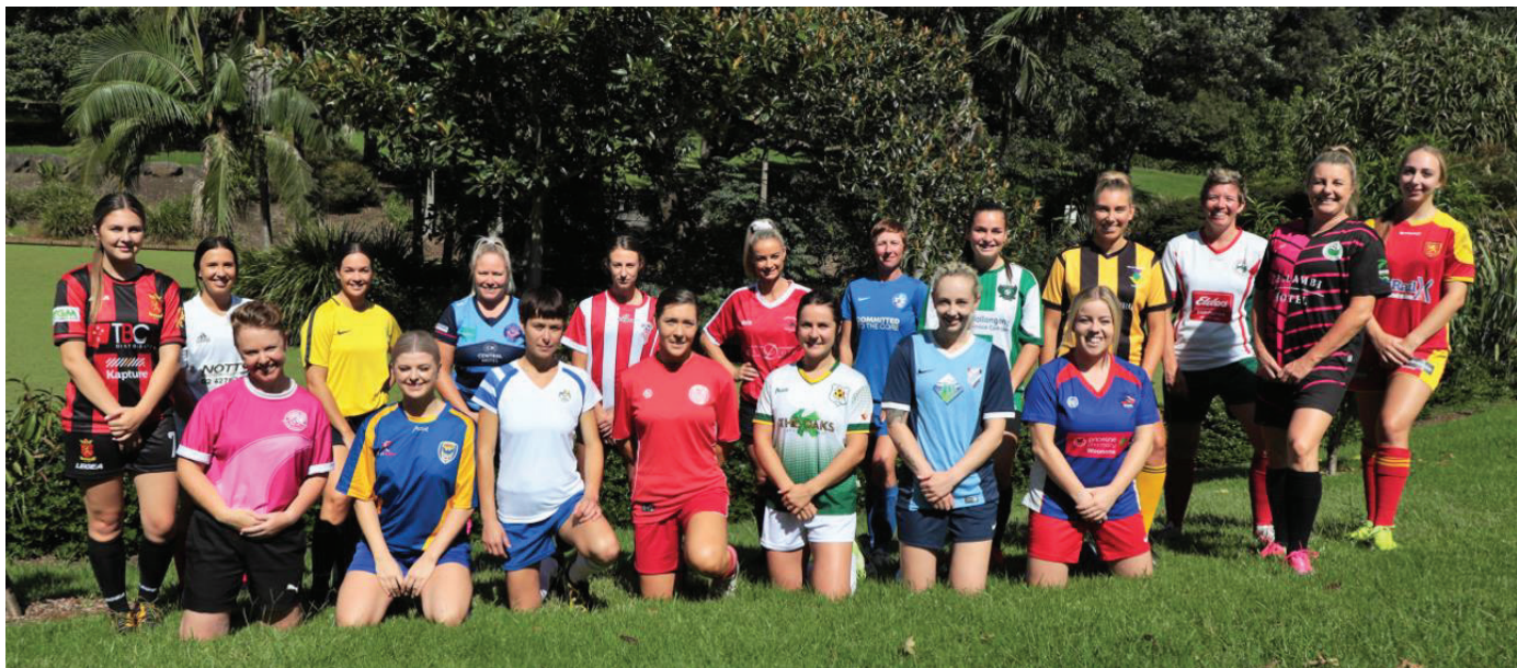
(Pictured above: Players representing 2021 Women's teams across all Divisions)