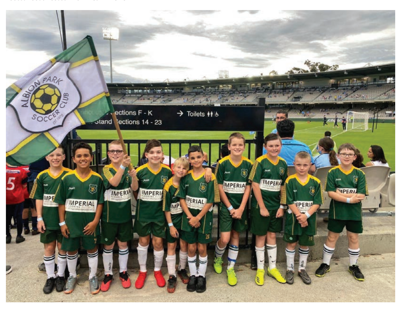
(Pictured above; Players from Albion Park Junior Soccer Club participating in the Sydney FC Game Day experience)