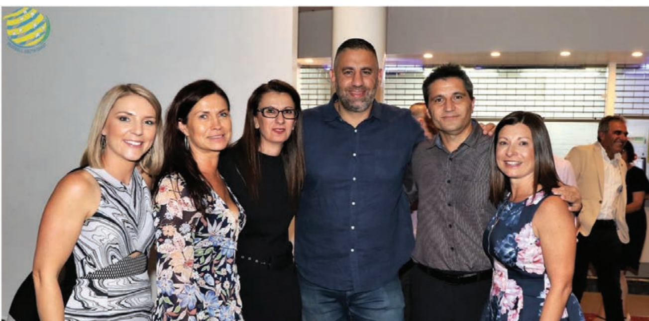
(Pictured above: Photo's from the 2021 FSC Season Launch)