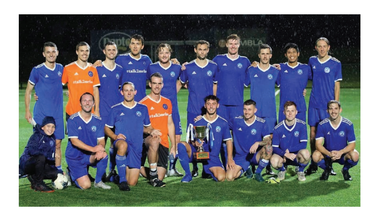
(Pictured above; Bulli FC First Grade team celebrating their Fraternity Club win at Ian McLennan Park. Bull FC were victorious beating District League Club, Shell Cove FC)