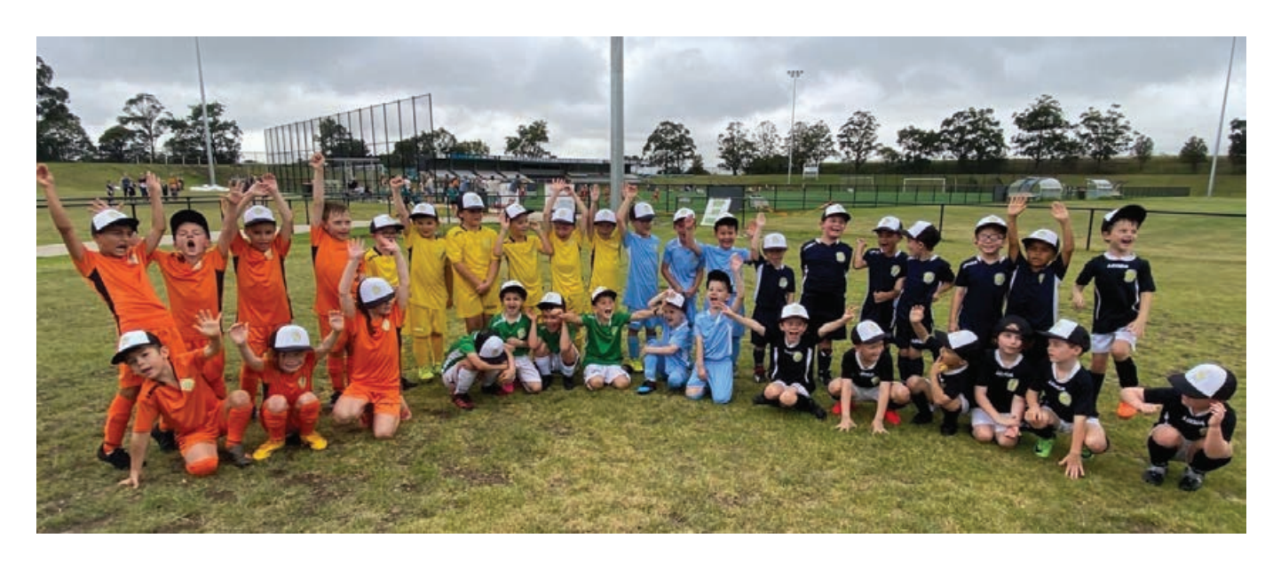
(Pictured above – Junior Players across our competitions)