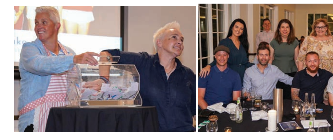
(Pictured above: Photos of panel speakers and guests at the function)