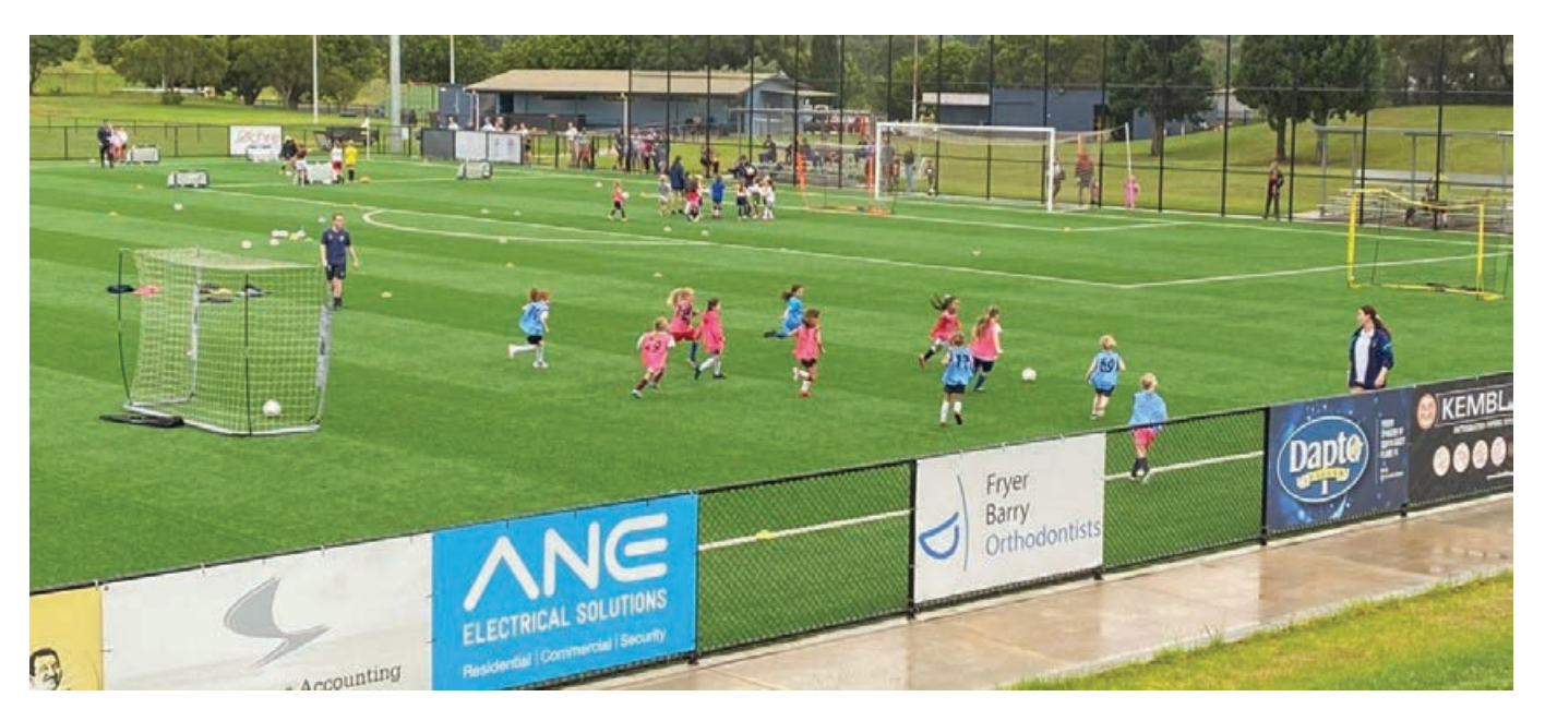
(Pictured above – Action from the IMB Bank Female Gala Day hosted at Ian McLennan Park, Kembla Grange)

This is becoming a key part of our calendar, and enables young female players to attend a free clinic including training sessions and games. In 2021, we had 60 participants involved in the event. Growing our female playing base is a great opportunity for football especially with the Women's World Cup just around the corner in 2023.