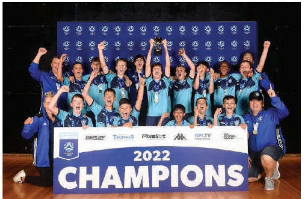
U13 Boys Shellharbour 2022 FNSW Champion of Champions