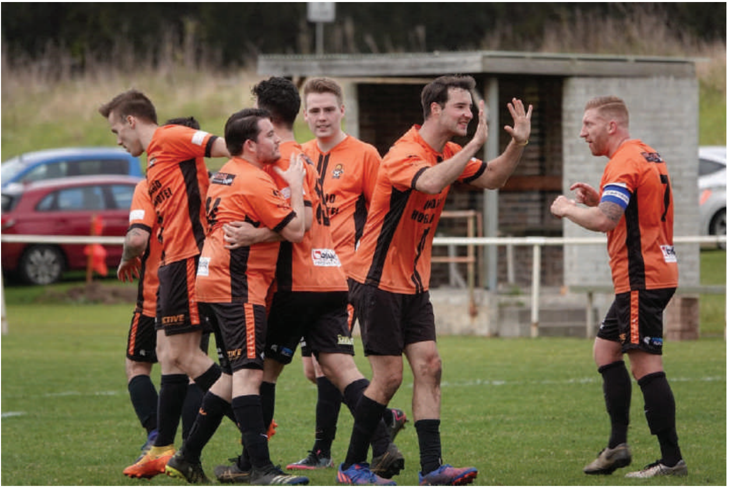
Pictured above – Dandaloo FC players celebrating a goal during the season