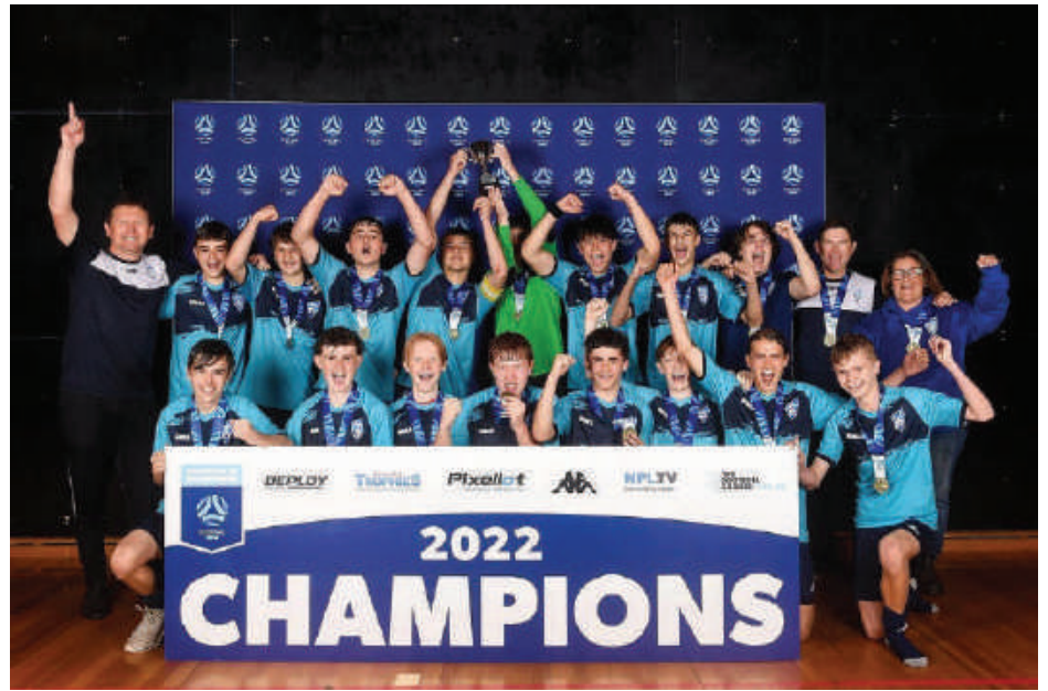
Pictured above right