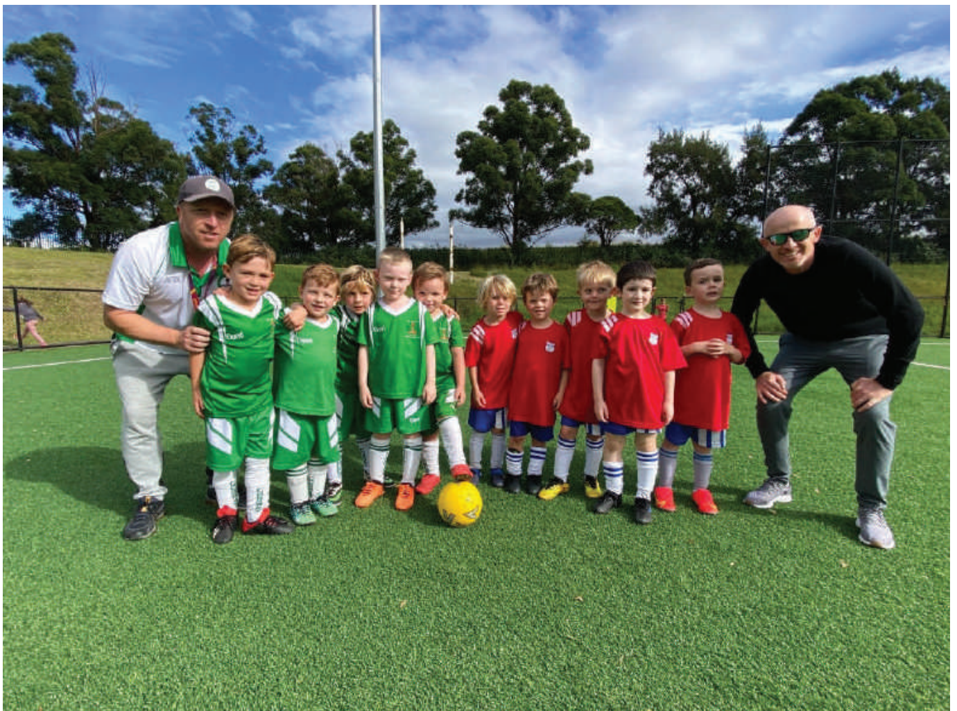
Pictured above – U6 Players From Russell Vale Juniors and Thirroul FC who participated in the U6/U7 Super Saturday at Ian McLennan Park on 27 May. 120 teams participated across the day.