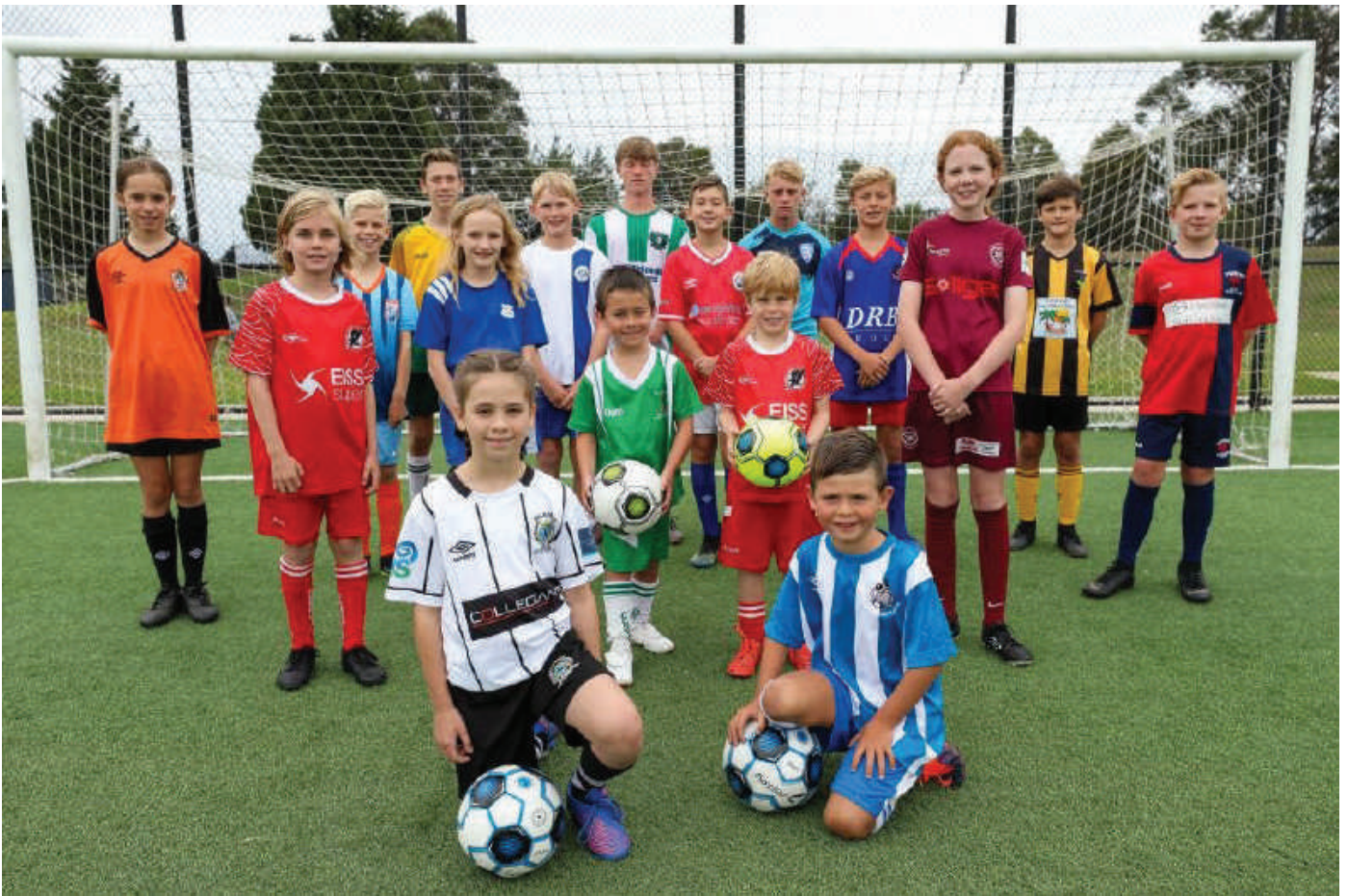
Pictured above – Clubs involved in the 2023 Registration Launch