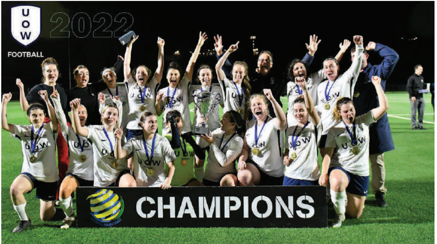
Pictured above: Women's Division 1 Grand Final winners UOW FC who defeated Albion Park 3-1 at Ian McLennan Park.