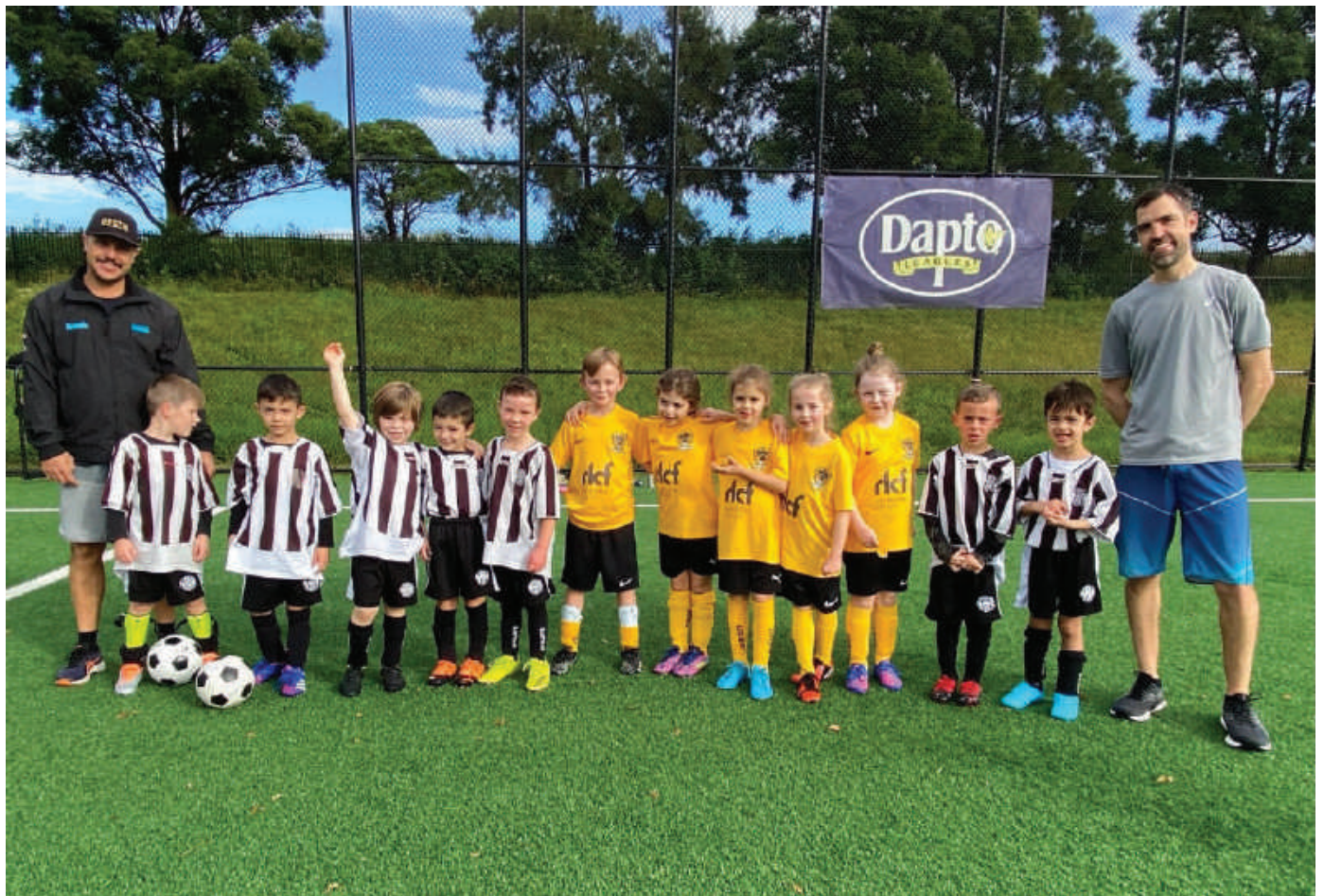
Pictured above – U6 Players From Port Kembla Juniors and Coniston Junior FC who participated in the U6/U7 Super Saturday at Ian McLennan Park