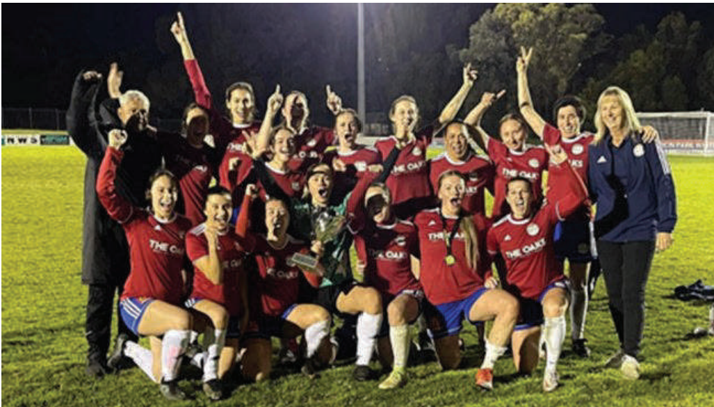
Pictured left – Albion Park White Eagles celebrating their Julie Porter Cup win against UOW FC at Terry Reserve

Grand Final Winner—Albion Park White Eagles Runner Up—UOW FC