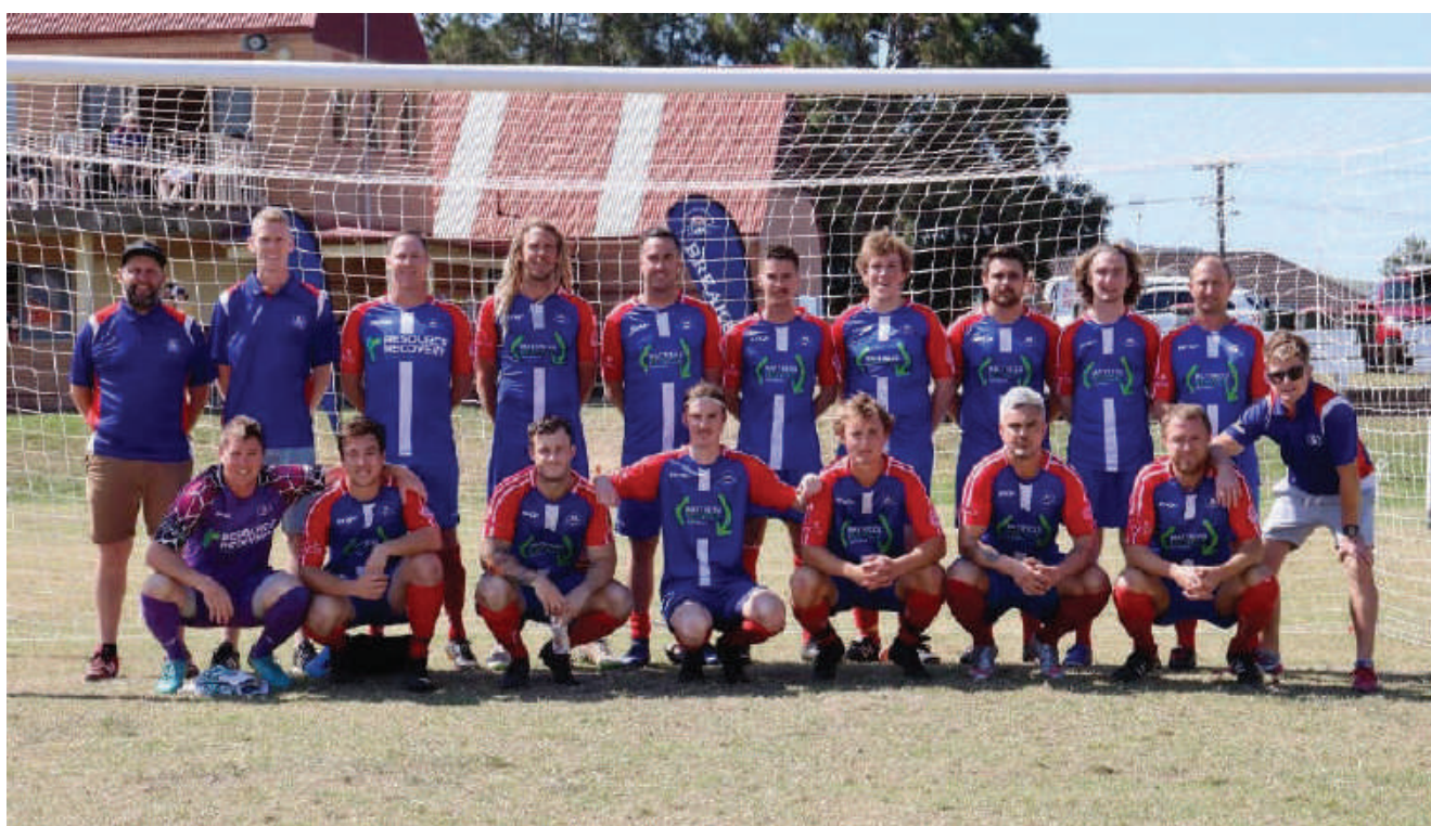
Pictured above – Gerringong FC were the 2022 League Champions in the Division 1 All Age Community League competition earning the right to promotion into the Men's Premiership District League competition

League Champions – Coledale Waves Runner Up – Ground Hogs