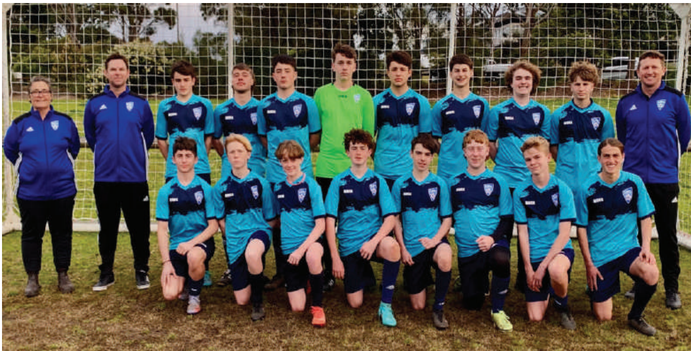
Pictured above – The Shellharbour Junior FC—Under 15 League Champions