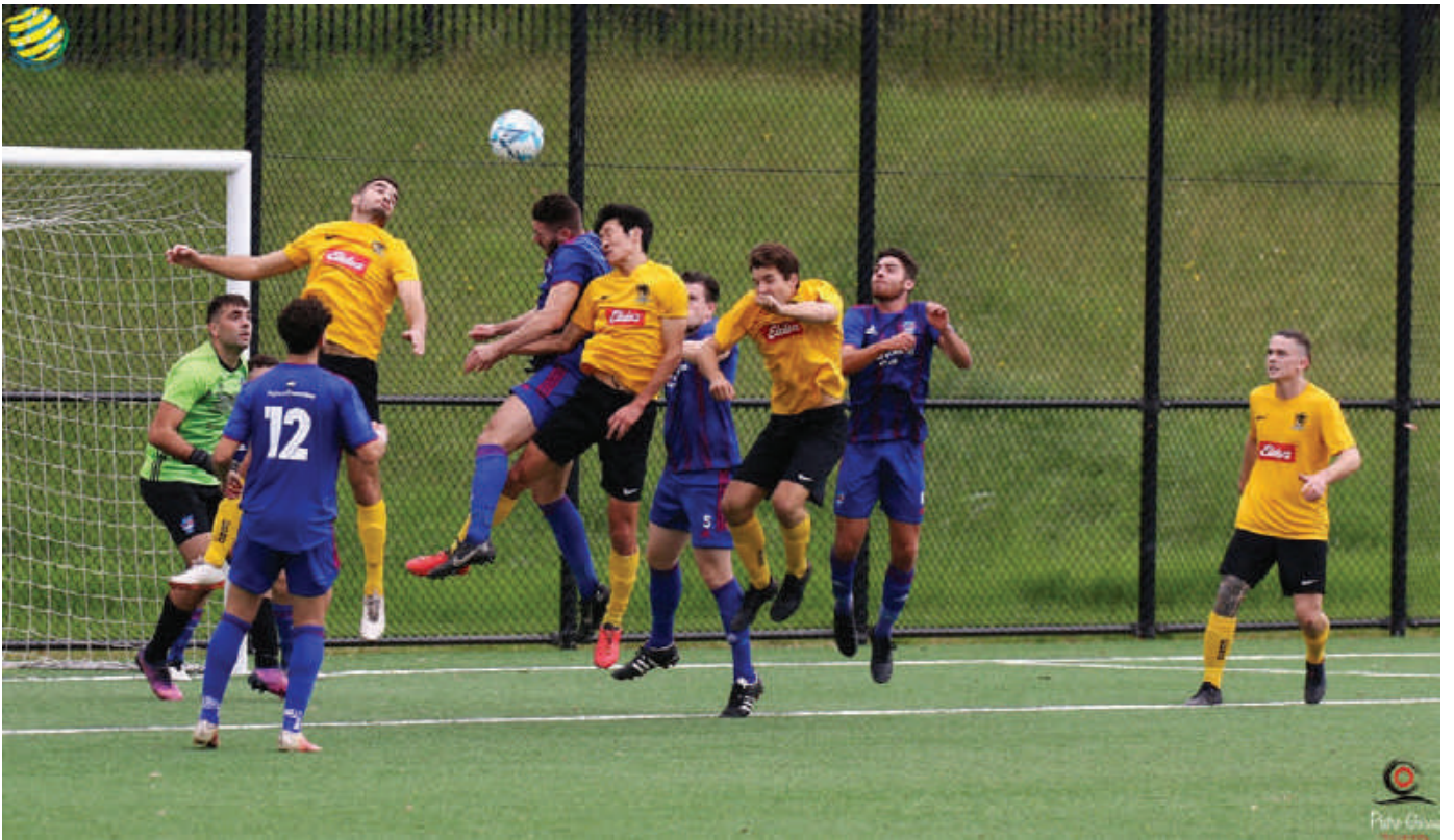
Pictured above – Players from Woonona FC and Coniston FC in action during the season