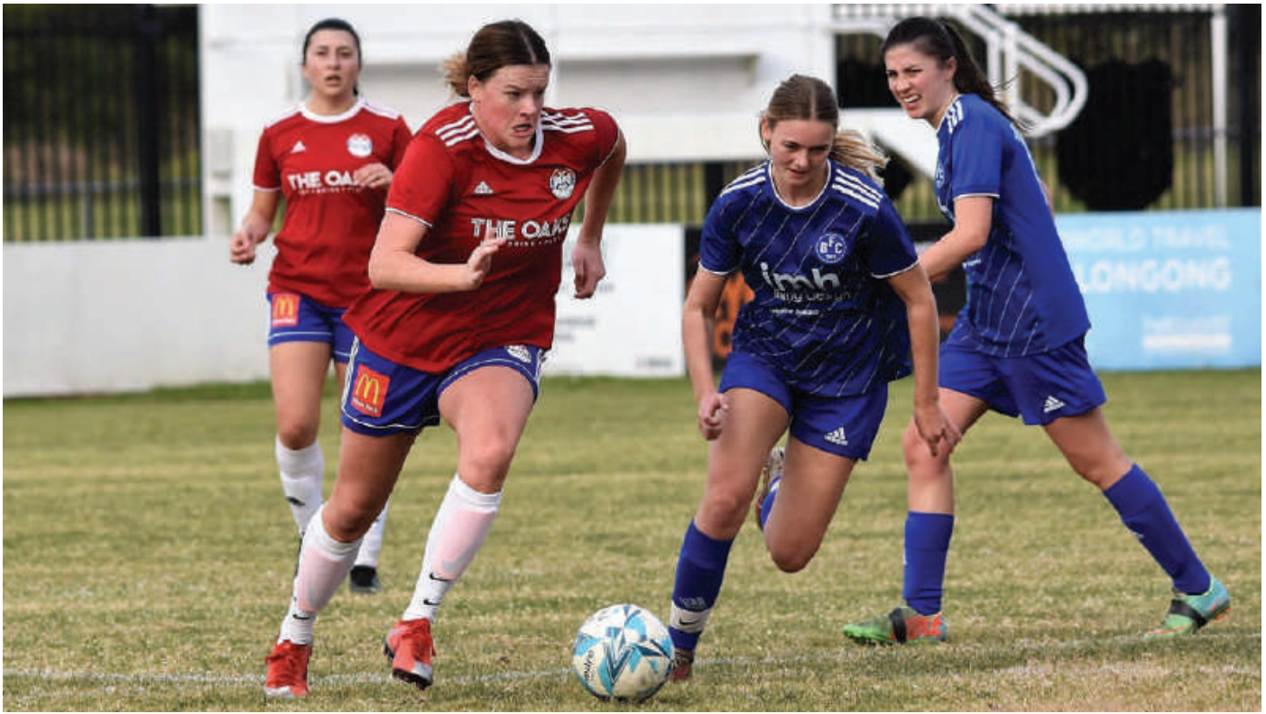
Pictured above – Players from Albion Park White Eagles and Bulli FC in action during the season.