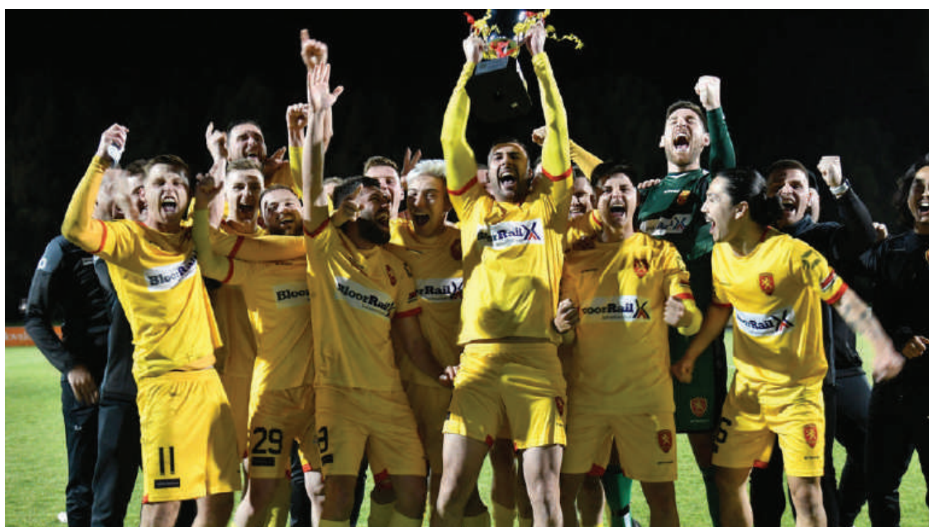
Pictured above – Players from Wollongong United FC celebrating their Premier League 1st Grade League Championship. Wollongong United also progressed to the Round of 32 of the Australia Cup. The first time an association club has progressed to the National draw stage.