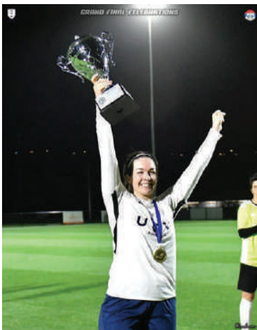
Pictured below— players from UOW FC after their Division 1 Grand Final victory