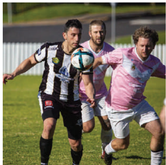
(Pictured above – Players from the Community League Competition during the 2022 season.