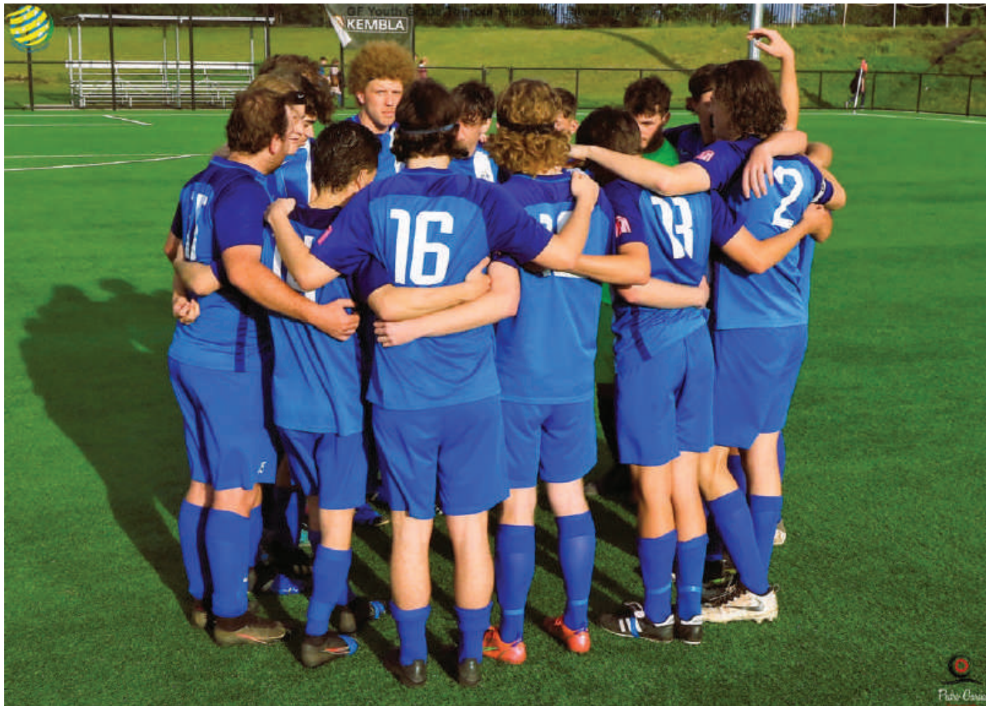
Pictured above – Players from Thirroul Thunder FC