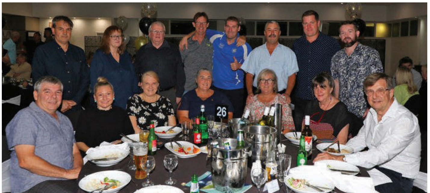
Pictured above – Photo's from the 2022 FSC Season Launch held at The Fraternity Club