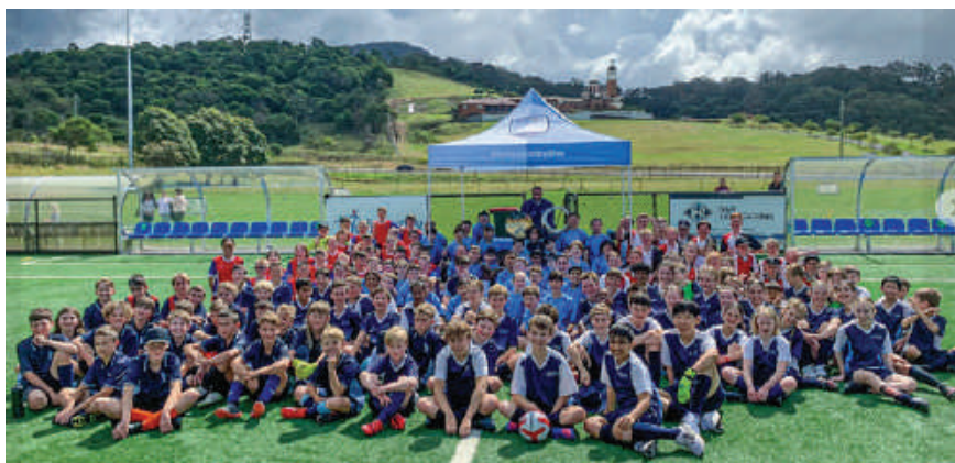
Pictured above – Heartbeat of Football representatives performing Heart Health Checks at Ian McLennan Park.

In 2022 we continued our relationship with Sydney FC with the running of School Holiday Clinics and the Skills Training Program. In September 160 students participated in the inaugural Sydney FC Schools Cup held at Ian McLennan Park which was a huge success and local juniors were also lucky enough to participate in the Sydney FC Game Day Experience.