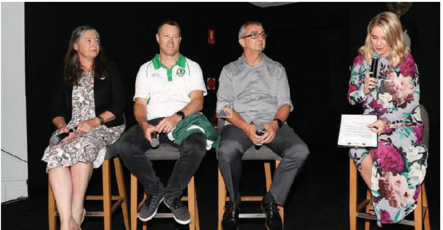
Pictured above – Photo's from the 2022 FSC Season Launch held at The Fraternity Club