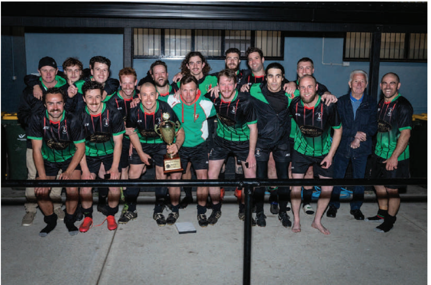
Pictured above – Hill Top FC celebrating their Grand Final victory in the All Age Peter Webster Cup