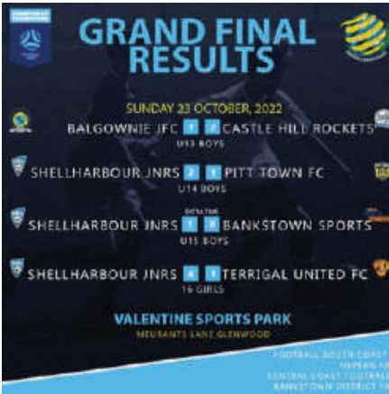
Pictured above: Results of FSC teams that competed in the FNSW Champion of Champions Grand Finals held at Valentine Sports Park