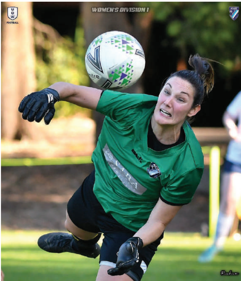
Pictured left—The Kiama Quarriers in full flight during the 2022 season.