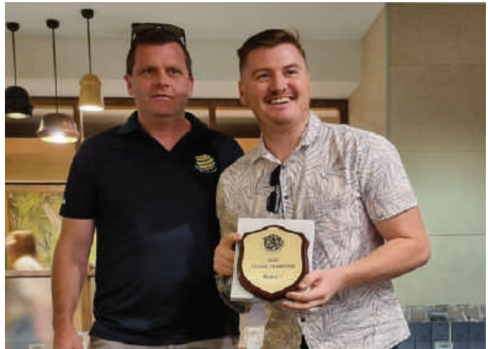
Pictured above - photos from the end of season Community League presentation held at Dapto Leagues Club