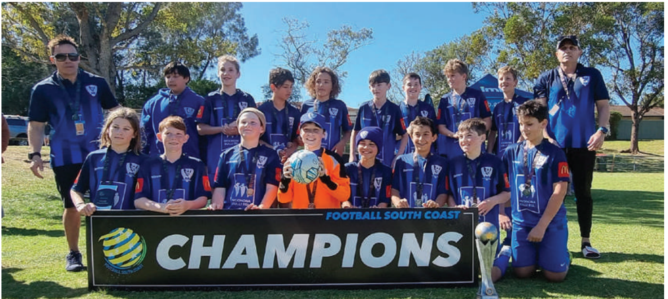
Pictured above – Bulli—U12 Grand Final Winners