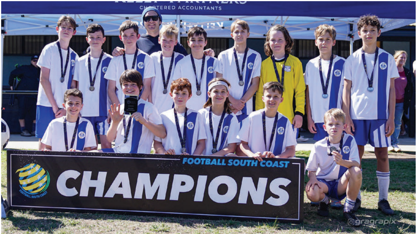
Pictured above – Thirroul Thunder—U13.4 Grand Final Winners