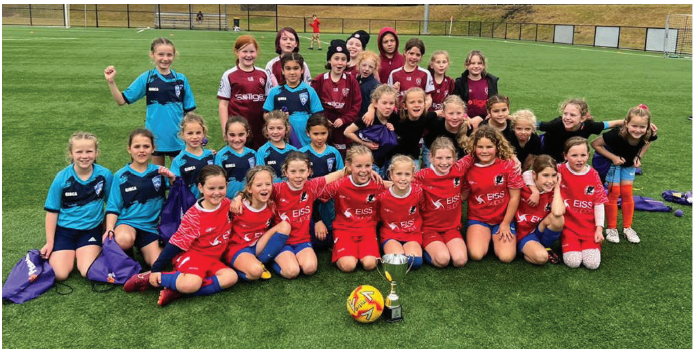
Pictured above – Club players from Shellharbour, Fernhill, Kiama and Unanderra participating in the FSC Mini World Cup