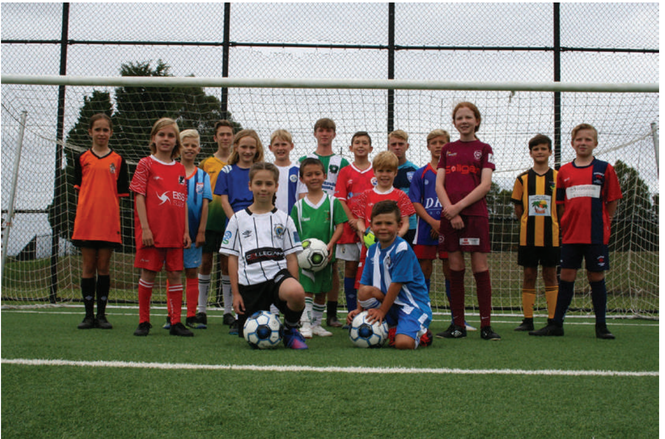
Pictured above – the 2023 Registration Launch Media Event