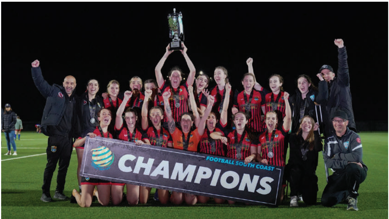
Pictured above: Shellharbour FC First Grade celebrating their Grand Final victory over Woonona FC at Ian McLennan Park