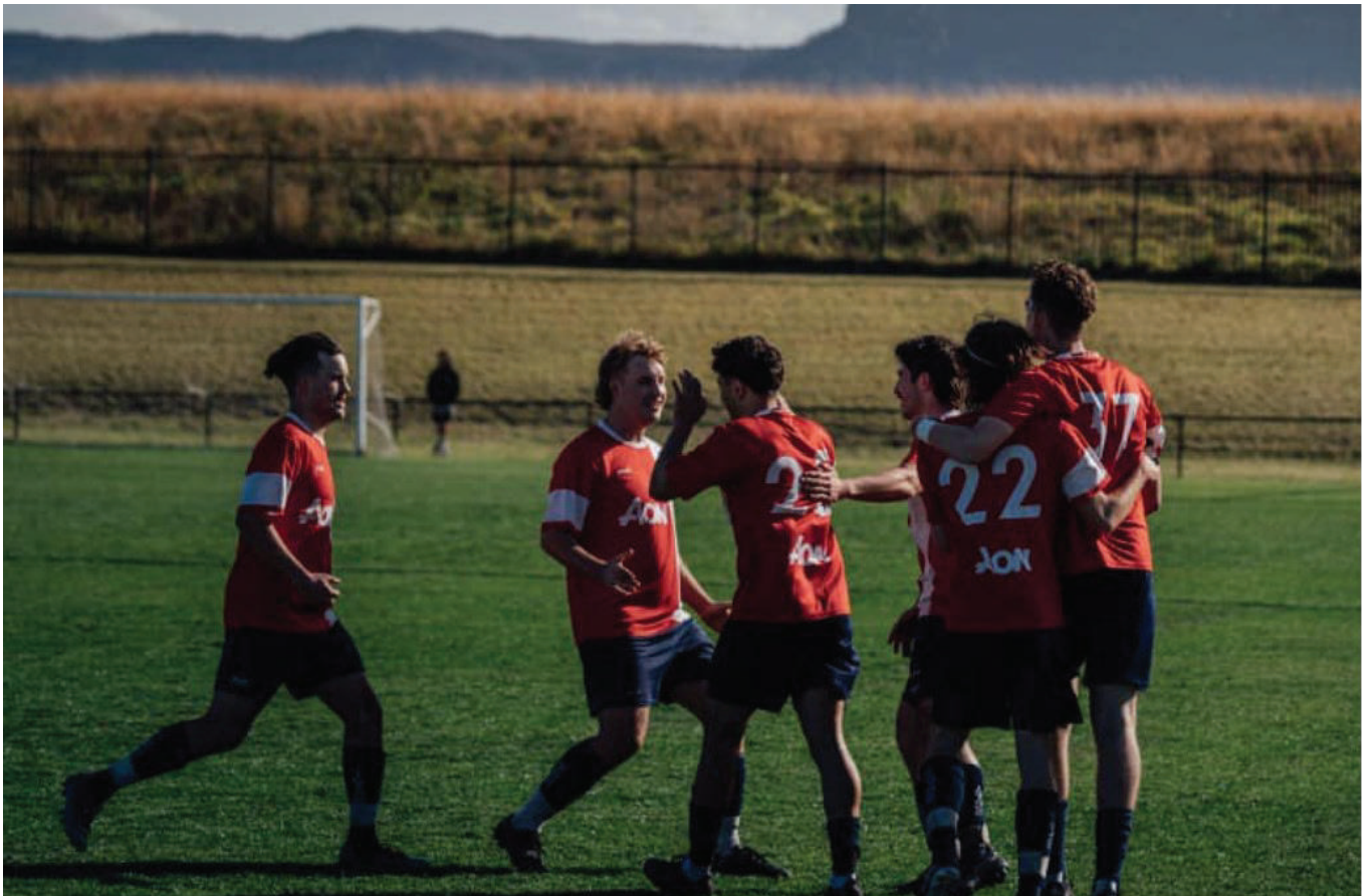
Pictured above – Figtree FC celebrating a goal at Ian McLennan Park