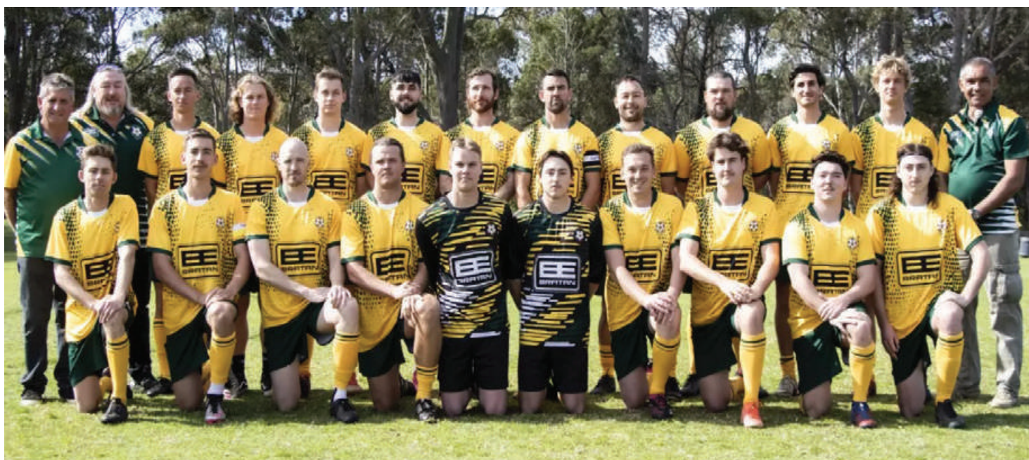
Pictured above – Shoalhaven FC were the 2023 Grand Final and League Champions in the Division 1 All Age Community League competition earning the right to promotion into the Men’s Premiership District League competition