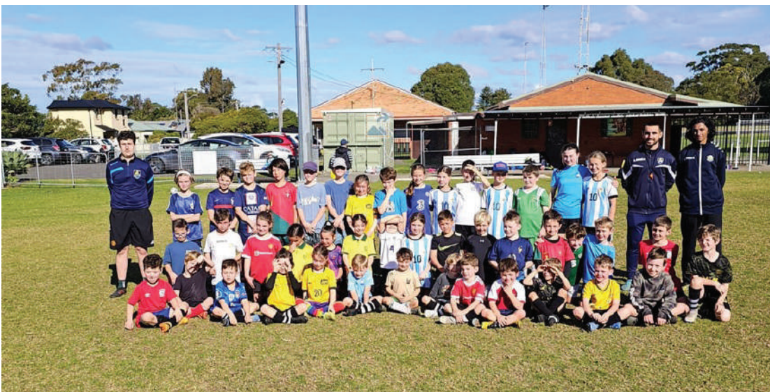
Pictured left – Players participating in the FSC School Holiday Clinic

In the July school holidays we delivered a Girls Only Mini World Cup to coincide with the FIFA Woman's World Cup. In total, 10 association clubs were represented at the tournament with 15 teams in total competing in the round robin and knock out format event between the ages of U6-U13s. The games were played in an amazing spirit and the level of competition was high amongst all the players.