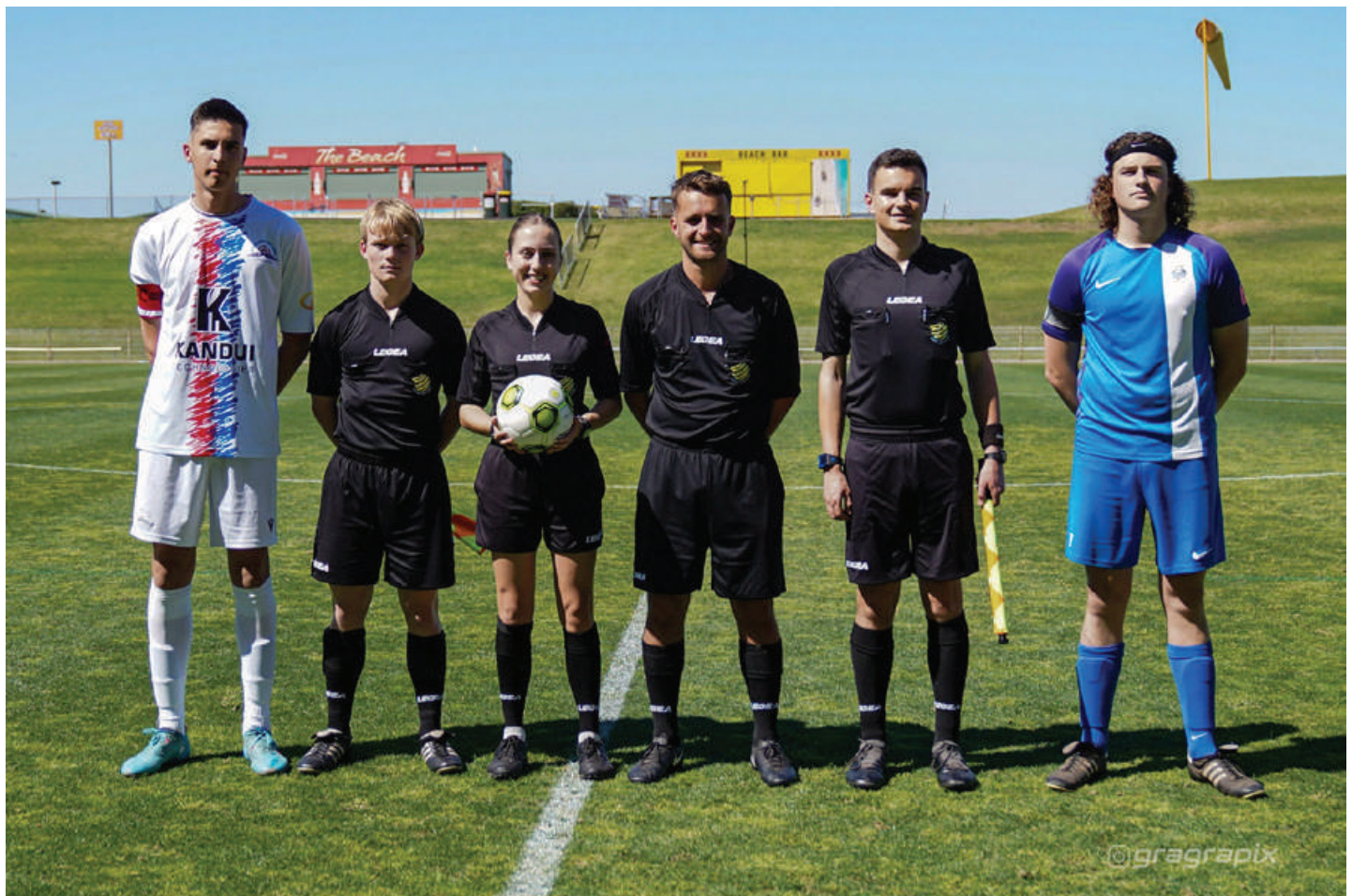
Pictured above – FSC Referees at the Premier League Grand Finals