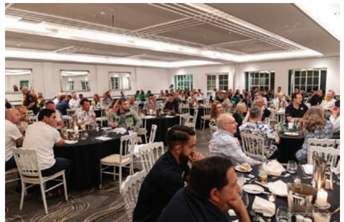
Pictured above - photos from the end of season Community League presentation held at The Grange