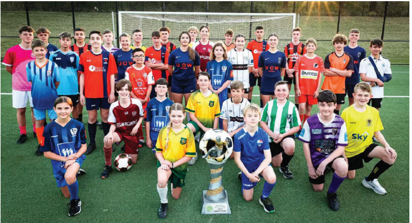
Pictured above – Clubs involved in the 2023 Grand Final Media Event