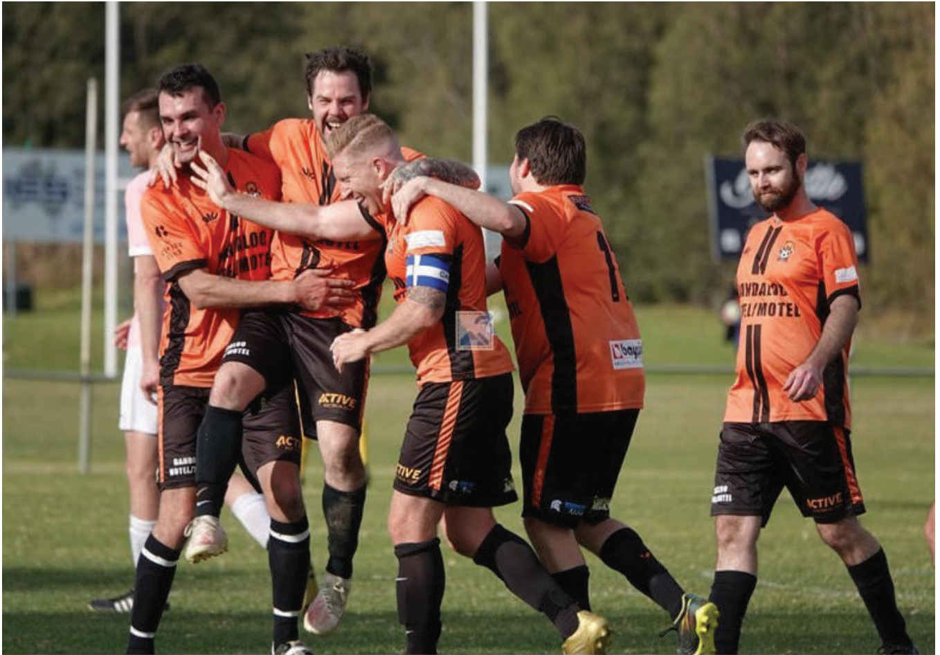
Pictured above – Dandaloo FC players celebrating a goal during the season