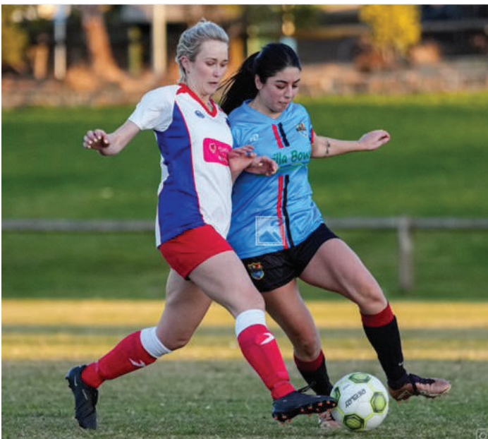
Pictured above – Woonona FC were crowned Premier League First Grade League Champions