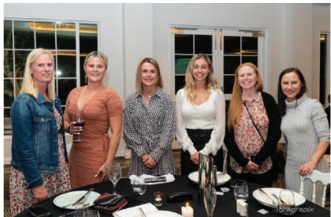
Pictured above: Photos from the End of Season Women's Presentation held at The Grange