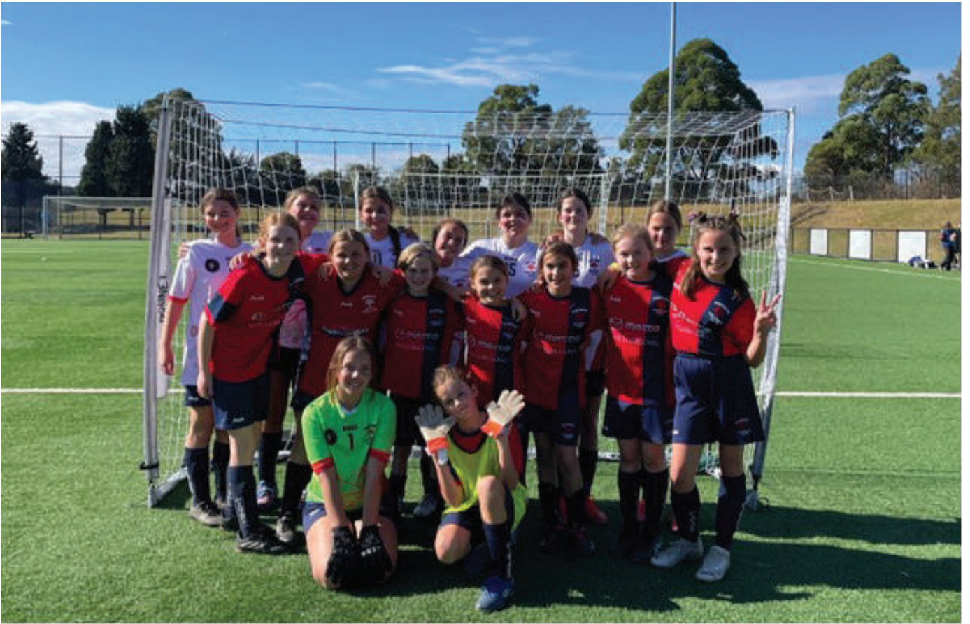
Pictured above – Players from Figtree FC participating in School Holiday programs.