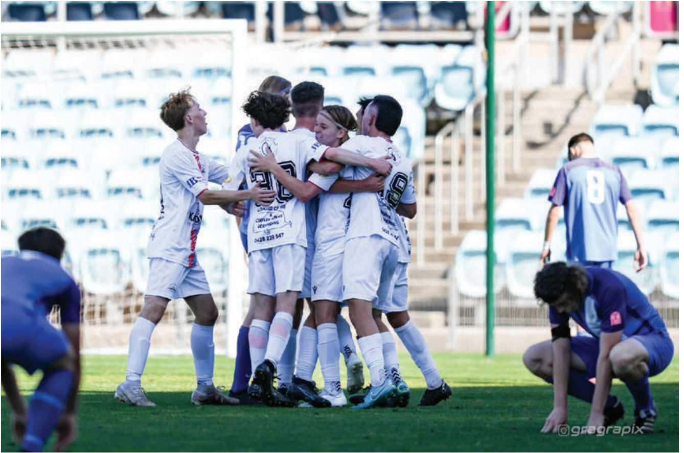
Pictured above – Gerringong Youth Grade celebrating during their Grand Final game against Thirroul