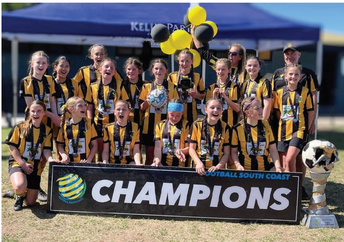
Pictured above – Helensburgh—U12 Grand Final Winners