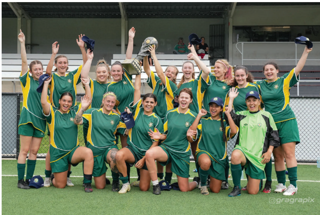
Pictured above: Shoalhaven FC were Community League Division 1 League Champions, Grand Final Winners and Bonnie Lassie winners.