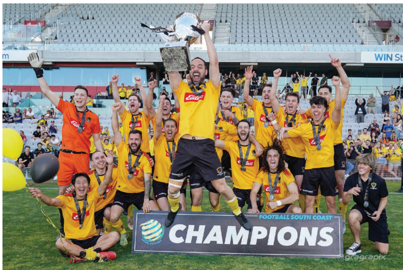
Pictured above – Players from Coniston FC celebrating their Grand Final win against Cringila Lions FC