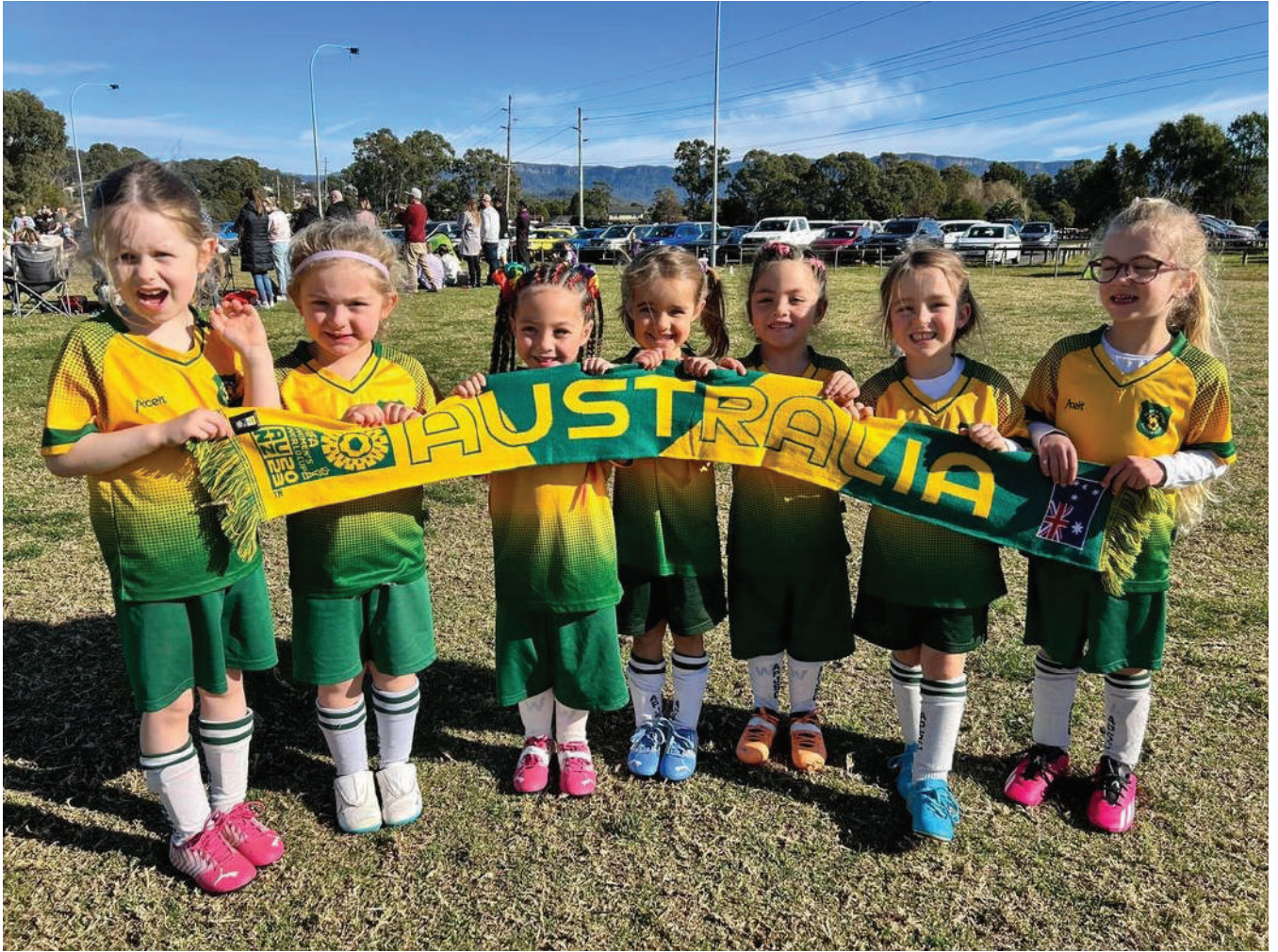
Pictured above – Players from Albion Park FC getting into the World Cup Spirit