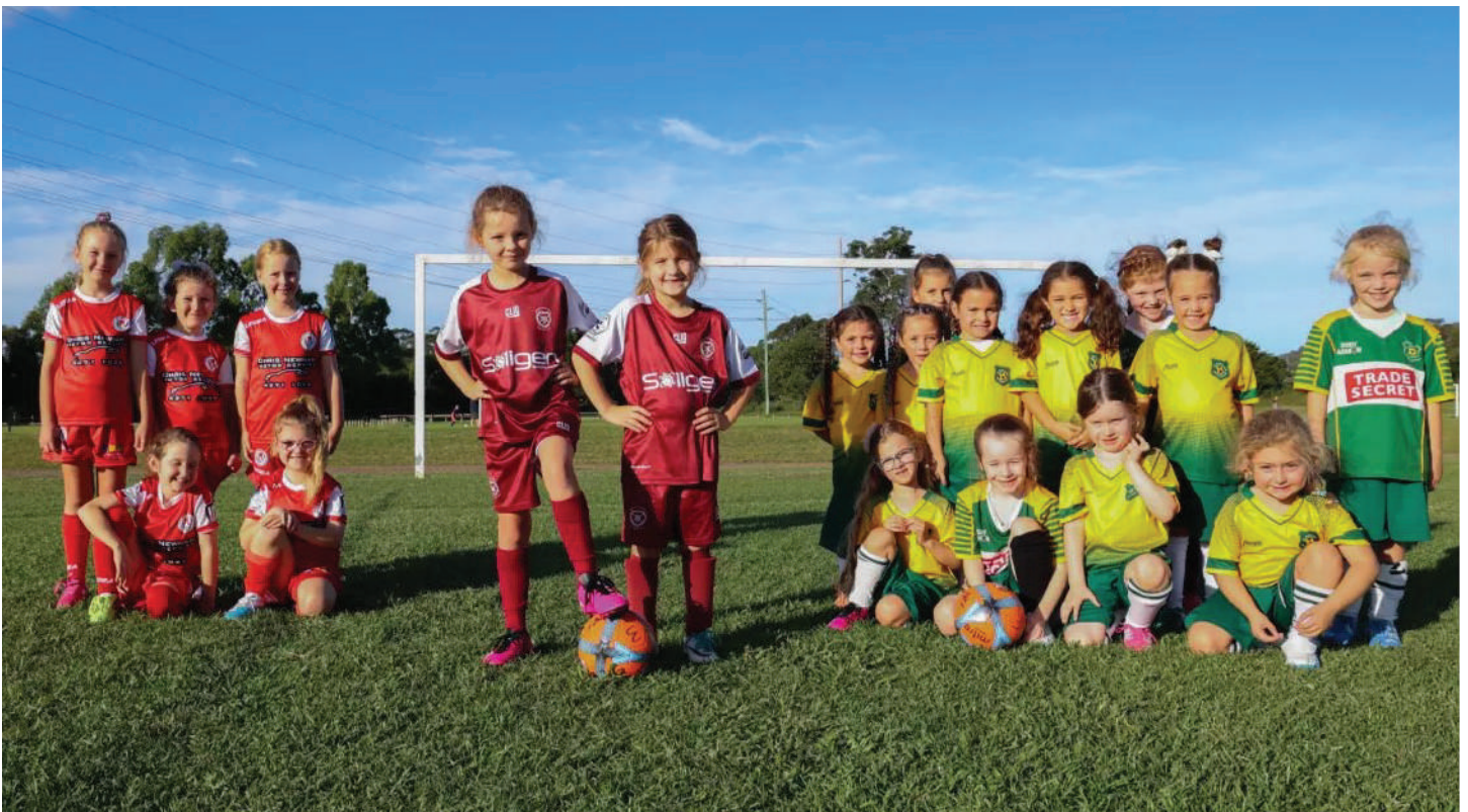
Pictured above – Players from the first Girls Only U6/U7 Competition