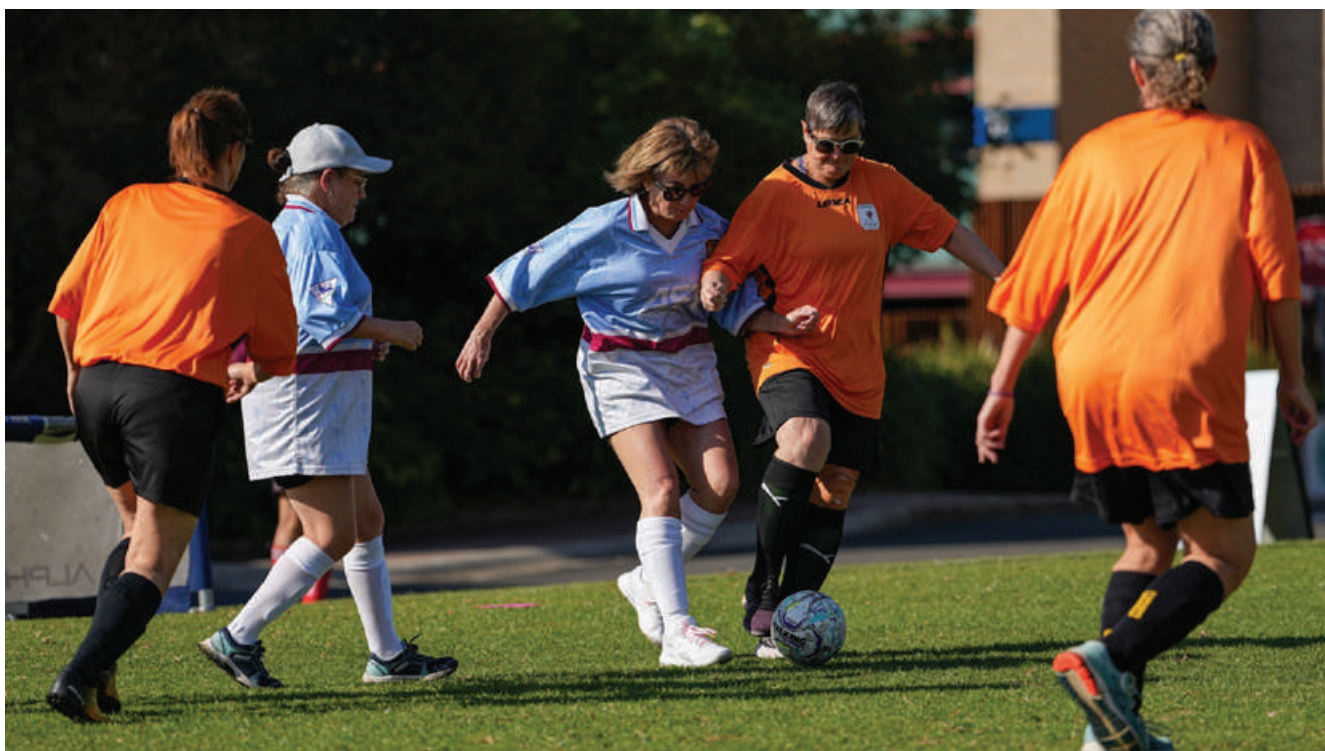
Pictured above – Players from the Walk the Field tournament held at the University of Wollongong

Walking Football is one such initiative and in 2023 we partnered with the UOW to bring the first ever Walking Football Tournament to the region. Walking Football is a growing form of the sport and is supported by weekly games. In addition, our partnership continued with MCCI and the Disability Trust and will continue to grow in 2024.