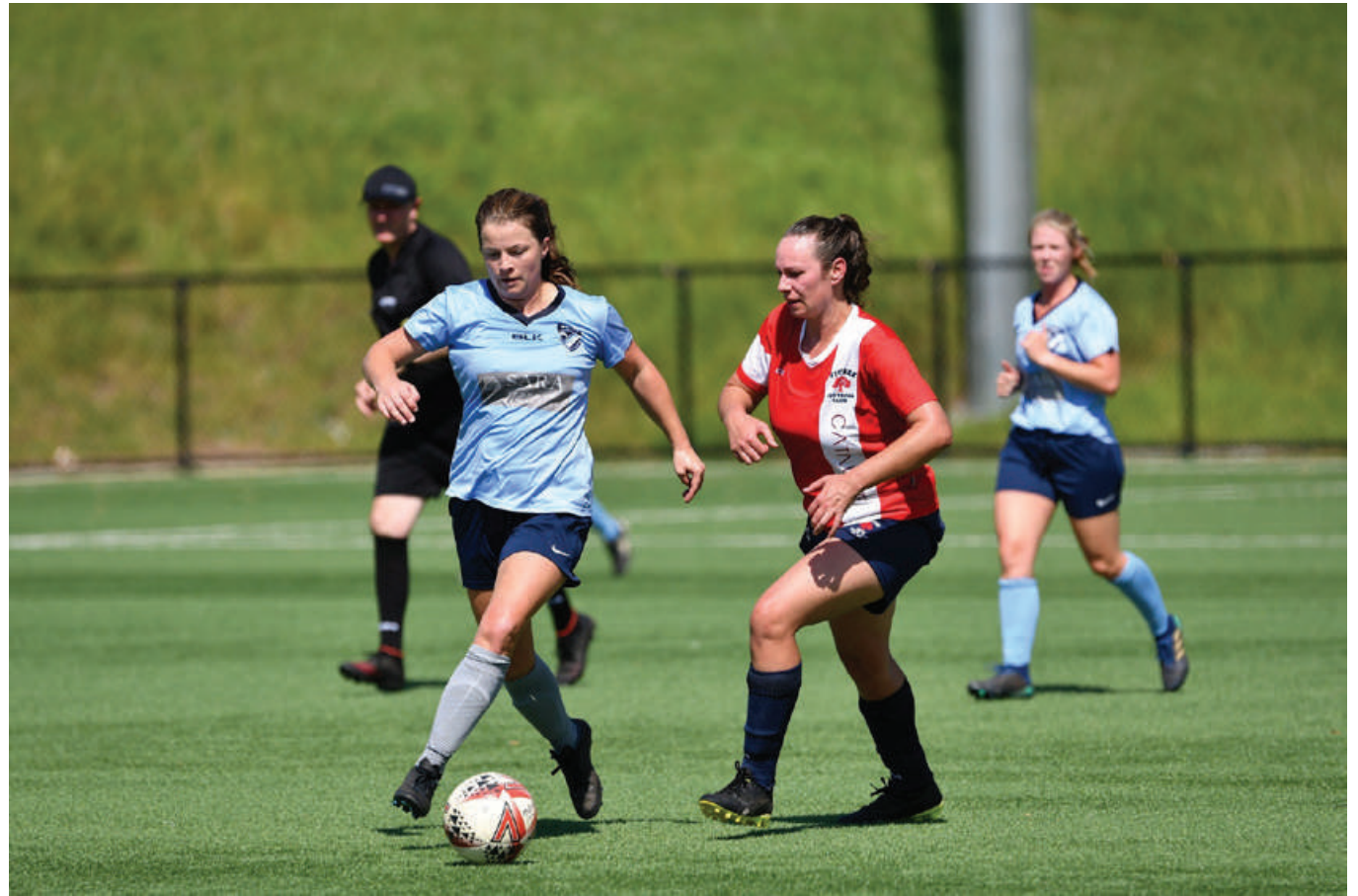
Pictured above (top) – Players from Coledale in action during the Women’s Community League Grand Final