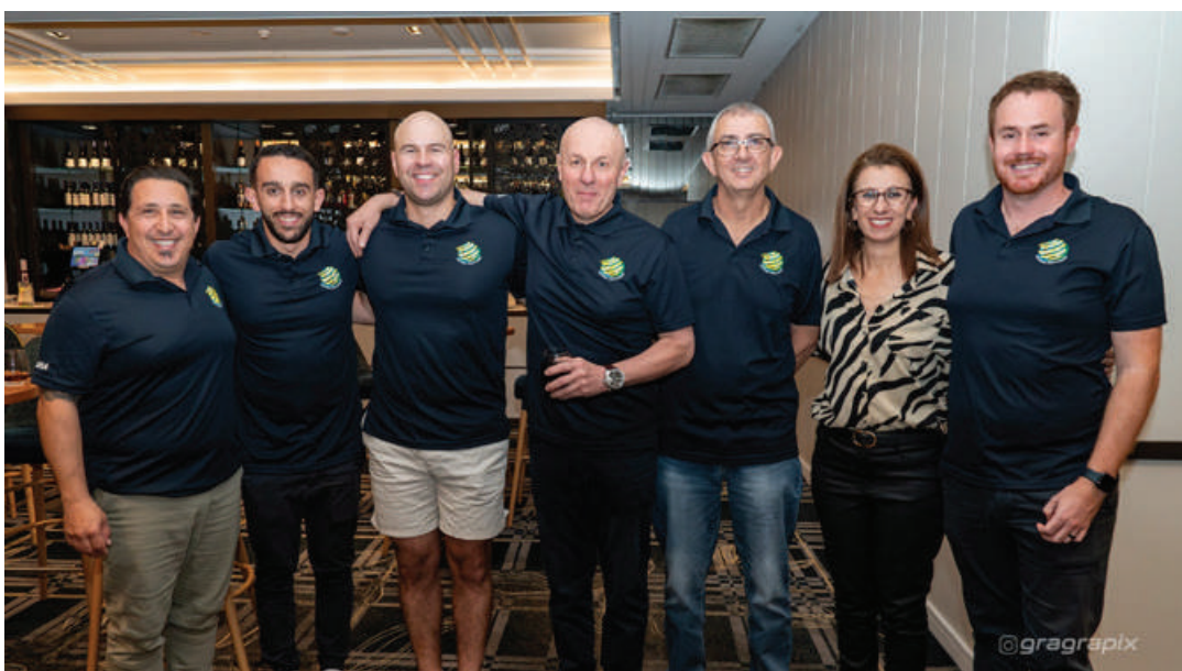
Pictured above – Members of the 2023 Community League Football Council with the FSC CEO

Head of the Community League Football Council