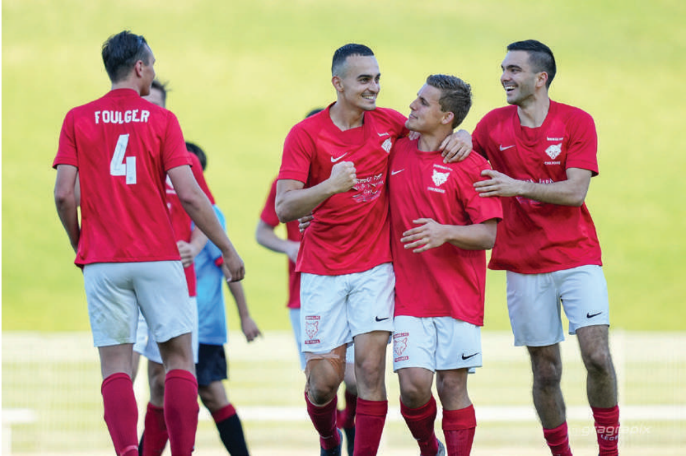
Pictured above – Players from Fernhill Foxes celebrating a goal in the Grand Final