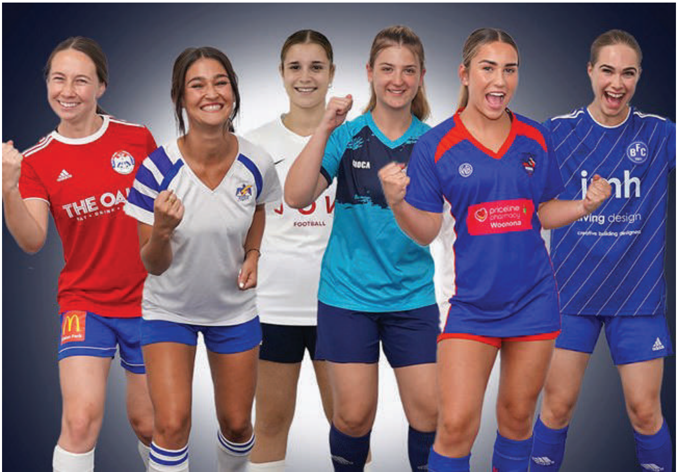
Pictured above: Players from all clubs participating in the inaugural Womens Illawarra Premier League