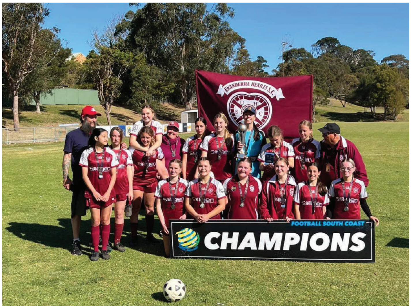
Pictured above – Unanderra —U16 Grand Final Winners